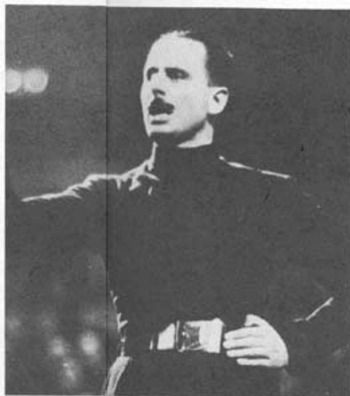
Sir Oswald Mosley European