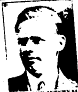
Col. Charles A. Lindbergh, in a radio address last Sunday evening, exploded a bombshell when he criticized the hectic war talk that has been going on in the United States since the outbreak of the European war.

War Mongers Get Douche of Good American Common Sense