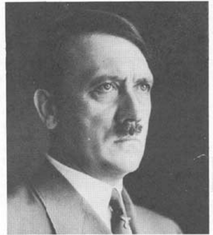
Adolf Hitler European

Lindbergh has been following the Nazi propaganda line in his speeches and writings for the simple reason that in most matters he agrees with the world's leading Nazi theorists. His statements reproduced on this and the next page are identical in thought, and sometimes identical in phrasing, to those of Adolf Hitler, Sir Oswald Mosley and Lawrence Dennis. Mosley was the leader of the British Union of Fascists and National Socialists until he was imprisoned for attempting to block the British defense effort. Lawrence Dennis is the leading theoretician in the American Nazi movement. Two of his books, The Coming American Fascism and The Dynamics of War and Revolution , are used as textbooks by American Nazis. As these comparisons show clearly, either Lindbergh is a spokesman for Nazism, or he is the victim of the greatest coincidence in the history of the world.