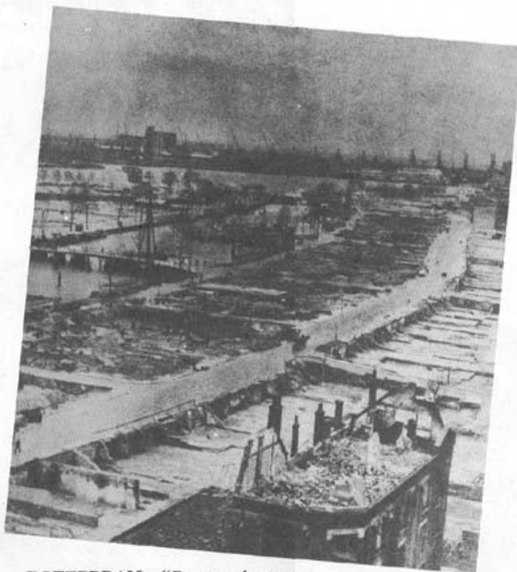
ROTTERDAM—"Revenge for senseless resistance," the Germans said.

On April 9, 1940, the German army invaded Norway.