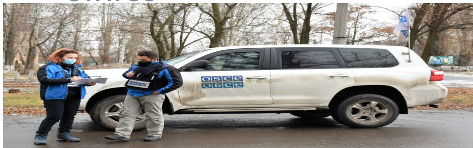
SMM on patrol in Verkhnotoretske, Donetsk region