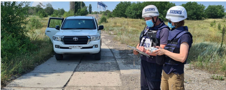
SMM patrol launching a UAV in Luhansk region