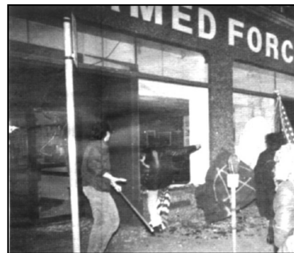
Anarchists attack recruiting center, Minneapolis

On March 17, 1988 the U.S. sent 3,200 troops to Honduras in apparent preparation for an invasion of Nicaragua. The response to this action was massive. In every major city and in hundreds of towns people took to the streets. The actions were militant. In countless cities government buildings or offices were occupied in sit ins. In those cities with strong Central America movements like San Francisco, Minneapolis, Toronto, and Boston demonstrations attacked government buildings, breaking windows and fighting with the police. The demonstrations went on day after day for a week until Reagan announced that the troops would be brought home. In all of the most militant