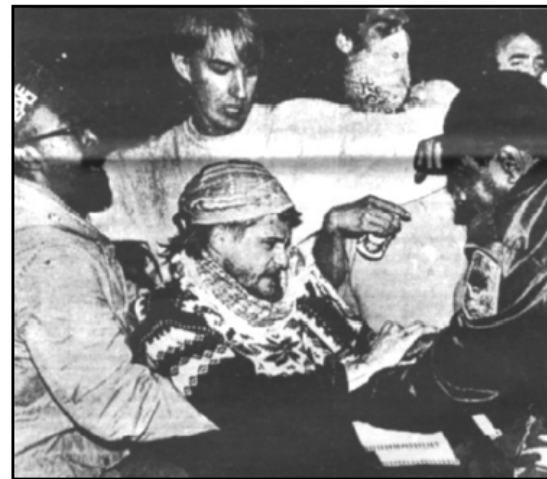
Anarchist unarrest at pentagon blockade

The Pentagon blockade was originally called by the Committee in Solidarity with the People of El Salvador (CISPES) and the Pledge of Resistance as an action against the US support for the right wing Salvadoran government. As at Langley there were two distinct conceptions of the blockade. The New York and Washington DC leaderships of CISPES and the Pledge basically wanted a symbolic civil disobedience and therefore planned a legal rally and a civil disobedience at a single entrance of the Pentagon. The anarchists (taking for this single action the name Mayday Network of Anarchists), the Progressive Student Network, and a number of local CISPES and Pledge groups influenced by the militancy of the Honduras actions wanted to engage in "mobile tactics" blocking access to the Pentagon parking lot and avoiding arrest as long as possible to prolong the actual disruption of work at the Pentagon.