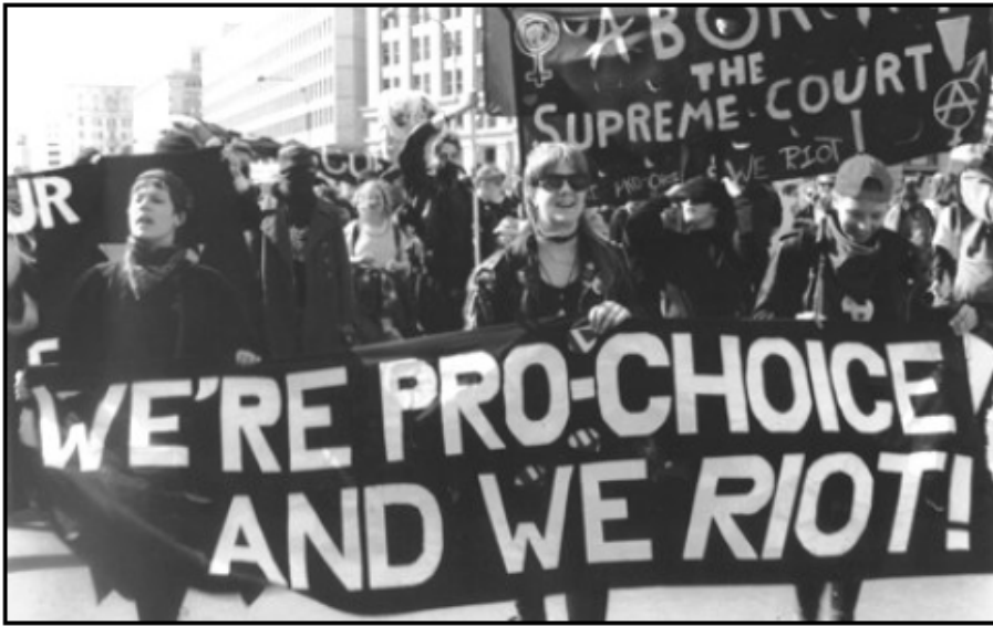
Anarchist contingent at "March on Washington for Reproductive Freedom"

broader social movements became more apparent.