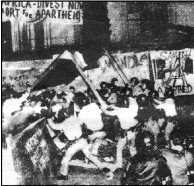
UC-Berkeley divestment shantytown attacked, early 1980s

The third significant element of the divestment struggle was that it exposed the direct complicity of local institutions (like colleges) in the oppression and