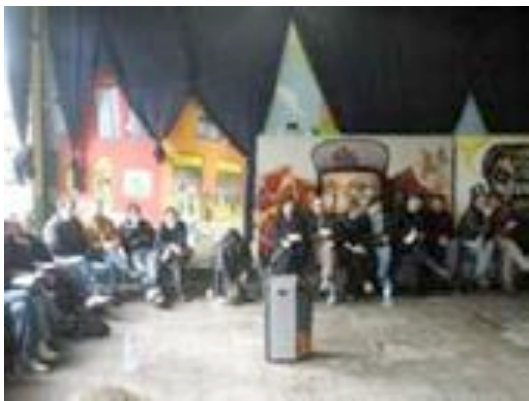
an assembly at a Social Center in Terrasa, Spain

But the more something is seen as impossible or even delusional, the more alluring it can appear. This is evidenced in a painting, in a rather typical