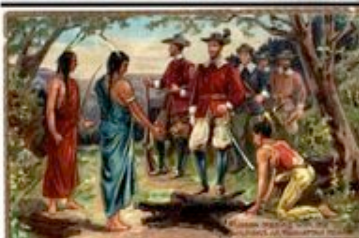
2 Holland Society of New York badges, 1909; 300 th anniversary of Henry Hudson's exploration of the river named for him

{excerpted from text posted at: http://www.16beavergroup.org/monday/archives/002771.php#more }