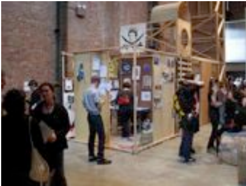
opening of the House Magic: BFC show as part of the University of Trash, May 10, 2009