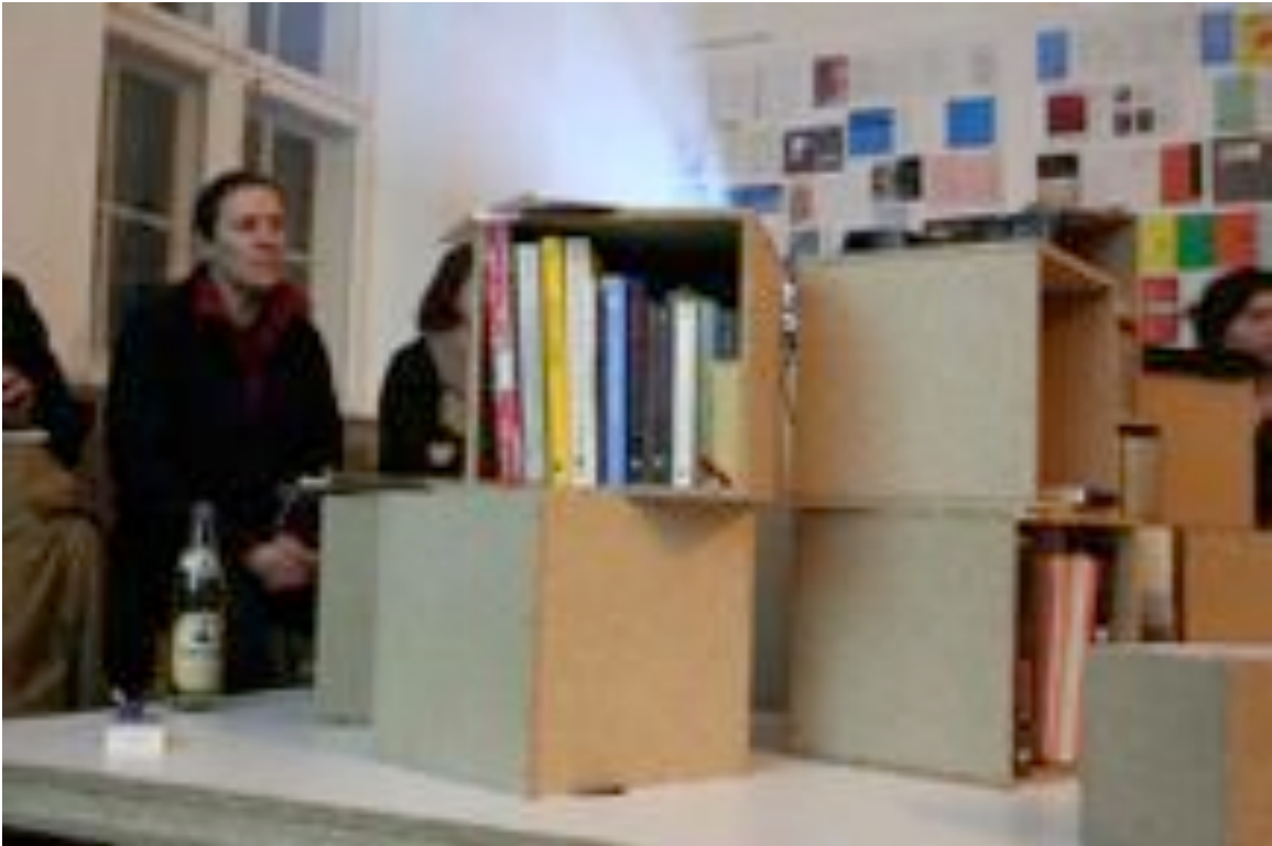
installation by the Archiv »Kultur & Soziale Bewegung« at Social Forum in New Yorck Bethanien, Berlin, Germany, 2006