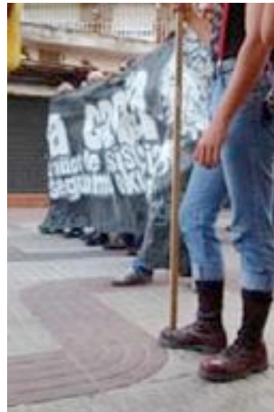
photo of Spanish "mani" (demonstration)

dangerously out of control but about the ideology that sanctions violence in the name of respectability. We need to think about what it means to be a citizen in 21st century global culture and about the treatment of those that effectively have their human rights revoked because they refuse, or are unable to conform to the dictates of consumer citizenship. We need, in short, to be aware that, as the global downturn deprives people of their homes and livelihoods, any one of us could end up on the wrong side of the divide that separates 'us' from 'them'. Any one of us could become a scapegoat for the unfocused anger which results when people relinquish responsibility for their own lives and then find themselves deprived of their freedom and dignity. Places like RampART exist because some of us believe that we can reclaim our freedoms but only if we work together in a spirit of mutual respect and toleration. Contact: rampart@mutualaid.org