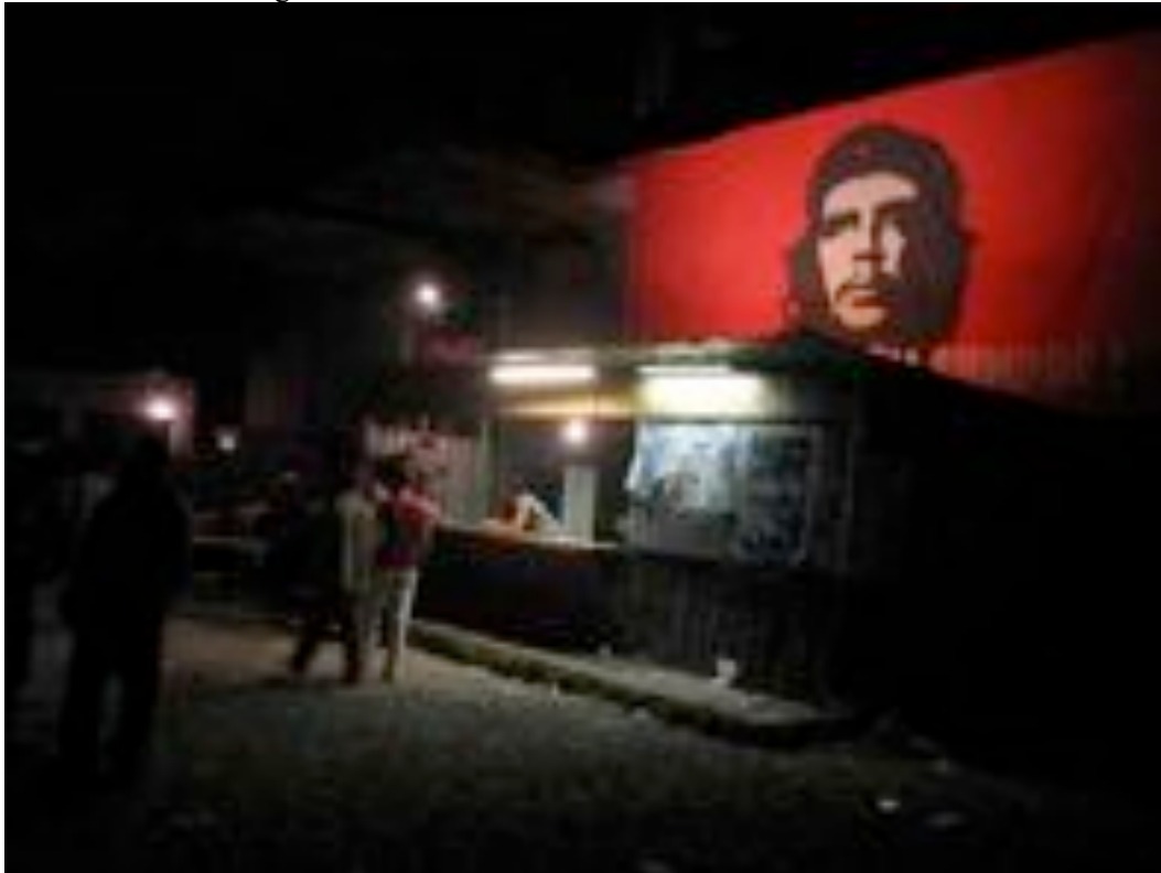
nighttime in the garden of Leon Cavallo center in Milan