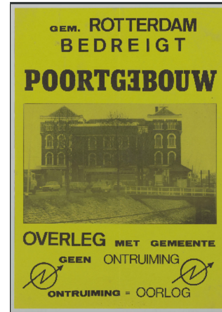
“Rotterdam Council threatens the Poortgebouw. No eviction. Eviction = War”

The Poortgebouw has occupied an important role in the alternative culture of Rotterdam and continues to do so. I hope the fresh energy of the new living group continues for many years into the future... 28