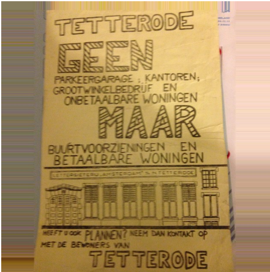
Flyer made by Tetterode soon after being squatted: "Tetterode – No parking garage, offices, big companies or unaffordable housing but neighbourhood concerns and affordable housing. Do you also have ideas? Then make contact with the people living at Tetterode"

It's also funny that the PVP communique mentions Tetterode, which was huge building squatted on 17 October 1981 in protest against the Amsterdam regeneration plans (the intention was to demolish it and build luxury apartments). The beautiful complex with entrances on the Costakade and Bilderdijkstraat in the west of the city was built between 1940 and 1947. The story of Tetterode is told in a book released in 1992 and published by De Balie, Stuurgroep Experimenten Volkshuisvesting (SEV) and Woningbouwvereniging Het Oosten. 7 Would be great to see a book like that with lots of photos all about the Poortgebouw!