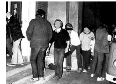
The actual squat! (Front door on left) 3

As part of a national action day with the title "wij jongeren eisen" ('we the youth demand'), a large group of people squatted the Poort. The pictures below show the action: