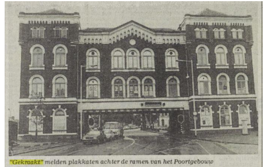
Poortgebouw soon after being occupied

(Caption reads: "'Squatted' say the poster behind the windows of the Poortgebouw')