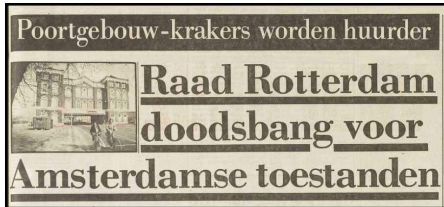
Headline reads: 'Poortgebouw squatters become renters: Rotterdam Council scared of Amsterdam style incidents.'

After a few years of being squatted, the Poort was legalised. The first big struggle of the Poort (but not by any means the last!) was won in October 1982 when the city council decided to legalise the building. If you read all the newspaper articles from the time, this was clearly a big deal. The squatters had negotiated hard, refusing to leave the building for fears that they would not be able to return, and arguing that they were better placed to do the renovations themselves. A factor was the tumultuous events in Amsterdam (and occasionally in other cities like Groningen and Nijmegen), where evictions of large buildings occasionally led to big riots. It's obvious to me that a militant position gets results, but only when you have a movement behind you.