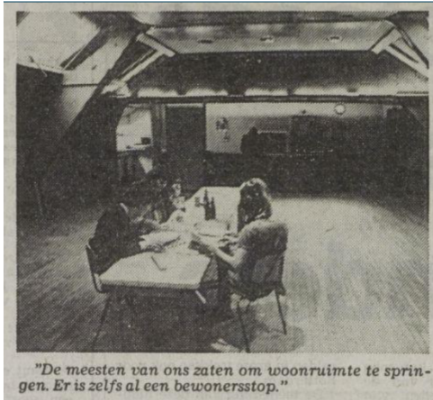
The Poort attic in 1980

I haven't been able to find anything about whether the arrestees were eventually convicted or not.