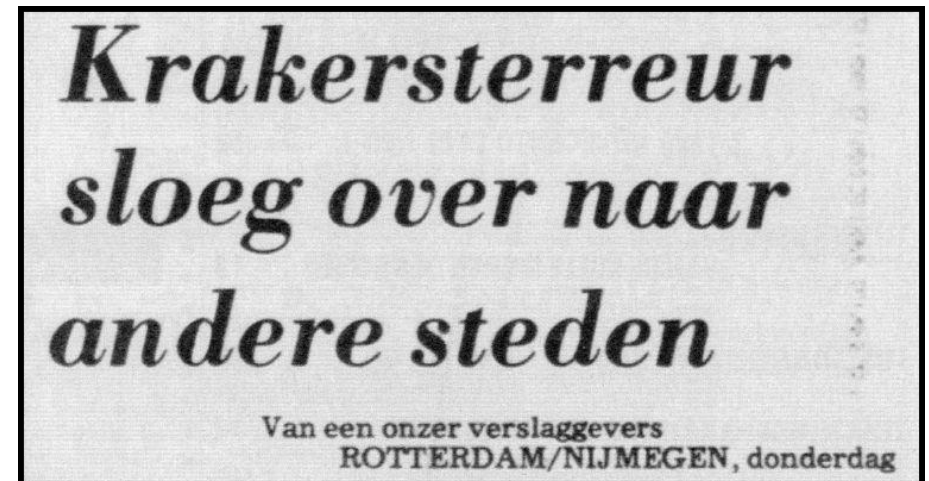
"Squatter terror hits other cities" 14

In another incident, three people, two of whom apparently lived at the Poort attacked the central police station with an improvised gas canister bombs. They caused a bit of damage to the front of the building and no-one was injured. Unfortunately they were picked up as they made their way home and for some reason admitted their actions.