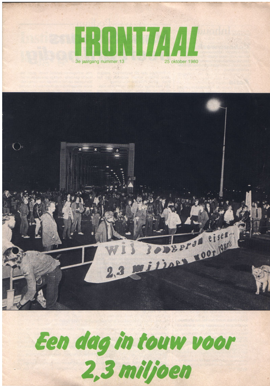
Front cover of Frontaal magazine, 1980 4