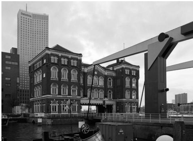
Poortgebouw from a similar angle more recently with the Deloitte tower and yuppy flats now behind it

Another problem is that trucks on the road which goes through the Poort quite frequently hit the underside of the building. This has been a perennial problem, which must be incredibly bad for the structure. In 1988, the Poort actually welded the warning booms of the bridge shut, so as to protest the problem.