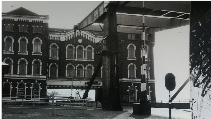
Poortgebouw soon after being squatted