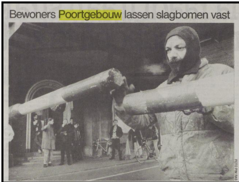
A workman opening up the boom again (front door of Poort can be seen behind) 27

There are other problems too. The hydraulic opening mechanism for the bridge was upgraded in the 1990s. The city did not predict any problems regarding the structural integrity of the Poort but now every time the bridge opens, the building shakes. This will be an expensive problem to resolve, but it's obvious that the root cause is the city shirking its obligations to maintain buildings affected by municipal works.