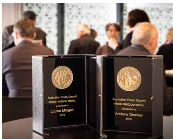
2019 Press Freedom Medals

In August 2019 it made a submission to the Parliamentary Joint Committee on Intelligence and Security into the impact of the exercise of law enforcement and intelligence powers on the freedom of the press. In September 2019 it made a submission to the Government on the Findings and Recommendations of the ACCC Digital Platforms Inquiry, and in June 2020 it made a submission to the ACCC regarding the News Media and Digital Platforms Mandatory Bargaining Code.