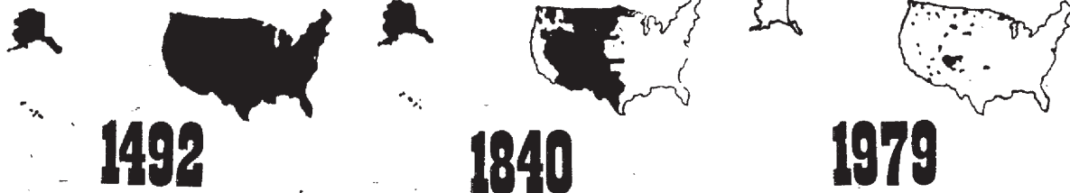
DWINDLING LAND BASE WITHIN THE U.S.