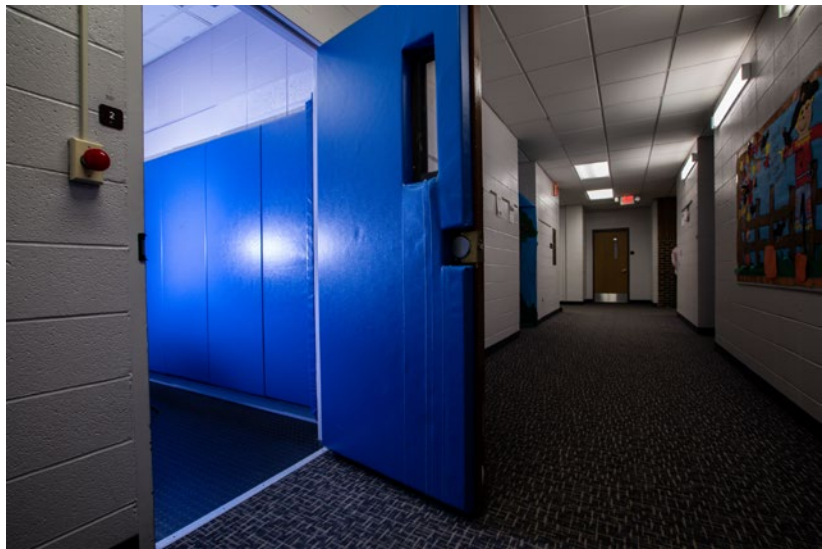
A seclusion room at Braun Educational Center in Oak Forest, Illinois.

“Disaster in the Pacific,” our series on deadly accidents in the Navy and Marines caused by inadequate training and faulty equipment , earlier received a Pulitzer Prize for National Reporting. The series also won this year’s White House Correspondents’ Association’s inaugural Katharine Graham Award for Courage and Accountability, the Gerald R. Ford Award for Distinguished Reporting on National Defense,