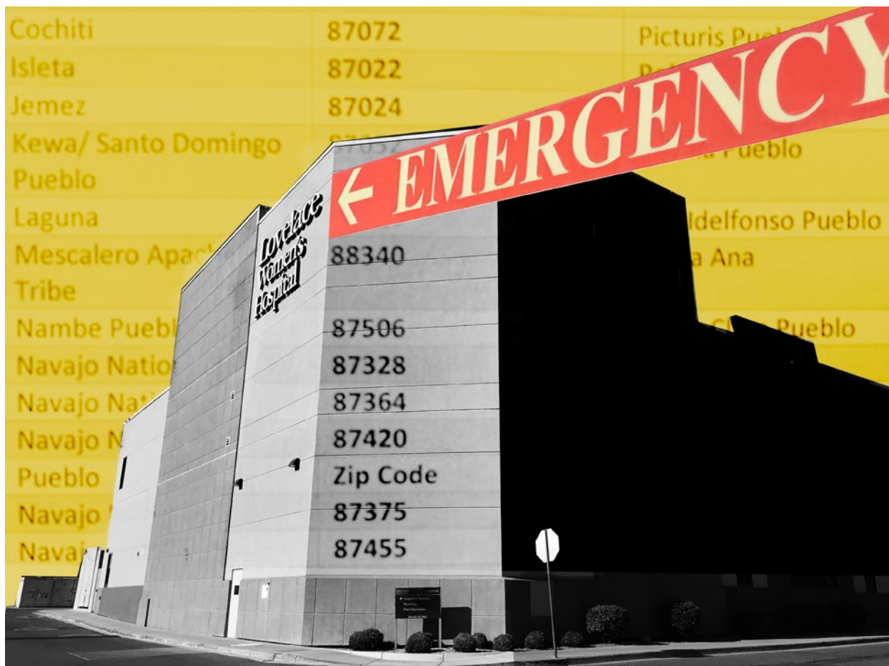
A federal investigation, spurred by our reporting, found Lovelace Women's Hospital in Albuquerque, N.M., violated patients' rights by profiling Native American mothers and separating them from their newborns.