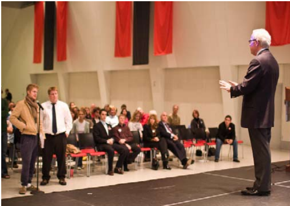
October 22, 2008: At the University of Cincinnati Bob Barr answers questions from audience