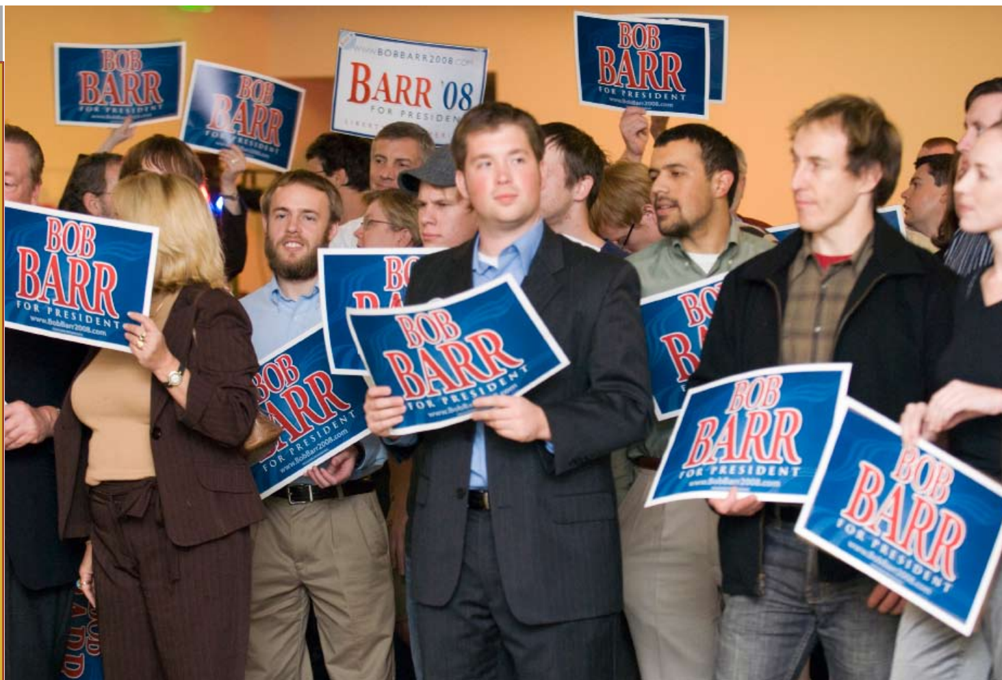
November 4, 2008: Supporters rally on election night to support Bob Barr's candidacy.

Office hours: 9 am-6 pm ET New Member Information: Call (800) ELECT-US E-mail: info@lp.org