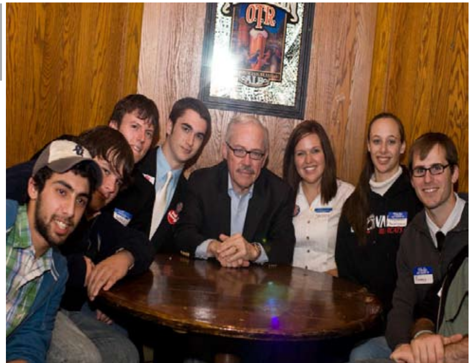
October 25, 2008: Bob Barr spends time with students at a MEETUP event in Cincinnati, Ohio

could be a good thing for taxpayers. Government generally grows much faster when the same party controls both the legislative and executive branches. Divided government might be healthy for Texas.”