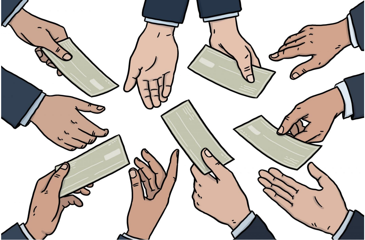
Illinois Policy Institute has called for government reform while channeling money to firms owned by insiders.