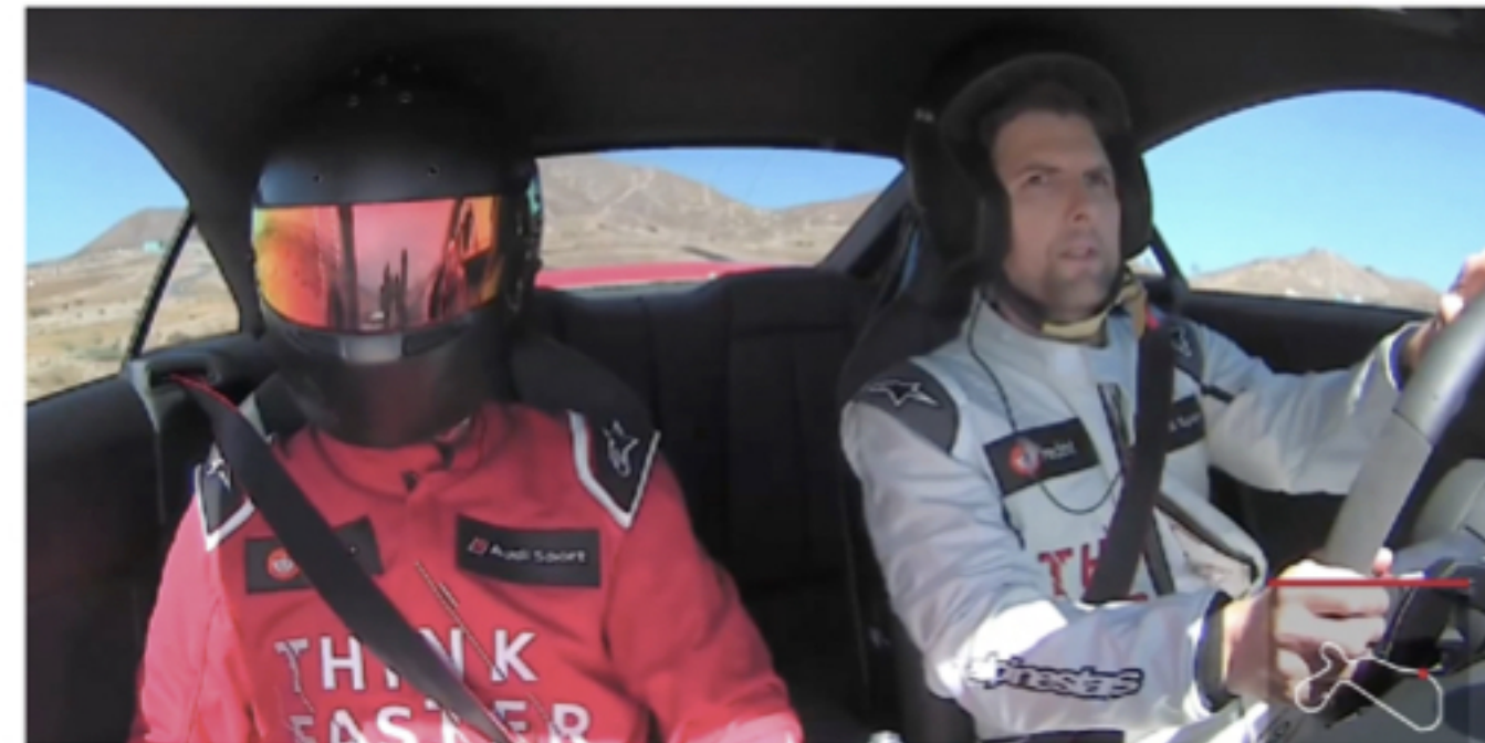
Adam Scott took questions on his favorite co-stars and memorable moments while navigating a race course.