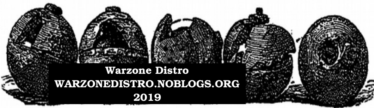
3. Bombs used in evidence, after analysis by chemists.