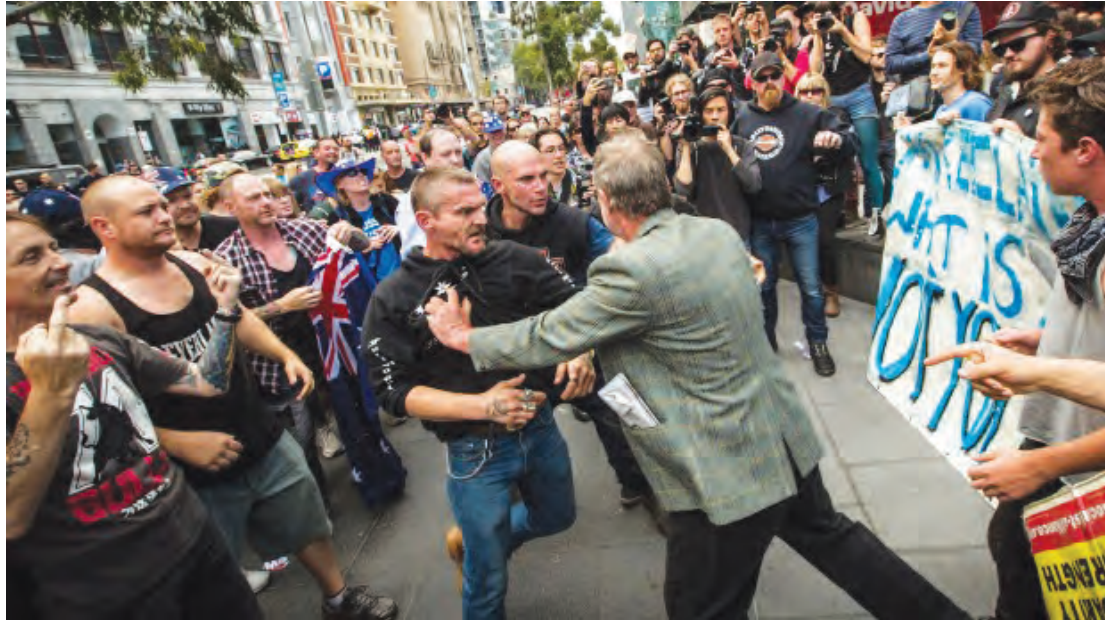
Melbourne, April 2015: Fascists (on the left of picture) participating in the ultra-Islamophobic "Reclaim Australia" rally threaten and use violence against anti-racist counter-demonstrators. Fascist forces not only have disgusting views but are people organised to commit violence against Aboriginal people, non-white ethnic communities, leftists and the workers movement. The idea that fascists can be peacefully debated is not a viewpoint based on reality.

The first "Reclaim Australia" rallies on 4 April 2015 were the biggest open mobilisations of far-right racists in Australia in a long time. With the notable exception of Melbourne, in most places where they rallied on April 4 the racist extremists outnumbered anti-racist counter-protesters. In Sydney, Australia's largest and most multiracial city, the April 4 counter-demonstration was particularly weak. Many long-time anti-fascists did not turn up to the anti-racist counter-rally, organised mainly by the Solidarity group, because the rally leadership's avowed strategy of ruling out any attempt to shut down the white supremacist "Reclaim Australia" mobilisation either positively turned off – or otherwise did not inspire – many staunch anti-fascists.