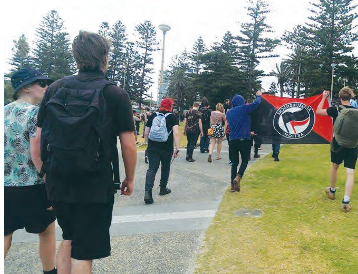
12 December 2015: Anti-fascists on the march at an anti-racist action on Cronulla on the tenth anniversary of the white supremacist riot there.

Participating in yesterday’s anti-racist action were student activists from Sydney University, anarchists, supporters of Socialist Alternative, Aboriginal activists and Trotskyist Platform supporters. A weakness of the mobilisation was that it was not able to win many newer people into the anti-racist struggle – that is individuals not connected to any of the activists circles involved in organising the demonstration. Furthermore,