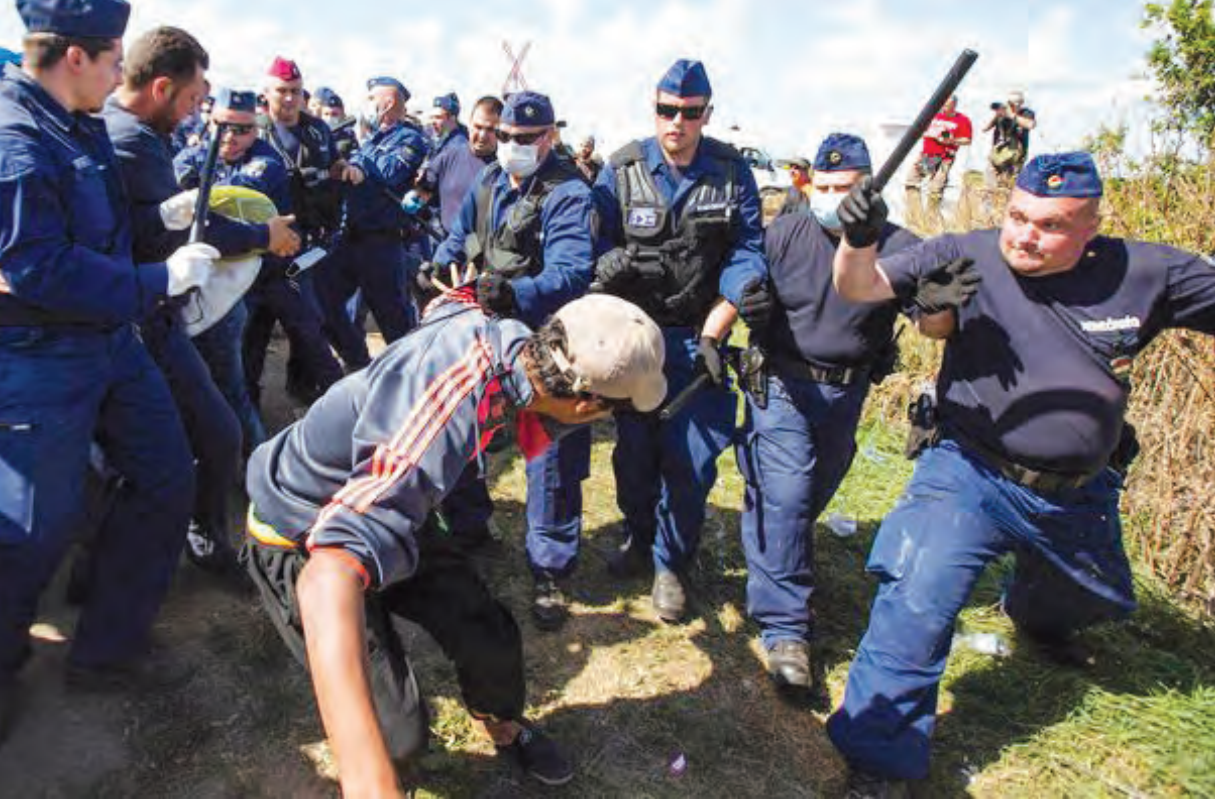
September 2015: Hungarian police brutally attack refugees. Capitalist counterrevolution in Hungary has led to an explosion of racist violence by the Hungarian police and fascist paramilitary groups.

Nevertheless, the presence of a bureaucratic administration – with all its accompanying corruption and the fact that ordinary workers were not involved in decision making – prevented the socialistic economy of the USSR from reaching its full potential, something that became more pronounced the closer that the USSR actually came to catching up with the economies of the richest countries. Furthermore, the material privileges of the bureaucracy (as petty as they were compared to the exorbitant wealth of tycoons in capitalist countries) and the suppression of workers democracy depoliticized the masses and weakened their commitment to socialism – even while socialistic rule had greatly improved their lives. All this made the USSR brittle in the face of the gigantic military, economic and political pressures it faced from the capitalist powers who were/are determined to crush any workers state. When a small layer of capitalist counterrevolutionaries backed by Washington, London, Tokyo and Canberra amongst others made its bid for power in the USSR in 1991, the Soviet masses had, in fact, become so depoliticized that most of them did not resist in any effective way at