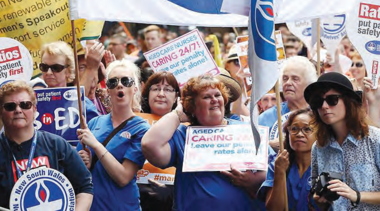
4 March 2015: Thousands of trade unionists march through Sydney city in a rally for workers' rights and against cuts to social services. Workers demanded an increase in nursing jobs, opposed cuts to Medicare and demanded an end to the privatisation of electricity and public hospitals. A united movement – energised by the power of trade union industrial action – must be built to demand free quality public health care for all, truly free public school, TAFE and university education, jobs for all, an end to the sell-off of public housing and a massive increase in public housing.

much lower Newstart Allowance. If this isn't bad enough, those single parents who have part-time jobs were hit with even more savage cuts to their income as the Newstart Allowance is more ruthless than the Parenting Payment in cutting payments to those who do manage to find any part-time work.