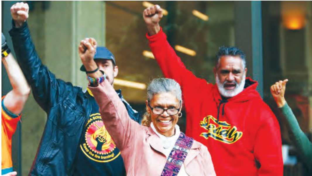
27 August 2015: Key Aboriginal activists spearheading RATE confident as the struggle heads towards securing gains for affordable housing for Aboriginal people.

development planned by Deicorp and the Aboriginal Housing Company.