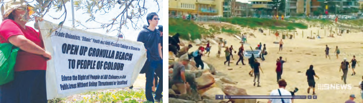
Taking the Beach: A chunk of the demonstrators at the 12 December 2015 anti-racist action in Cronulla jumped down rocks to symbolically stand on part of the beach where ten years earlier it was racist hordes who violently rampaged and where since the riot the number of coloured people using the beach has drastically diminished. A task remains for the workers movement and Left to build a mass convoy of trade unionists, coloured people and anti-racists to go from Sydney's multiracial, working class southwest to Cronulla Beach to assert the right of people of all colours to safely use this public space and to finally re-open the beach to coloured people. One of the Trotskyist Platform banners carried at the December 2015 demonstration (Left) advocated this perspective.

oppressed – need to mobilise now to oppose racist anti-terror laws, to demand freedom for the refugees and full rights of citizenship for all asylum seekers, immigrants, international students and “guest workers.” The struggle against racist attacks must be connected to a struggle to unleash a class struggle fight against the unemployment, casualization of jobs and cuts to social services that cause some all too misguided souls to seek salvation in radical racist so-called “solutions.” As part of building such a class-struggle fightback we must also put shoulders to the wheel within our unions and replace the current pro-ALP politics that leads the union movement with a militant class struggle and internationalist perspective.