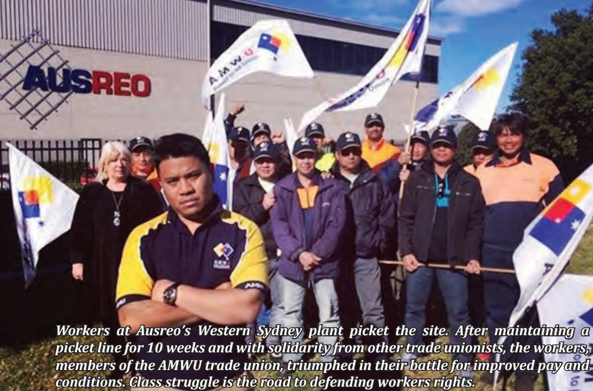
Workers at Ausreo's Western Sydney plant picket the site. After maintaining a picket line for 10 weeks and with solidarity from other trade unionists, the workers, members of the AMWU trade union, triumphed in their battle for improved pay and conditions. Class struggle is the road to defending workers rights.