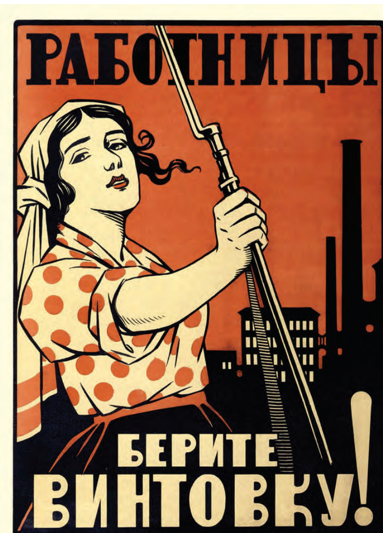
Top of previous page: “Beat the Whites with the Red Wedge” Famous Russian Civil War poster. “Whites” was the name given to the capitalist-landlord forces that sought to overthrow the young Soviet workers state. By the great Soviet designer/artist El Lissitzky, this poster was made in the Byelorussian town of Vitebsk and flyposted on its streets in 1920 at the time of the threat of invasion by the forces of bourgeois and landlord Poland. A fusion of Bolshevism's new communist politics and Kasimir Malevich's equally new art movement of Suprematism, it became an almost mythical symbol in the revolutionary struggle, representing as it does the Reds, surrounded by light, stabbing the heart out of the old feudal and capitalist world surrounded by darkness.

“Women Workers, Take Up Your Rifles” declares a poster from the early days of the Russian Civil War, circa 1918, calling upon working class women to join the fight against the increasingly foreign-armed enemies of the workers' and peasants' revolution in Russia.