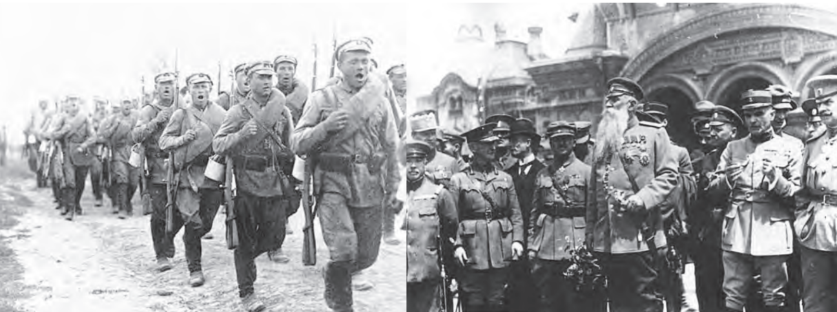
After the October 1917 workers' revolution in Russia, the deposed capitalists and world capitalist powers joined together to organise a bloody civil war to attempt to overthrow the new socialist-based system. Right: Officers from Western imperialist powers meet with representatives of counterrevolutionary Russian leader Alexander Kolchak. Left, March 1920: Troops from the counterrevolutionary Russian White Army march forward.

We must be on high alert after the workers' revolution for the former exploiters will still have plenty of money, the networks, the connections, the knowledge and the expertise to inflict harm upon the fledgling, socialist society. We can have no doubt about it: these vestiges of the former ruling capitalist class will agitate for a counter-revolution.