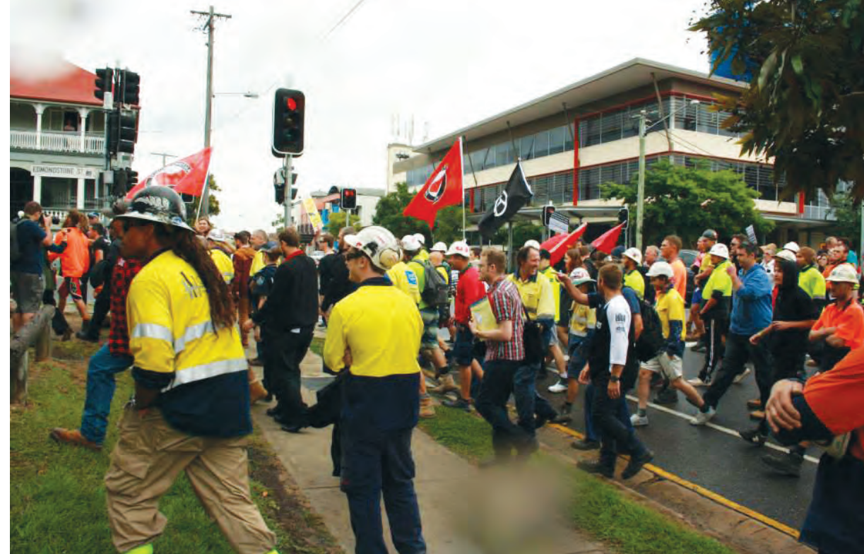
Brisbane, 2 May 2014: Trade unionists from the construction industry were in the forefront of an action that swept the white supremacist Australia First Party off the streets. Mobilising trade union contingents is crucial to anti-fascist struggles. Union contingents represent social power and carry with them the implied threat of industrial action if they are attacked. Workers' contingents at anti-fascist mobilisations have the potential to compel police intent on defending the fascists to stand aside, thus allowing the fascists to be driven off the streets.

It is true that the fascists, right now, do not have the strength that they had in the days of the Old and New Guards. However, their neo-Nazi counterparts in Europe have been breeding at an alarming rate feeding off the huge unemployment and insecurity caused by decaying capitalism and its severe economic crises. Right now, white supremacist outfits are succeeding in whipping up more and more violent racist attacks on coloured individuals. Working class people cannot allow non-white members of our class to be terrorised in this way. We cannot afford to allow people from a non-white background to be so intimidated that they will be unable to undertake the crucial role that they have often played in the struggle for all of our collective rights. We cannot and will not allow Hitler-loving lunatics to divide our side with racism.