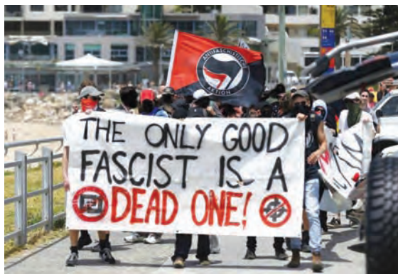
Left, December 2005: Hordes of rednecks bash any coloured or other “ethnic” person they could find on Cronulla Beach and surrounding area. Ten years later (Right), it was militant anti-fascists who formed the loudest, most prominent demonstration in the area. The opposite of ten years earlier, it was any racist filth who were present near the Beach who would have felt the most intimidated, at least if they were within the area near the anti-racist march route.

12 December 2015 – Today, brave people of all colours will take a stand against racism on the shameful anniversary of the racist riot on Cronulla Beach. Ten years ago in Cronulla thousands of racists savagely rampaged against people of Middle Eastern and South Asian backgrounds and, indeed, against anyone without white skin . An Aboriginal youth and many people of Afghan, Bangladeshi, Iranian and Lebanese background were amongst those brutally bashed. The riot was always meant to target all coloured people: it was openly built as “L_b and W_g bashing day.” The disgusting radio shock jocks, like Alan Jones, who promoted the racist riot ranted especially against “Lebanese Muslims.” During the riot, at least one woman who was wearing Islamic head dress had her headscarf pulled off as she fled violent attackers. However, people from all religious backgrounds were attacked