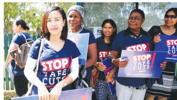
In 2015, teachers, staff and local residents across NSW protested against cuts to TAFE. The government's cuts have seen hundreds of TAFE teaching jobs slashed and whole TAFE courses axed.

As usual the ruling class is doing to Aboriginal people what they are doing to all working class people in an especially severe way. The WA government is trying to forcibly close hundreds of Aboriginal communities and drive Aboriginal people out of their homes and communities. Everywhere federal and state governments are refusing to fund