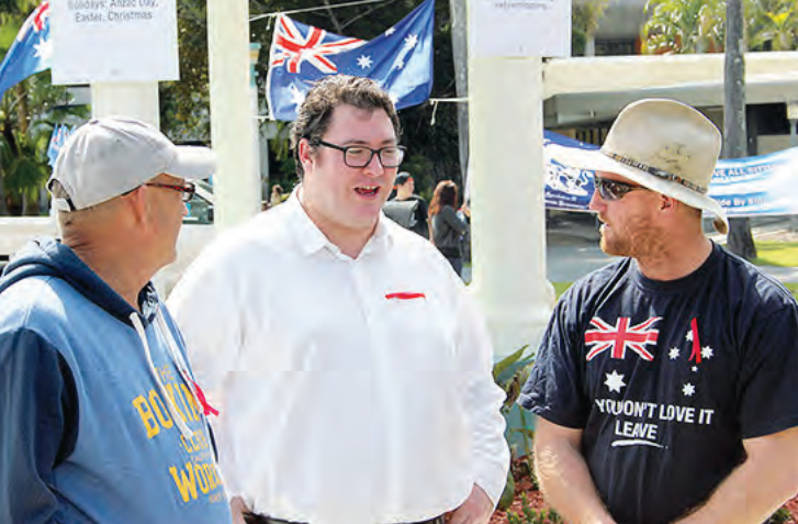
George Christensen (Centre), an MP from the federal Coalition government, spoke at the 19 July 2015 “Reclaim Australia” racist rally in Mackay. Small-l liberal figures and their social democratic promoters claim that mainstream politicians can be won over to the struggle against far-right racism. But, actually, these politicians are a big part of the reason why the extreme racist forces are growing.

Unfortunately, at this point what was warned against in our leaflet is, for the moment, coming to pass. The white supremacists largely got away with being able to foment their race hate on 4 April 2015 (and indeed on July 18/19) and as a result those unorganised racist bigots sitting at home watching became more radicalised. This has contributed at least in some way to the increase in racist attacks on the streets over the last few months. The one partial exception on April 4 (and also on July 18/19) was Melbourne, where the fascists’ ability to hold their race-hate provocation was at least