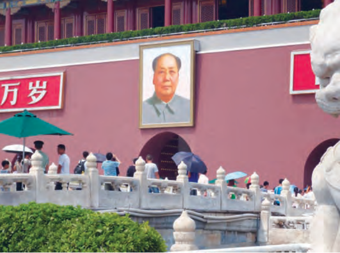
A giant portrait of Chinese communist revolutionary leader, Mao Tse Tung, looks over Beijing's main square.

(North Korea). Furthermore, a strengthened ADF would surely be increasingly used to help Australian business owners and top bureaucrats bully and exploit the peoples of smaller Asia-Pacific neighbours as seen in the past ADF interventions in Bougainville, Solomon Islands, East Timor and Tonga. And from past record and given the instability of the capitalist-dominated world, one can certainly expect the ADF to be mobilised to help the Australian regime's U.S. senior partner to grab control of oil supplies and outmanoeuvre capitalist rivals in the Middle East.