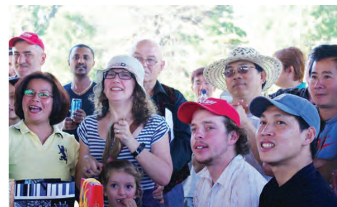
November 2011, Above: Workers at the Baida poultry plant in Laverton, Victoria on the picket line during a two-week long strike for job security and against bullying bosses. Left: Baida workers at a picnic to celebrate their victorious struggle. Even today, when workers are in collective struggle, petty rivalries and jealousies and the racial and sexual divisions and oppressions created by capitalist society are to a degree mitigated. This points to how a future communist society will allow all people to live in very warm and happy friendship with each other in a society without oppression or exploitation – and, hence, no need for a state.