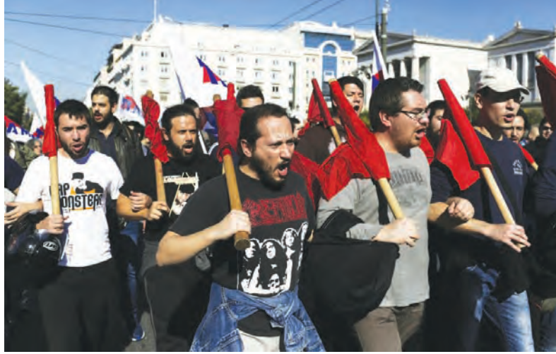
Athens, 12 November 2015: Tens of thousands of Greek workers march during a massive general strike against the austerity policies of the "leftist" Syriza government. The Greek government is implementing cuts to pensions and other social services and large-scale privatisations. Despite calling itself "radical Left", the fact that the Syriza government accepts capitalist state power means that it must necessarily carry out anti-working class policies. Similarly, despite occasional, very soft "Left" rhetoric, the fact that the ALP and Greens accept capitalist rule means that ALP or ALP/Greens governments always serve the big end of town capitalist exploiters. Working class people can only win gains through class struggle against the capitalist ruling class and can only secure a happy future through the eventual overturn of capitalist rule.

The spectacular advances for public housing in socialistic China point to the potential of a society based on public ownership. One of the reasons China is able to make these advances is that its banks are under public ownership and so are its main construction companies building the public housing. Here in capitalist Australia a lot of the budget for public housing ends up in the pockets of greedy private contractors like that super wealthy firm Spotless which has the contract for repairs. 10