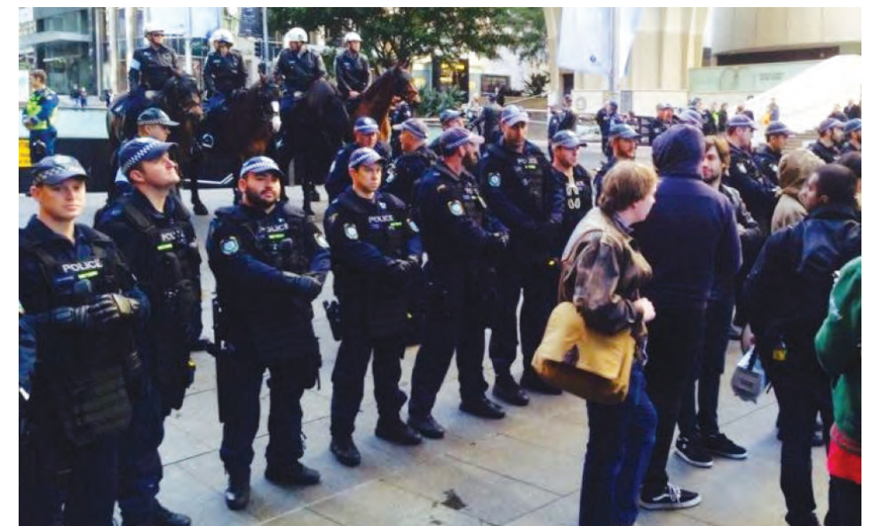
Sydney, 19 July 2015: A large police mobilisation prevents an anti-racist demonstration from being able to effectively counter a rally by the fascist "Reclaim Australia" movement. It was notable how the police and police horses faced in the direction of the anti-fascists – confirming that the police were siding with the far-right racists against the anti-racists.

Given the white racist forces seen on Sunday [i.e. on 11 December 2005], a union/immigrant mobilisation would not take place at Cronulla Beach until the forces for such an action had been adequately built up. But these forces need to be urgently strengthened right now through one, or a series of, preparatory demonstrations in the heartlands of Sydney's multiracial working class – suburbs like Bankstown or Auburn. When our side is sufficiently strong, the decisive union-centred action at Cronulla Beach can be launched possibly via a huge cavalcade from a rallying point in Sydney's West.