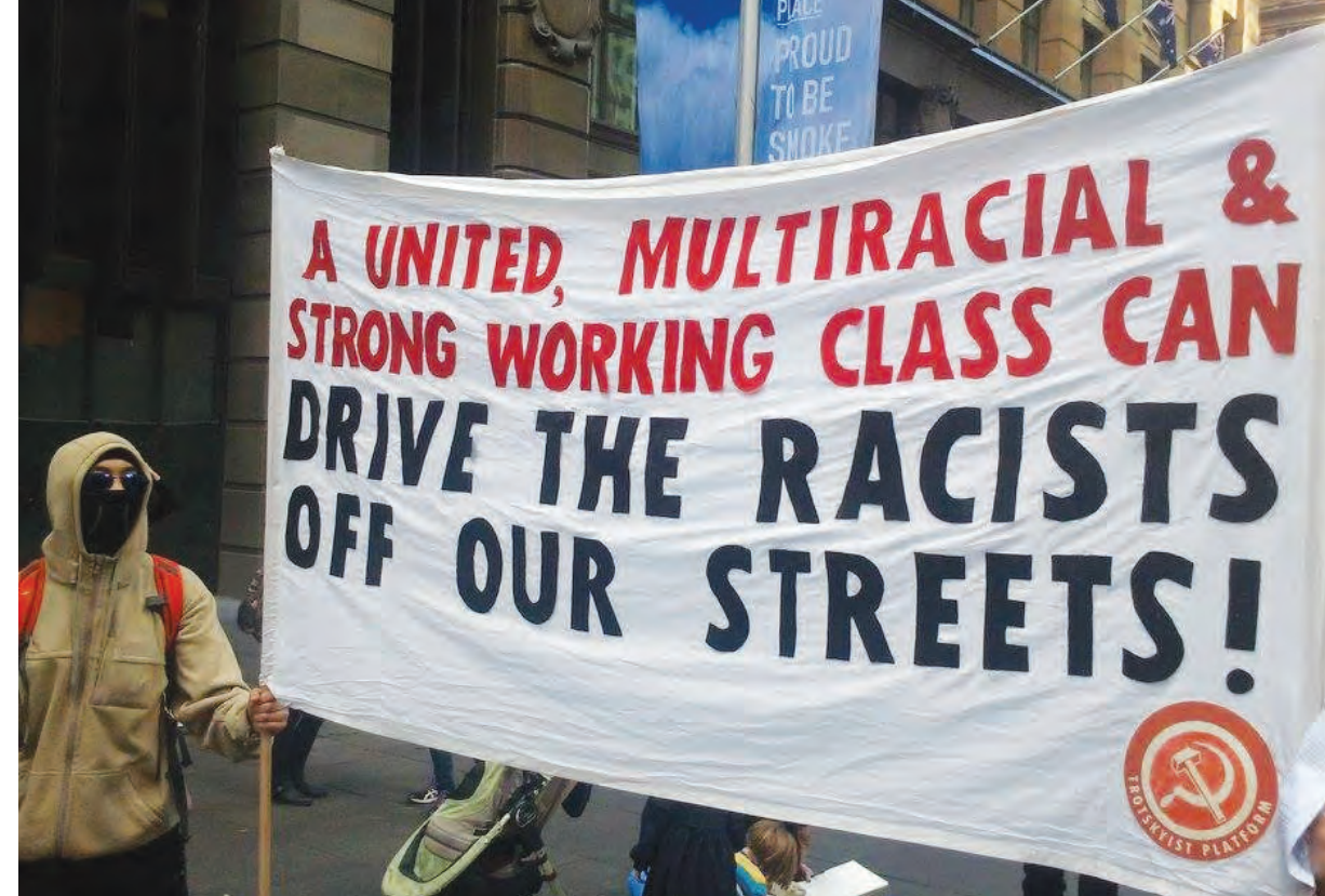
Trotskyist Platform banner, placards and leaflets at the 19 July 2015, anti-racist rally in Sydney promoted the strategy of trade union contingents uniting with coloured people and anti-racists to crush the fascist scum.

Yet by and large, with support from the police, the extreme right-wing forces were able to hold their racist violence-inciting