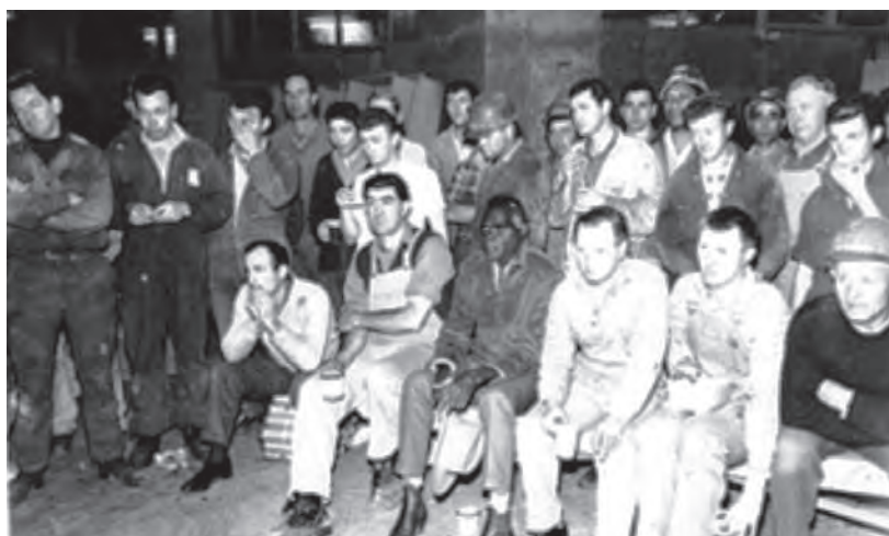
1967: Aboriginal activists from the Gurundji stockmen and domestic hands' strike together with Builders Labourers Federation (BLF) members at a meeting to support the Gurundji struggle for land rights. The leftist-led BLF trade union would later play a key role in the Aboriginal struggle for affordable housing on Redfern's The Block. The workers' movement must stand solidly behind the struggle for justice of Aboriginal people.

that Aboriginal people faced in employment and every aspect of their lives inevitably led to social problems on The Block. These problems were played up by the capitalist-owned media and seized on by the state government to justify their push to drive Aboriginal tenants out of the area. The combined effect of relentless police attacks, the deterioration of the houses, social problems and the AHC's push to move tenants off The Block meant that by late 2010 there were just 35 people living on The Block – down from a peak of over 300. To get the last of the tenants to move, the AHC on the one hand threatened higher rents and eviction orders and, on the other hand, promised residents that they would be able to move back once the re-development took place. Residents, however, were sceptical about being able to move back and expected that the 62 new affordable houses would still be way out of their price range. What really enraged former Block residents and supporters of affordable housing for Aboriginal people was when last year AHC CEO, Mick Mundine, claimed that it was not commercially viable to pursue affordable housing on the Block. "That's on the back burner at the moment," he said. "Our first priority is the commercial build" ( The Sydney Morning Herald , 26 April 2014). It was this confirmation of the fears of many that led Aboriginal activists to establish RATE.