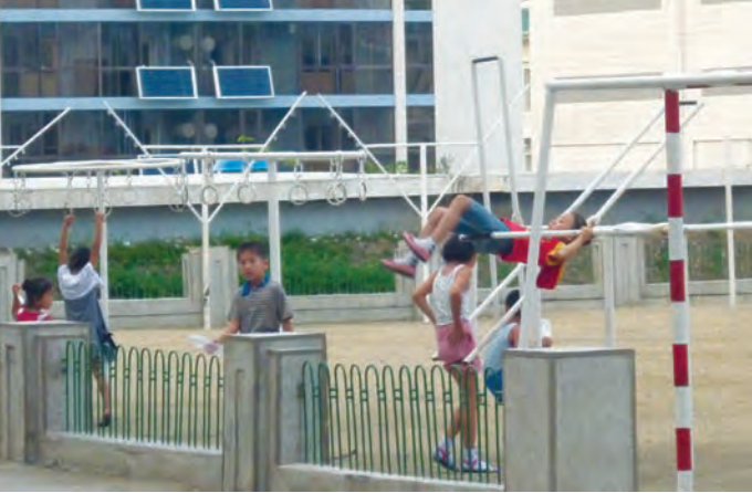
North Korean children having fun at a playground near a housing complex.