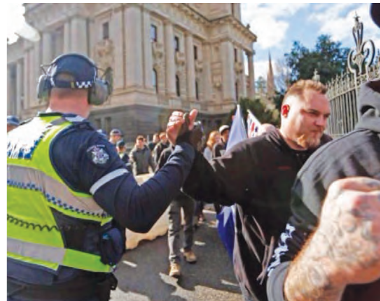
Showing which side they are on! A policeman publicly high-fives a member of the fascist United Patriots Front during their 18 July 2015 race-hate rally in Melbourne. As a core part of the capitalist state, the police in this current system cannot be allies in the anti-fascist struggle but are, instead, a major force impeding the fight against fascism.

Here, the same trend is happening and it is driven by, more or less, the same economic reality. As the fall in the prices of iron ore and other commodities (from the exorbitant levels with which Australian mining bosses had previously been ripping off Asian neighbours with) reduces the profits of the Australian capitalist ruling class, they are seeking to make up for this by more viciously exploiting the masses. To enable them to achieve this, the ruling class is seeking to kill off the chance of working class resistance by poisoning mass sentiments with a large dose of nationalism.