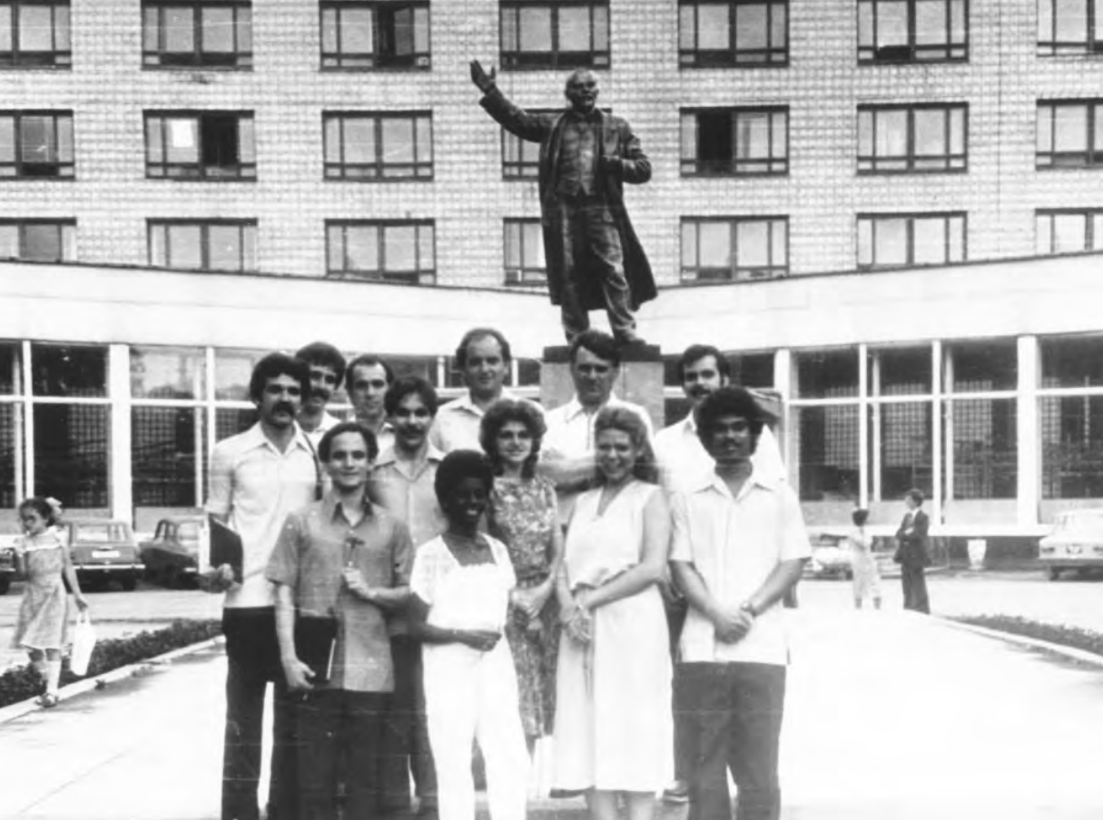
Days of the Socialistic USSR: International and local students at Novosibirsk State Technical University pose for a photo in front of a statue of Russian Revolution leader, Vladimir Lenin.

the various Central Asian nationalities faced brutal suppression of their national rights. However, the 1917 October Socialist Revolution in Russia changed all that. The victorious revolutionary workers created their own state, the Soviet Union (USSR) workers state, that over time led to a massive improvement in the status of the Kazakh, Uzbek, Tadzhik, Turkmen, Kirghiz, Georgian, Armenian, Azeri and other peoples of Central Asia and the Caucasus. From the time the communist-led workers took state power, they mobilized to smash the fascist and other anti-Semitic gangs. 6