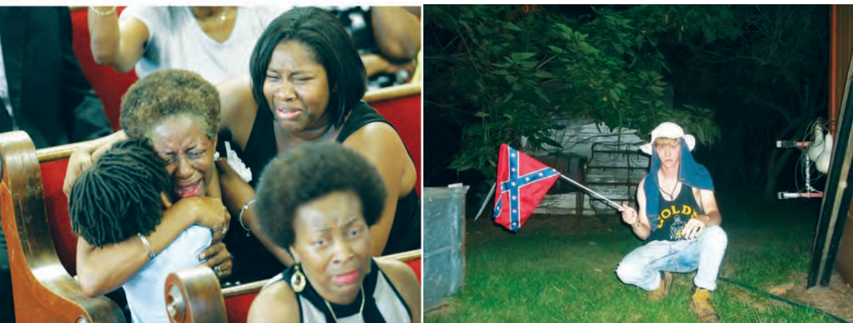
Charleston, South Carolina, United States: Friends and relatives of victims at a ceremony to mourn the murder of nine attendees at the Emanuel African Methodist Episcopal Church. White supremacist activist, Dylann Roof (Right) entered the church – known as a church where black people congregated – and indiscriminately opened fire on church goers. Every Reclaim Australia and UPF rally brings Australia closer to a Charleston-style far-right terrorist massacre.

the Adelaide April 4 “Reclaim” action, some of the invigorated fascists followed a group of indigenous activists participating in the counter-protest back to their home and assaulted them. Meanwhile, the emboldening of the “Reclaim” participants – and the bigots “watching at home” – just by the fact that they were able to get away with openly spewing extreme racist filth in the heart of Adelaide can only lead to more racist violence on the streets.