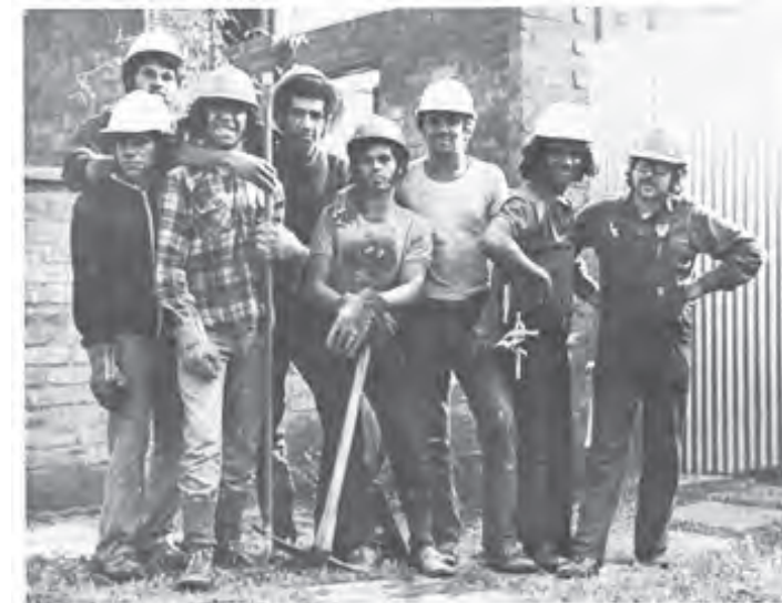
1970s: Aboriginal and non-Aboriginal BLF union members working on the construction of affordable housing for Aboriginal people on The Block.