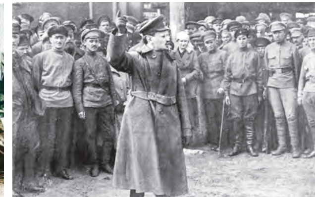
From the time that they overturned capitalist rule in the 1917 Russian Revolution, the Soviet working class had to mobilise the forces of armed power to defend their liberation. Right: Founder of the Soviet Red Army, Leon Trotsky, motivates troops in 1918 during the bloody Civil War against insurgent armies attempting to restore capitalist power. Left: Red Army women snipers during the Soviet Union's struggle to defeat capitalist Nazi Germany's invasion during World War II. It is completely unrealistic that a victorious workers' revolution will be able to immediately build a socialist society without constructing a workers' state to defend the toiling masses' conquests against the deposed capitalists seeking to restore their rule and against international capitalist powers determined to destroy any example of a socialist society.