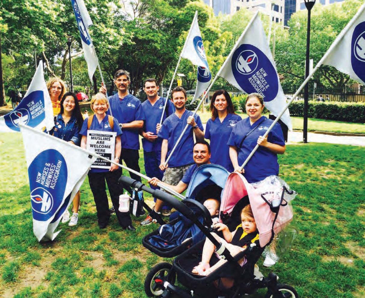
Sydney, 11 October 2015: Proud members of the Nurses and Midwives Association pose for a photo in Hyde Park on the day of the rally in Sydney protesting against the racist Turnbull government's attacks on refugees.

so badly needs to fight for its own rights. Making such an appeal is essential in order to enhance the possibility of winning class-conscious workers to joining the anti-racist struggle.