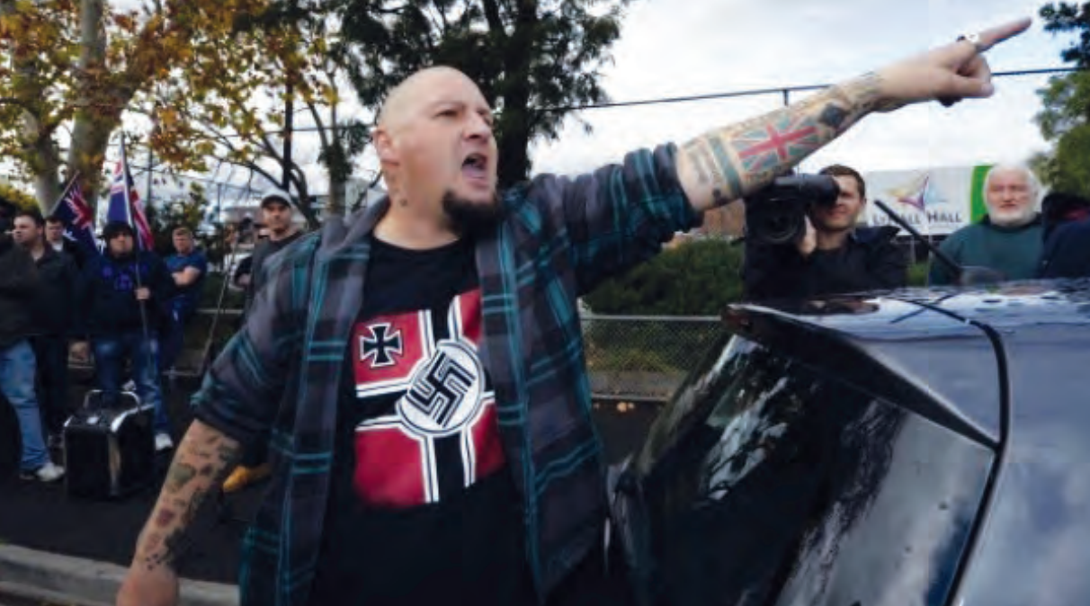
Melbourne, May 2015: An activist with the fascist United Patriots Fund (UPF) proudly brandishes Nazi symbols at their rally against communism and Islam. The UPF and Reclaim Australia are avowedly anti-Islam and anti-communist. In truth they are not only bigots opposed to Muslims but are extreme white supremacists intent on stirring up racist violence against all coloured people – they are against Aboriginal people and against people from Asian, African, Middle Eastern and Pacific Islander backgrounds.

The capitalist bosses and their politician mates know this well. That's why they have been deliberately whipping up racism to divide the ranks of the working class and divert their fire . They have been demonising refugees and Muslims and ever more viciously vilifying and locking up Aboriginal people. Serving the exploiting class in this agenda are several extreme right-wing groups. These outfits, including open neo-Nazis, don't simply want to spread prejudice. They actually want to incite and unleash violent racist attacks.