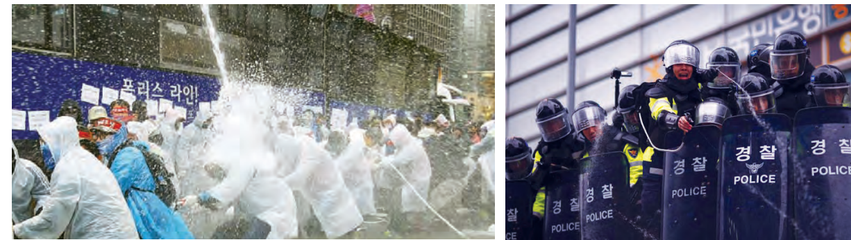
14 November 2015, Seoul: Capitalist South Korea’s brutal police unleash water cannon, pepper spray and tear gas to disperse a 70,000 strong anti-government demonstration of workers and civil rights activists.

For the brutal, anti-working class South Korean regime to be talking about “human rights” is truly the height of hypocrisy. Yet its attacks on the socialistic North are totally expected. Whilst the DPRK was founded by Korean leftists who heroically fought the Japanese imperialist occupiers