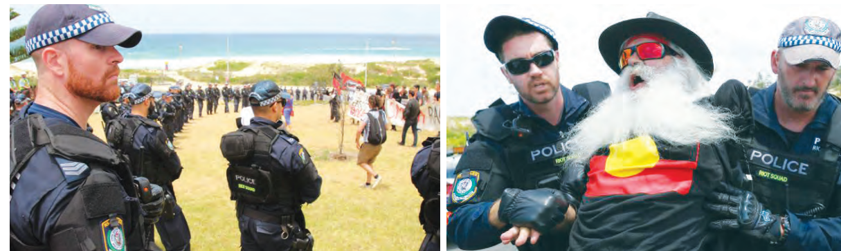
On the day of the December 2005 Cronulla riot the police forces present were strikingly minimal even though the police's own intelligence made clear to them that a large, explosive rate hate mobilisation would occur. Yet when anti-racists mobilised ten years later, the police were unleashed in massive numbers to corral the anti-racist demonstrators (Left) and to protect the violent racists who had gathered to celebrate the December 2005 riot. The police even in a very cowardly manner arrested a one-armed Aboriginal man in his late 50s (Right) – one of two anti-racists that they arrested on the day.

The behaviour of the police, courts and government during and after the Cronulla riot was no aberration. Police and prison guards throughout Australia have killed large numbers of Aboriginal people in and