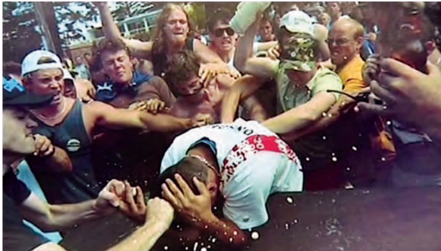
Sydney, December 2005: Racist white mobs bash any coloured person they can find on Cronulla Beach. Since then coloured people have been fearful to go to Cronulla Beach, which had been (due to its location near a train station) up until the riots Sydney's most multi-racial beach. That this defacto state of apartheid on Cronulla Beach remains in place and the effects of the riots have not been overturned is a source of inspiration for violent racists throughout Australia. There needs to be a huge anti-racist convoy of trade unionists, 'ethnic' youth and anti-racists that will travel from the multiracial, working class southwest of Sydney to Cronulla to finally ensure that Cronulla Beach can be safely accessed by coloured peoples.

mainstream media and police assistance. Yet, every day working class Aboriginal, Middle Eastern, Asian and African people are getting attacked or abused on the streets, in public transport, in the school playgrounds and at nightspots with little or no official redress... and that's when racist cops are not the actual perpetrators themselves!