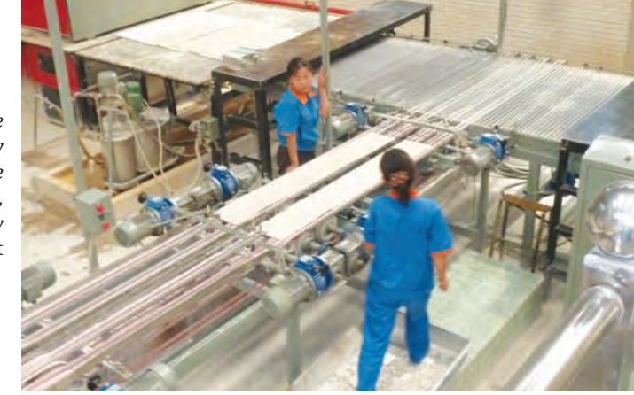
Workers at North Korea's Taedongang Tile Plant. North Korea has a relaxed and friendly work environment where at least two people are stationed at assembly line node points that would, in places like Australia or Indonesia, have only one worker doing all the work.