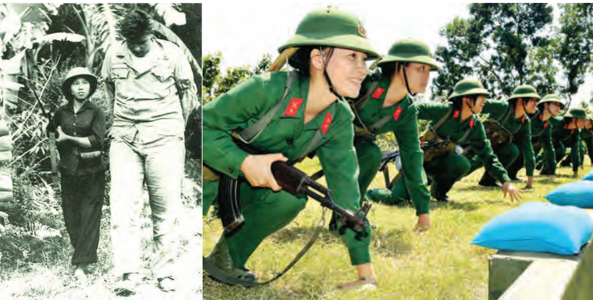
Left, 1966: A Vietnamese communist woman fighter marches a captured American airman through the jungle during the Vietnam war. Right, 2014: Women soldiers in the army of the Vietnamese workers state in training. The founding personnel, traditions and culture of the Vietnamese workers state's organs were, like those of the other workers states in China, Cuba, North Korea and Laos, formed during the heroic liberation struggle against capitalism and imperialism. An important part of these new traditions and culture included placing women's role in society at a much higher level than where it had been during pre-revolutionary times.