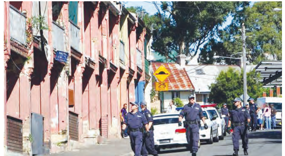
Police stampeding around Redfern's The Block. The Aboriginal community on The Block faced decades of violent police raids and racist bullying.

Aboriginal people have been living on The Block in low-rent housing since the early 1970s. This affordable housing had been won through a struggle by Aboriginal militants and the militant Builders Labourers Federation trade union. That struggle which triumphed in early 1973 forced the then Whitlam Labor federal government to provide a grant for Aboriginal people to collectively buy up the area. The Aboriginal housing in the area came to be managed by the Aboriginal Housing Company (AHC) which was established by the activists who fought for The Block for the sole purpose of providing comfortable and happy low-rent accommodation for Aboriginal people. Despite facing much racist discrimination – including from banks reluctant to do dealings with an Aboriginal organisation – the AHC's work in its early days ensured that low-rent accommodation came to be provided for up to 300 Aboriginal people on The Block.