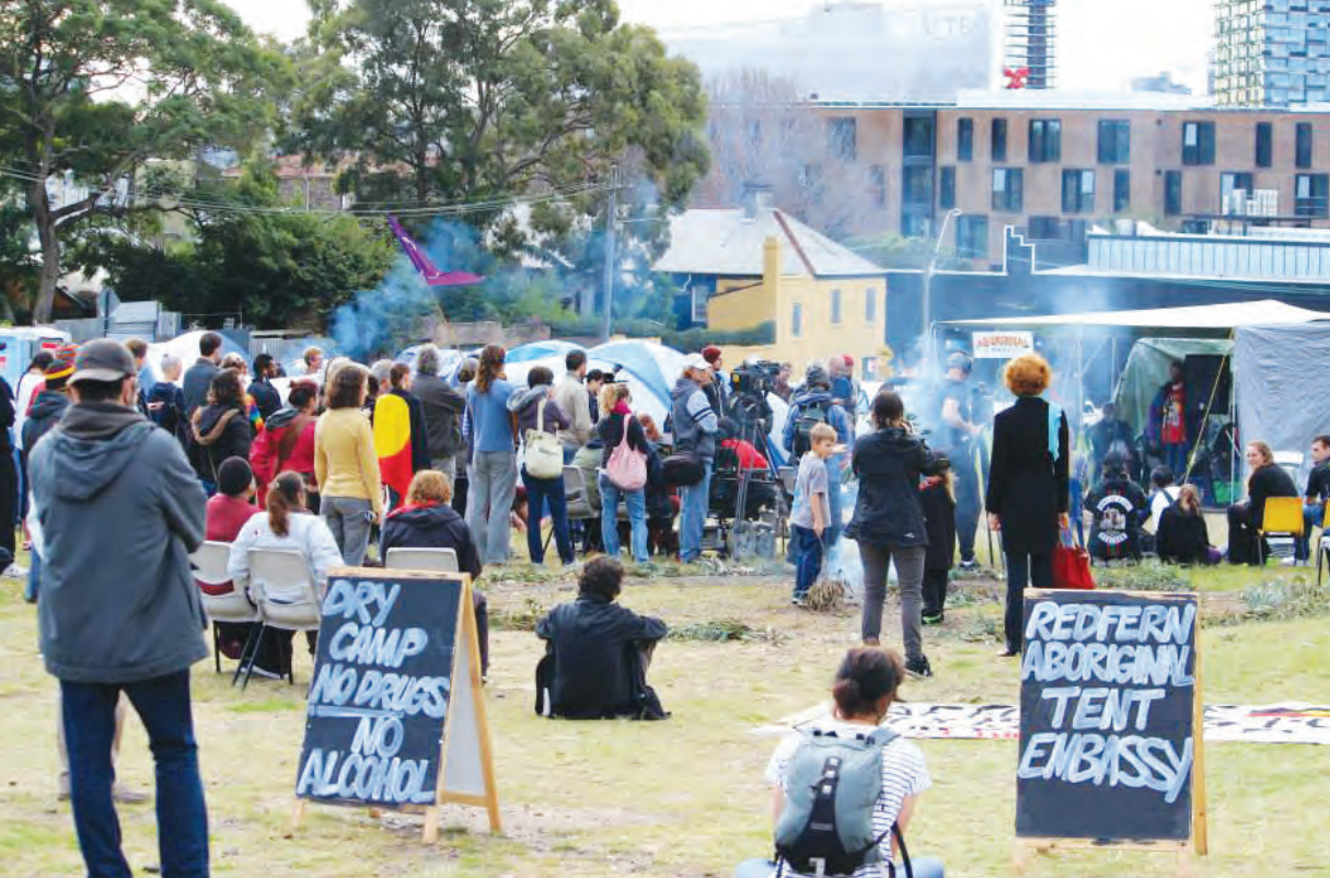
15 June 2014: Hundreds gather to defend the Redfern Aboriginal Tent Embassy (RATE). RATE attracted broad support from supporters of Aboriginal rights and campaigners for affordable housing.

and the strong drive that was key to success. The Aboriginal activists spearheading the movement deeply understood not only how the lack of affordable housing has forced many Aboriginal people into homelessness but also the importance of saving the Aboriginal character of The Block given its special significance as a historic centre for militant black resistance against racial oppression. Many non-Aboriginal people also supported the RATE struggle. This included people from various non-white “ethnic” communities – who especially identify with the Aboriginal rights struggle because of their own experiences in racist white Australia – as well as committed anti-racist white activists. Special mention here must be made to activists with links to the anarchist Black Rose collective who did a lot of heavy lifting in terms of staffing and protecting the embassy at night. Trotskyist Platform activists also did regular night and graveyard shifts to guard the embassy. Also participating in the struggle were activists from Socialist Alliance and individuals from a wide range of different anti-racist political standpoints. When RATE held rallies – both