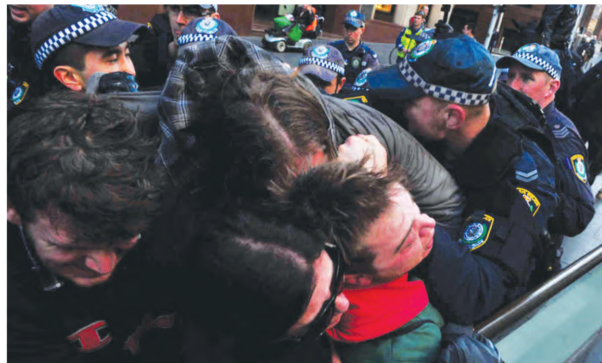
Sydney, 19 July 2015: Police brutalise anti-racism activists counter-demonstrating against a rally by the extreme racist “Reclaim Australia” movement. Since police serve the same capitalist ruling class whom the fascists and their race-hate ideology truly serve, they are heavily biased towards supporting the fascists in any standoff with anti-fascists.