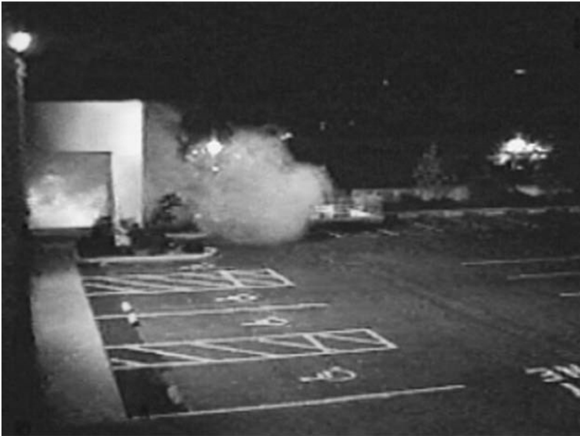
Security camera image of the bombing at Chiron by the Animal Liberation Brigade.