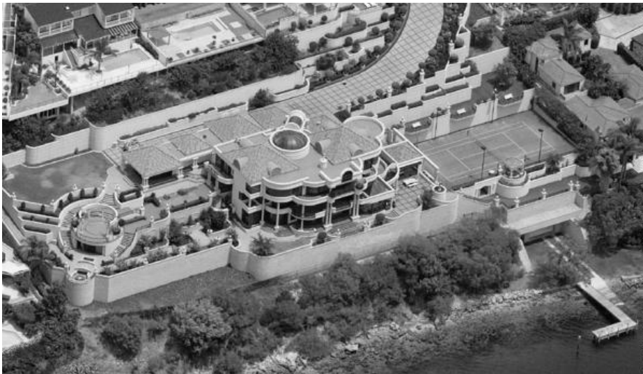
Perth mansion until recently owned by mining heiress Angela Bennett. Last year she sold the home to fellow mining magnate Chris Ellison for $57.5 million. Bennett became a billionaire through receiving royalties from Rio Tinto's Pilbara iron ore operations.