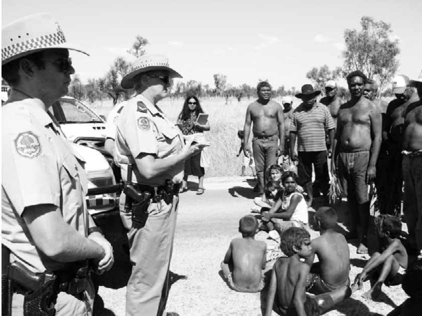
June 2008: Police block Aboriginal people in the Northern Territory's MacArthur River Region from holding a ceremony at a sacred ceremonial site that was on the verge of being destroyed by the expansion of a zinc mine owned by mining giant Xstrata.