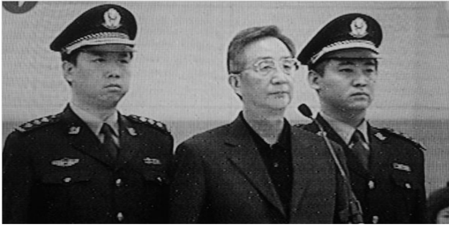
Position no immunity: Former Shanghai chief and Communist Party of China Politburo Standing Committee member, Chen Liangyu at his April 2008 sentencing hearing. Chen was jailed for 18 years for allowing state assets to be illegally acquired by private bosses in exchange for bribes.