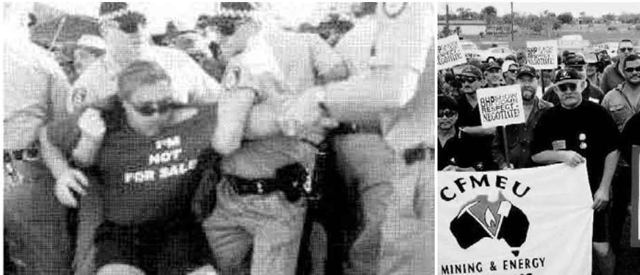
Showing whose side their on: Australian Police attack BHP workers during the January 2000 strike at the Mt Newman mine in the Pilbara