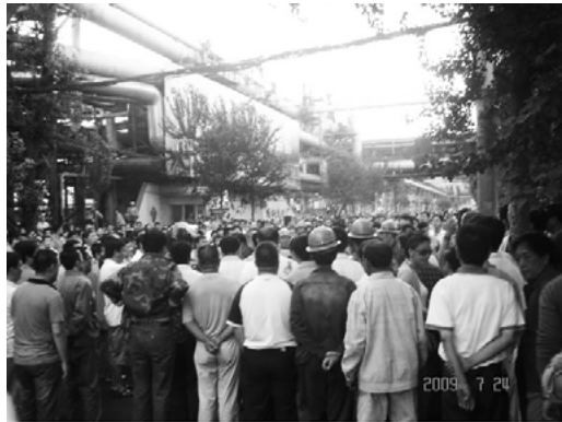
Jilin Province, China, 24 July 2009: Militant street and factory occupation by thousands of steel workers. Workers action smashed attempt to privatise the state-owned Tonghua Iron and Steel Group.