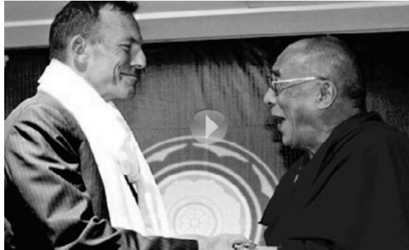
3 December 2009: A love in of two people who share a lot in common and both hate communism. Ultra-conservative leader of the Liberal Party, Tony Abbott meets deposed feudal monarch of Tibet the Dalai Lama.

workers state with the same class prejudice with which they oppose trade unions here. But, on the other hand, they need socialistic China's economy to hold up their faltering capitalist system. So what do they do? Well, they are not quite sure. Thus the Australian ruling class has been schizophrenically flipping from naked hostility to the PRC to apparently sincere friendship to sometimes both extremes at once. Different factions in the Australian ruling elite advocate different strategies. Some, more interested in a quick killing, say just take China's money and be happy. Highly ideological elements within the capitalist ruling class, however, emphasise the need to undermine China's socialistic order. Within this latter group itself there are differences. On the one hand there are those that insist that the best way to topple Chinese socialism is to increase anti-PRC military pressure and to fervently support counterrevolutionary forces like Falun Gong, the pro-Dalai Lama lot and Rebiya Kadeer's group. On the other hand are those that believe in "engaging" China in order to promote its private sector and to nurture pro-capitalist tendencies within its bureaucracy.