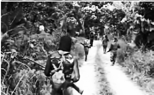
Taking a stand against Rio Tinto (whose Australian wing was then called CRA): Bougainville Revolutionary Army (BRA) freedom fighters in action. BRA rose up against CRA's failure to share revenue and provide proper compensation for its massive copper mine in the PNG island of Bougainville. Bougainville resistance forces shut down the mine in 1988.

Yet despite the firepower arrayed against them, the Bougainville resistance which had coalesced into the Bougainville Revolutionary Army (BRA) managed to force the mine to shut down indefinitely in May 1989. Australia/PNG responded by escalating the war. They used terrifyingly brutal methods. Herding the people of Bougainville into "care centres" (a Vietnam War-euphemism for concentration camps), many suspected of having sympathies for the rebels were killed or beaten. Still unable to defeat the BRA and reopen the mine for CRA (Rio Tinto), Canberra told the PNG puppet government to impose a naval blockade on the entire island and provided the Port Moresby regime with the aircraft, helicopters and Pacific Class speedboats needed to enforce the blockade. As a result, the island's people started dying from starvation and more commonly from