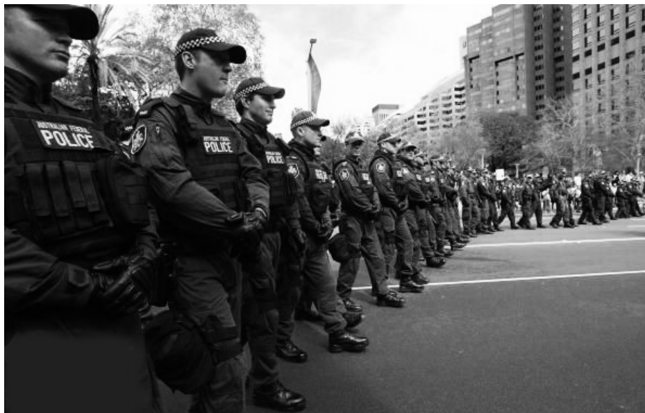
Australian capitalist “democracy” at work: Massive police mobilisation intimidated anti-war demonstrators protesting at the September 2007 APEC Summit in Sydney.

Despite Rio Tinto’s best efforts to wash their hands of this scandal they have been considerably tainted by it. The PRC’s exposure of the corruption of four of Rio’s top China-based executives and the Shanghai court verdict’s implication of the Australian