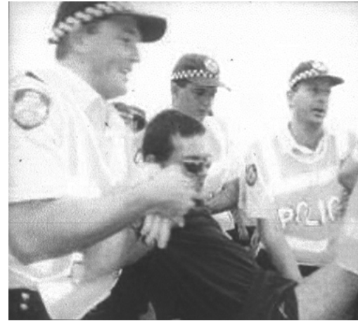
“Serving and protecting” ... Rio Tinto’s interests! Queensland Police arrest hundreds of trade unionists outside Rio Tinto’s Gordonstone (now called Kestrel) coal mine in February 1999. Pickets tried to stop non-union scabs secretly hired by Rio from entering mine after the entire union workforce had been retrenched when the mine was supposedly “closed.”

All of the above highlights two things. Firstly, it shows that Rio Tinto executives will do absolutely anything they can get away with to maximise profits for themselves and Rio’s mega-rich owners. And it is, by the way, the filthy rich who own most of Rio Tinto – the mythical middle-class “mums-and-dads” shareholders own just a tiny minority of the company. If one looks at Rio Tinto’s 2008 Annual Report, one finds that 97.8% of the shareholders – which include the upper-middle class “mums and dads” - own only 7.5% of the group. By contrast, just 258 accounts on the Australian Stock Exchange and 338 in London own a whopping three-quarters of the company’s $42 billion stock – an average of $70 million of shares each. Just who these tycoons are is somewhat opaque since among Rio’s biggest shareholders are bank nominee companies through which ultra-rich individuals and the businesses that they control can conceal their ownership. It has