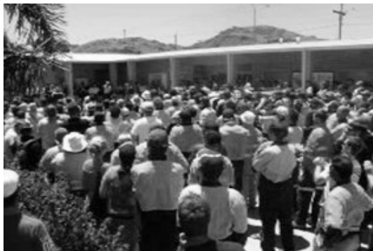
Construction workers involved in Woodside's Pluto gas project strike over the failure of their bosses to grant them permanent accommodation. The strikes at the remote WA site involved 1,500 workers. Workers united have the industrial muscle to push back the corporate owners.