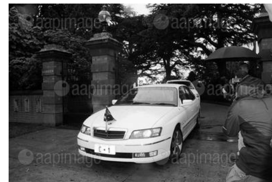
April 24, 2009: Prime Minister Kevin Rudd leaves after visiting the mansion of ill tycoon Richard Pratt, then Australia's richest man. Despite the billionaire being a swindler, whom was found to have taken $700 million from the public through illegally conspiring with rivals to keep packaging prices high, Pratt was doted on by mainstream politicians to his dying day.

Take the case of the recently departed Richard Pratt who was one of Australia's richest men. Pratt made a fortune from his Visy packaging business through shady dealings and a heavy-handed approach against the trade unions that sought to protect Visy workers' rights. On November 2007, the Federal Court found that Pratt and his senior executives had knowingly formed a cartel with "rival" Amcor to fix prices. They had cheated customers - which in the end are ordinary people buying toothpaste, soap,