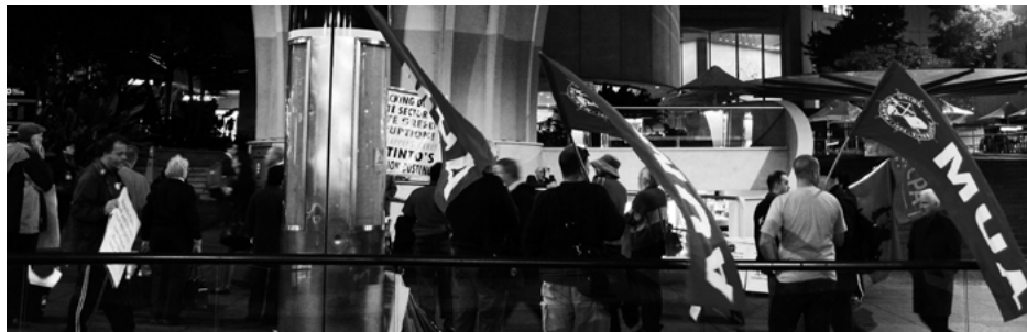
Demonstrators gathered for the 20 May 2010 rally outside Rio Tinto's Sydney office that was built around the call: "China is Cracking Down on Private Sector Corporate Greed and Corruption – It's Time that Happens Here! Stop Rio Tinto's Plundering and Union Busting!". Among those participating were a contingent of representatives of the Sydney Branch of the MUA (Maritime Union of Australia) – carrying the union's trademark red flag.