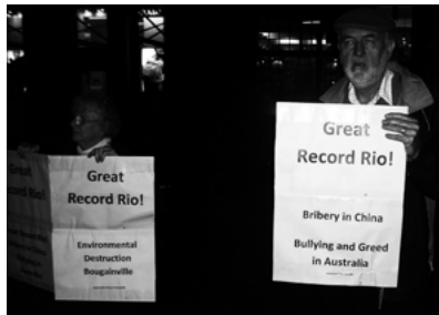
Demonstrators taking a stand at the May 20 rally in Sydney.

this is not the only or indeed even the main factor involved. What mainly drives the militant defenders of the arrested executives is, on the one hand, the class loyalty of capitalist politicians to capitalist executives and, on the other hand, the hatred that capitalist representatives have for socialistic states. If indeed it was only racism that was motivating the hardline backers of the arrested executives then why have ethnic-Chinese anti-communists also demanded a tougher line from Rudd against the PRC? For example, the Epoch Times , the paper of the Falun Gong group – a right-wing Chinese outfit posing as a religious organisation – published an article on 12 August 2009 headlined “Australia Needs to Stand Up for Stern Hu.” Meanwhile, in attacking China’s arrest of the Rio Tinto bosses, Barnaby Joyce, Michael Danby, Malcolm Turnbull and the Murdoch press highlighted not the racial or cultural characteristics of the Chinese people but the reality that in the “communist Peoples Republic of China” the key industries are dominated by state-owned enterprises; and that these enterprises operate not according to the profit motive but are subordinate to the state that is run by communists. However, you won’t find any references to such statements by these people in the Socialist Alternative’s journal. For if