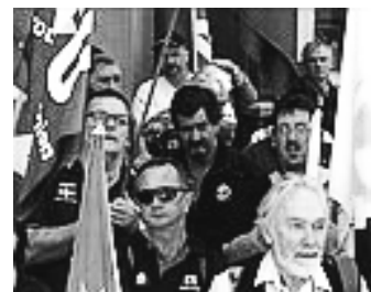
16 February 2010: Trade unionists rally outside Rio Tinto's Melbourne headquarters to protest the company locking out 560 union miners in the Western Californian town of Boron.

The statement went on to note that Rio Tinto was notorious for "abuses of human rights, indigenous land rights, workers' rights and damage to the environment and local communities in Australia, Africa, Bougainville, Indonesia and Iceland." And that is putting it mildly! Let us here briefly examine some of the history of Rio Tinto. Let us look at the ruthlessness of the Australian and British capitalists who run this company.