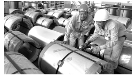
Workers at a facility of the state-owned Baosteel Group – China's biggest iron and steel enterprise. In China the equivalents of BHP, Rio Tinto, Woodside, Xstrata, Bluescope Steel, One Steel etc are all state-owned.