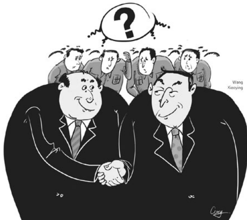
No sympathy for rich exploiters: Cartoon in a Chinese state-owned newspaper article ( China Daily , 6 August 2009) about the Tonghua struggle mocks greedy executives keeping workers in the dark. The Tonghua Iron and Steel Group had been privatised but the privatisation was quashed after thousands of workers occupied the plant and fatally bashed the would-be private boss who had been planning mass layoffs. Can you imagine how the Australian mainstream media would react if the same thing happened here?

Revolution. As a result, once Chinese tycoons appear on either the Forbes or Hurun (a rival rich list to Forbes ) rich lists, there is intense public pressure for the government to crack down on them. Beijing often obliges, particularly since the greedy billionaires often turn out to have first got a leg up through an “original sin” act of corruption. Not long after the 2008 Hurun rich list appeared the person who topped the list, Gome Electrical Appliances owner Huang Guangyu, was detained for economic crimes. Hundreds, possibly up to a thousand government officials involved in protecting Huang have also been rounded up. Last June the mayor of Shenzhen, the huge city near Hong Kong, was detained over the affair. And two top police officials including a former deputy minister of public security and a former Shanghai deputy police chief have also been detained on suspicion of bribery in connection with the case. Huang, himself, has remained in custody since his arrest.