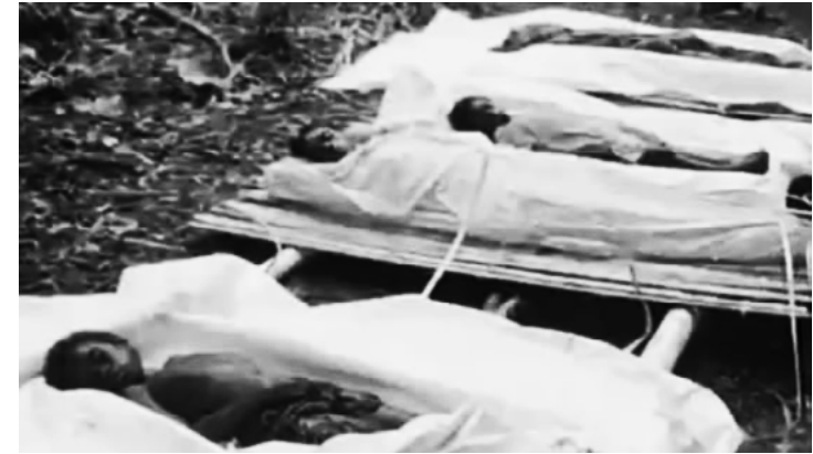
Bougainville people killed in years long Civil War from 1988. Australia's PNG puppet forces, Australian military "advisers" and mercenaries and PNG/Australia's starvation naval blockade killed 15,000 Bougainvilleans in the service of Rio Tinto.

a lack of medicines. Alongside the hundreds upon hundreds killed by gunfire, 14,000-15,000 Bougainville people ended up dying as a result of the genocidal eight-year blockade. In all the PNG state authorities and their Australian imperialist masters killed off some 10% of the island's entire population. All this to try and help CRA/Rio Tinto to resume their plunder in Panguna.