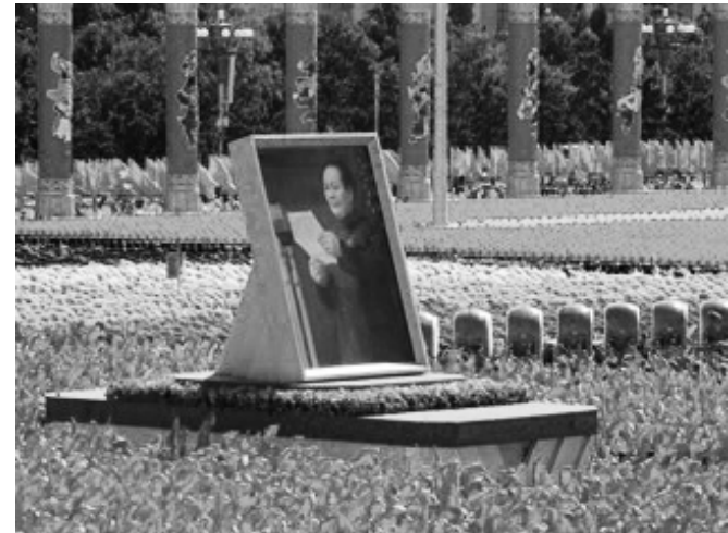
Beijing, 1 October 2009: A giant portrait of Mao Tse Tung heads the official parade to mark the 60th anniversary of the founding of the Communist Party-led Peoples Republic of China.

What the furore over both the Chinese investment proposals and over the jailing of the Rio Tinto executives has highlighted is the fundamental difference between the political system in the PRC and that in capitalist countries. The PRC has been shown