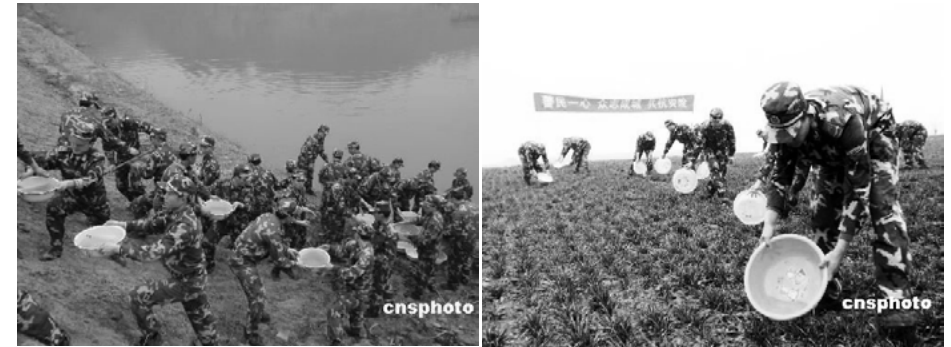
Serving the people. Feb 7, 2009: Several thousand of the Peoples Republic of China's police mobilise in Henan Province to help poor farmers combat the drought.

You can bet that any bribes/promises offered to Chinese steel bosses to get the