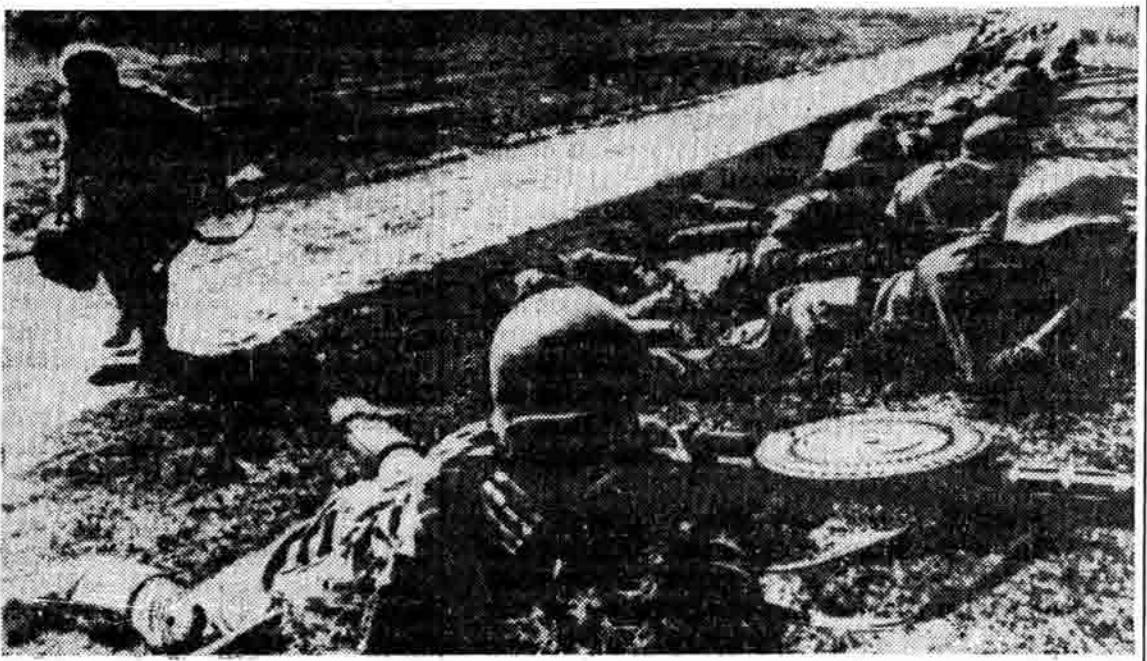
Red Army troops, somewhere on the eastern front, lie flat on the ground as they pour a deadly fire into the ranks of the Nazi army. The fighting qualities of these Soviet soldiers have caused the Nazis to complain of their "unfair methods of warfare."