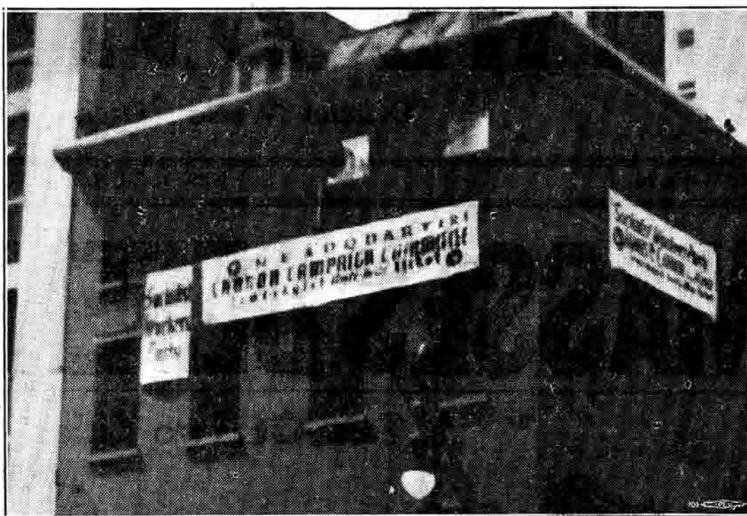
Headquarters of the Cannon-for-Mayor campaign committee, at 116 University Place, New York City, display these large banners calling on the New York workers to support James P. Cannon, National Secretary of the Socialist Workers Party, the Trotskyist Anti-War party mayoralty candidate.