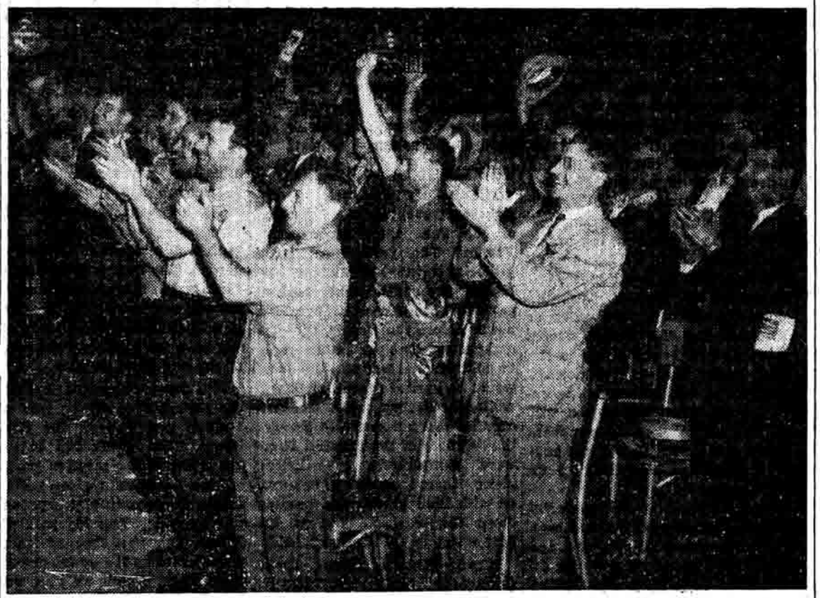
These are some of the 4,000 workers who attended a recent meeting of the Transport Workers Union (CIO) and vigorously applauded the union's demands for increased wages for the subway workers of New York City. Wage increases have been announced by LaGuardia's Board of Transportation, but both LaGuardia and his Board refuse to grant the increases on a retro-active basis.