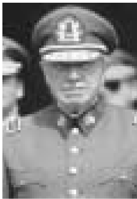
Former dictator Gen. Augusto Pinochet.

Chilean courts found that the amnesty did not apply to the cases of over a thousand "disappeared"—victims whose bodies were never found—on the grounds that these were ongoing crimes not yet resolved.