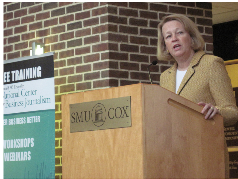
Former SEC Chairman Mary Schapiro.

However, it is not always clear how the SEC handles specific situations in which potential conflicts of interest arise. POGO filed a FOIA request for records showing how the SEC has implemented an ethics agreement signed by Commissioner Gallagher, but the agency provided only 10 pages in part, and withheld approximately 1,500 pages in their entirety. The sheer volume of the material suggests that sorting out Gallagher's potential ethical conflicts takes an extensive effort.