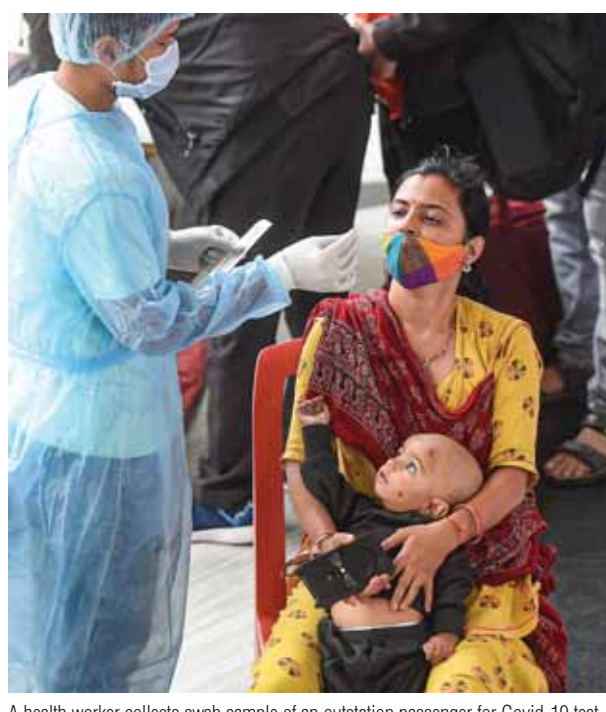
A health worker collects swab sample of an outstation passenger for Covid-19 test at Bandra Terminus railway station in Mumbai on Thursday.