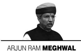
ARJUN RAM MEGHWAL

December 15, marks the death anniversary of the nation's great unifier, Sardar Vallabhbhai Patel. The right tribute will be to adopt his ideas, actions and nationalistic spirit. The people of India will forever remain indebted to him for his leadership during the freedom struggle and his vision, wisdom, and statesmanship in the post-Independence era.