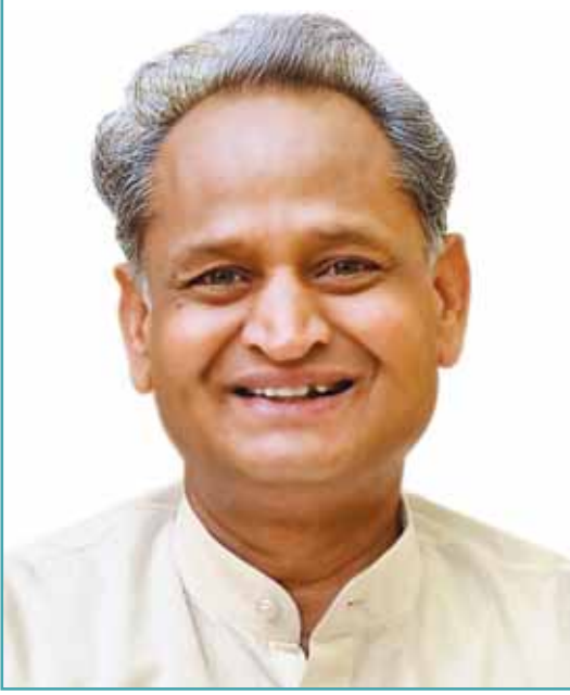
Ashok Gehlot Chief Minister, Rajasthan

“Extending heartiest greetings on the completion of three years of the state’s sensitive, transparent and accountable government. I wish for the happiness, prosperity, healthy life and all round development for the people of the state. Come, let us together take steps for the all-round development of Rajasthan with full devotion and commitment, and play our role with mind, promise and duty by being a partner.”