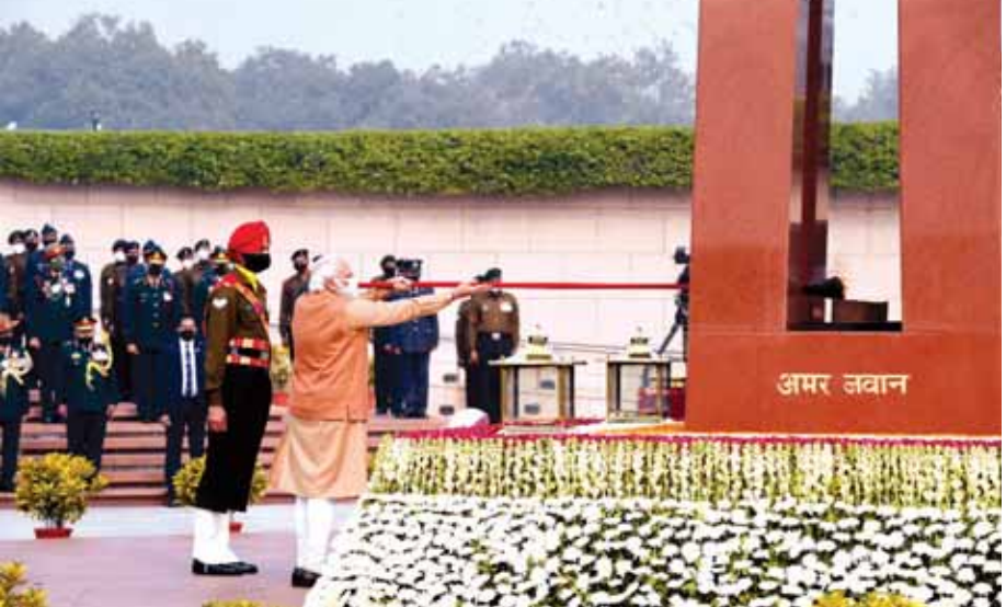
Prime Minister Narendra Modi during the homage and reception ceremony of Swarnim Vijay Mashaals on the occasion of ‘Vijay Diwas’ at National War Memorial in New Delhi on Thursday.

Modi led the nation on Thursday in paying tributes to the Armed forces by laying a wreath at the National War Memorial. “On the 50th Vijay Diwas, I recall the great valour and sacrifice by the Muktiyoddhas, Biranganas and bravehearts of the Indian Armed forces. Together, we fought and defeated oppressive forces. Rashtrapati’s presence in Dhaka is of special significance to every Indian,” PM Modi wrote on Twitter. However the occasion was marred by a controversy with Congress leader Rahul Gandhi and Priyanka Gandhi criticising the Government for ignor-