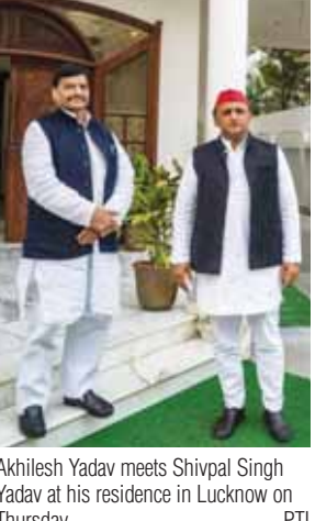
Akhilesh Yadav meets Shivpal Singh Yadav at his residence in Lucknow on Thursday.