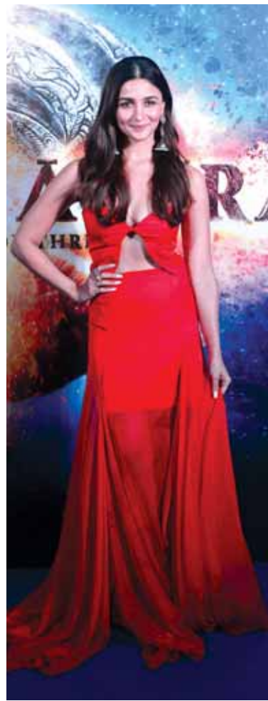
Bollywood actors Ranbir Kapoor, Alia Bhatt and director Ayan Mukherji during their forthcoming film Brahmastra's promotion at Thyagraj Stadium in New Delhi

One of the greatest and most loved contemporary actors, Khan and Saeed have been known for their superlative work in the popular television series Zindagi Gulzar Hai .