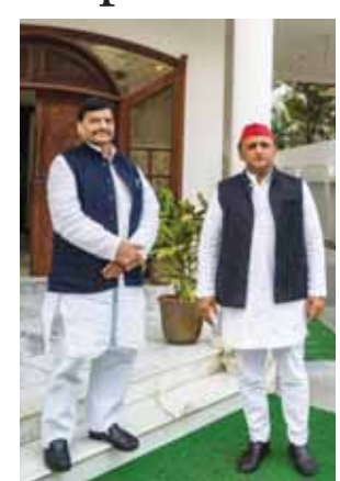
Akhilesh Yadav meets Shivpal Singh Yadav at his residence in Lucknow on Thursday.

Following the meeting, Akhilesh tweeted and confirmed the alliance between the SP and the PSPL. “Met the PSPL chief and confirmed our alliance. The strategy of alliance with smaller parties is strengthening the SP and is taking the SP along with alliance parties towards a historic win,” said