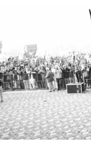
LAMBHI

Taking on Punjab Chief Minister Charanjit Singh Channi from left, right, and centre, Aam Aadmi Party's national convener Arvind Kejriwal on Thursday took a dig at the Congress leader for being "the first Chief Minister in world history who meets people even in the bathroom." Delhi Chief Minister, addressing a public meeting in the Badal's bastion ahead of the Punjab Assembly elections, said: "Current Punjab Government is the most 'nautankibaaaz' and 'dramebaaz' government in the world. A few days ago, I was listening to Channi ji's interview on TV. In the interview, he said that he keeps meeting the public 24 hours a day. Channi said that people sit in my drawing room, verandah, go to the bathroom there...people come with me (Channi) and keep meeting people there also." "In my opinion, he is the first Chief Minister in world history who also meets people in the bathroom," he said.