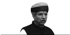
ARJUN RAM MEGHWAL

Starting his public life from being a municipal councillor in Ahmedabad to becoming India's Home Minister and Deputy Prime Minister, Patel had a very granular understanding of the various stakeholders of governance, administration, their relevance, roles and responsibilities. His steadfast approach to handling the nation's complexities made