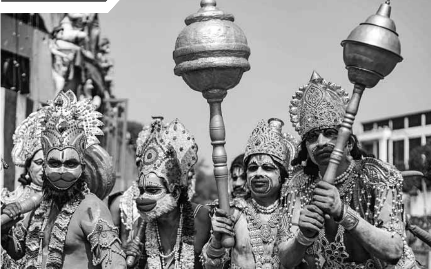
Artistes dressed as Lord Hanuman take part in a procession to mark Hanuman Jayanti, in Bengaluru