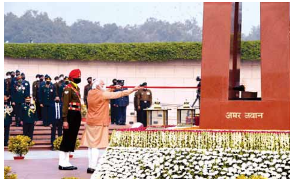
Prime Minister Narendra Modi during the homage and reception ceremony of Swarnim Vijay Mashaals on the occasion of ‘Vijay Diwas’ at National War Memorial in New Delhi on Thursday.

However the occasion was marred by a controversy with Congress leader Rahul Gandhi and Priyanka Gandhi criticising the Government for ignor-