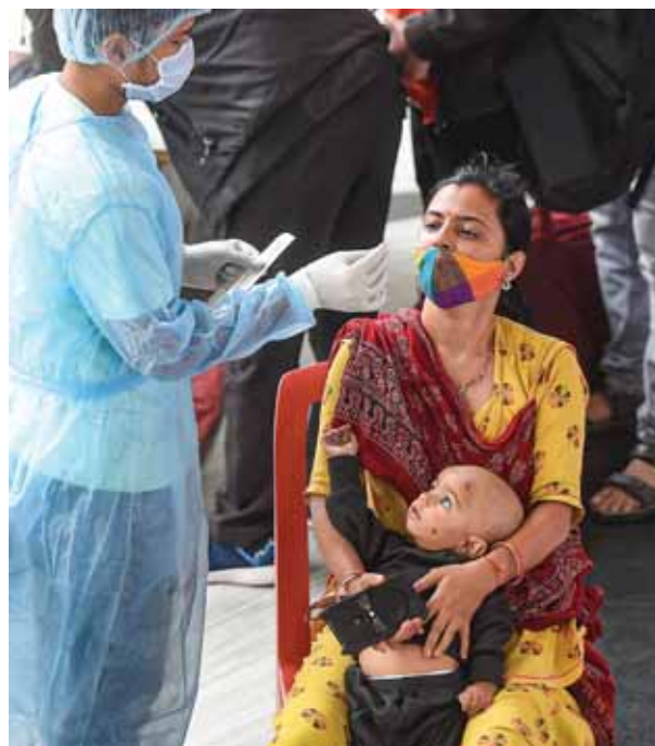
A health worker collects swab sample of an outstation passenger for Covid-19 test at Bandra Terminus railway station in Mumbai on Thursday.

Michael Chan Chi-wai, who led the work, said the result needed to be interpreted with caution because the severe disease is determined not only