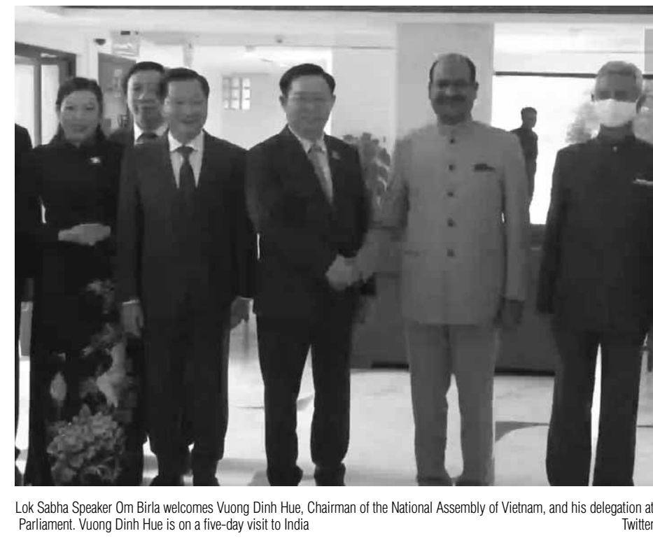
Lok Sabha Speaker Om Birla welcomes Vuong Dinh Hue, Chairman of the National Assembly of Vietnam, and his delegation at Parliament. Vuong Dinh Hue is on a five-day visit to India

as well as the Indian Army, the Navy and the Air Force. With Indira not being named in either of the house of Parliament, Congress members raised slogans hailing late prime minister Indira Gandhi for leading the nation during the 1971 war. In the Rajya Sabha, Chairman M Venkaiah Naidu said the display of dauntless courage and gallantry by Indian armed forces in 1971 is still remembered with pride and zeal across the country, which continues to inspire the people of the nation. Congress accused the Government of indulging in petty politics by not remembering Indira Gandhi during the Vijay Diwas celebrations. "It does not make any difference because I know what she (Indira Gandhi) did for the country by giving her blood," Rahul said launching his party's campaign for the Uttarakhand Assembly polls during a rally at Parade Ground in Dehradun.