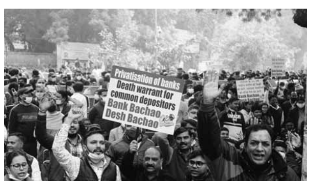
Employees of various public sector banks shout slogans against the move to privatise their banks during a protest near parliament in New Delhi on Thursday

New Delhi: Banking operations were impacted across the country on Thursday as lakhs of public sector bank (PSB) employees began their two-day strike to protest against bank privatisation.