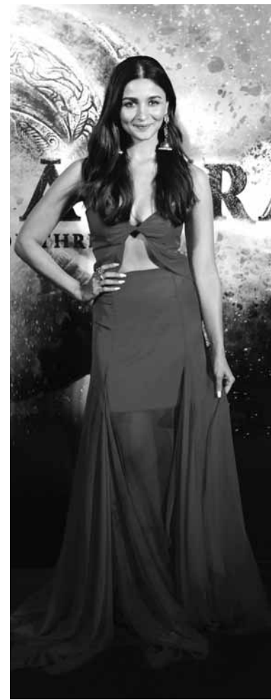
Bollywood actors Ranbir Kapoor, Alia Bhatt and director Ayan Mukherji during their forthcoming film Brahmastra's promotion at Thyagraj Stadium in New Delhi

One of the greatest and most loved contemporary actors, Khan and Saeed have been known for their superlative work in the popular television series Zindagi Gulzar Hai .