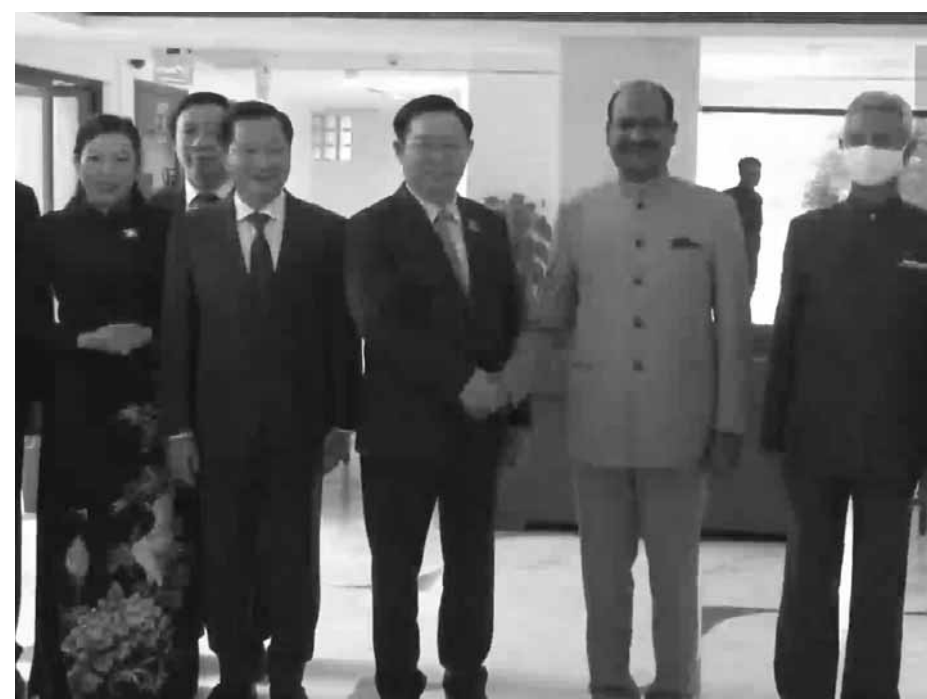
Lok Sabha Speaker Om Birla welcomes Vuong Dinh Hue, Chairman of the National Assembly of Vietnam, and his delegation at Parliament. Vuong Dinh Hue is on a five-day visit to India