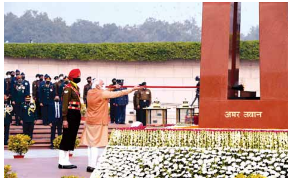
Prime Minister Narendra Modi during the homa and reception ceremony of Swarnim Vijay Mashaals on the occasion of 'Vijay Diwas' at National War Memorial in New Delhi on Thursday

However the occasion was marred by a controversy with Congress leader Rahul Gandhi and Priyanka Gandhi criticising the Government for ignor-