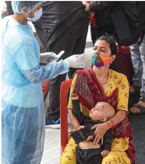
A health worker collects swab sample of an outstation passenger for Covid-19 test at Bandra Terminus railway station in Mumbai on Thursday

Michael Chan Chi-wai, who led the work, said the result needed to be interpreted with caution because the severe disease is determined not only