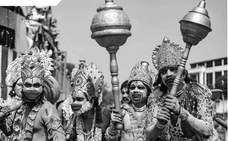
Artistes dressed as Lord Hanuman take part in a procession to mark Hanuman Jayanti, in Bengaluru