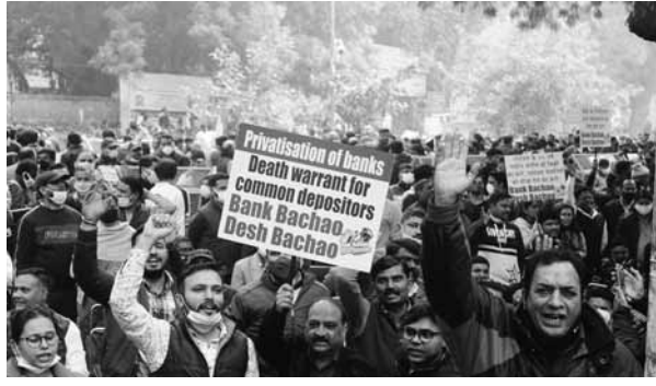
Employees of various public sector banks shout slogans against the move to privatise their banks during a protest near parliament in New Delhi on Thursday

New Delhi: Banking operations were impacted across the country on Thursday as lakhs of public sector bank (PSB) employees began their two-day strike to protest against bank privatisation.