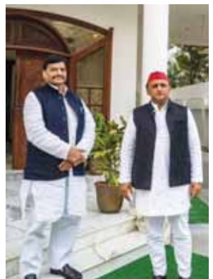
Akhilesh Yadav meets Shivpal Singh Yadav at his residence in Lucknow on Thursday

Following the meeting, Akhilesh tweeted and confirmed the alliance between the SP and the PSPL. "Met the PSPL chief and confirmed our alliance. The strategy of alliance with smaller parties is strengthening the SP and is taking the SP along with alliance parties towards a historic win," said Akhilesh.