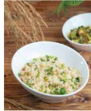
rice and spice meats called biryani, rice is a feast beyond compare. Hence, Café Delhi

The versatility of rice makes it the most loved grain all over the world. Right from the khichdi, to simple pulao to fragrant pots of