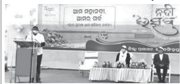
PNS ■ PARADIP

Responding to PM's appeal of a Nadi Utsav (River Festival) near every river in the country, multiple States with the help of the Centre held the celebrations at riverbanks on Wednesday to bring people closer to the rivers and protect them.