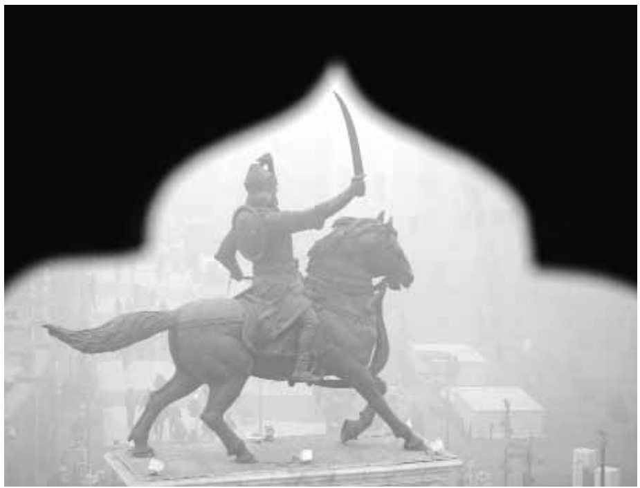
The statue of Maharaja Ranjit Singh at the Heritage street amid dense fog on a winter day in Amritsar on Thursday

On the occasion, he met and honoured the dependents of the officers and soldiers who were martyred in the 1971 War.