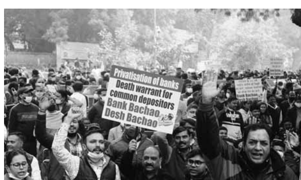
Employees of various public sector banks shout slogans against the move to privatise their banks during a protest near parliament in New Delhi on Thursday

New Delhi: Banking operations were impacted across the country on Thursday as lakhs of public sector bank (PSB) employees began their two-day strike to protest against bank privatisation.