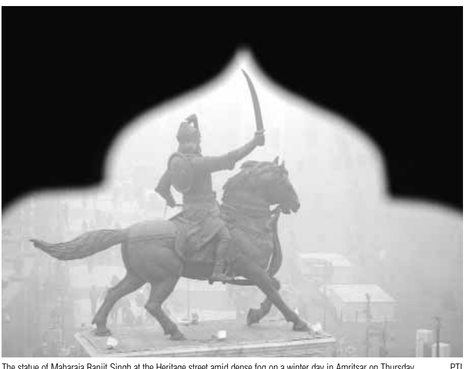
The statue of Maharaja Ranjit Singh at the Heritage street amid dense fog on a winter day in Amritsar on Thursday

the 1971 India-Pakistan war. Gehlot said the new rule will be extended to include the son and daughter of the martyr's daughter (Navasa-Navasi), even if adopted, as dependents. The son and daughter of the martyr's brother and sister too will be reckoned as dependents, he said. Gehlot said he is proud of being the Chief Minister of a state where every house has the spirit of martyrdom to protect the borders of the country. On the occasion, he met and honoured the dependents of the officers and soldiers who were martyred in the 1971 War.