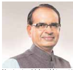
Vaccination Maha Abhiyan-10 today.

Chief Minister Shivraj Singh Chouhan has said that getting both the vaccines of Corona is the biggest social responsibility. By not taking the corona vaccine, we put the lives of ourselves, our family members and acquaintances at risk. The consequences of this type of social irresponsibility can be fatal. The target of cent percent vaccination of all eligible persons in the state is to be completed by the end of December. Chouhan said that I appeal to all social and voluntary organizations, media fraternity and every person to cooperate in fulfilling this goal. Chouhan was visiting the vaccination center operated at Sarojini Naidu School, Shivaji Nagar under