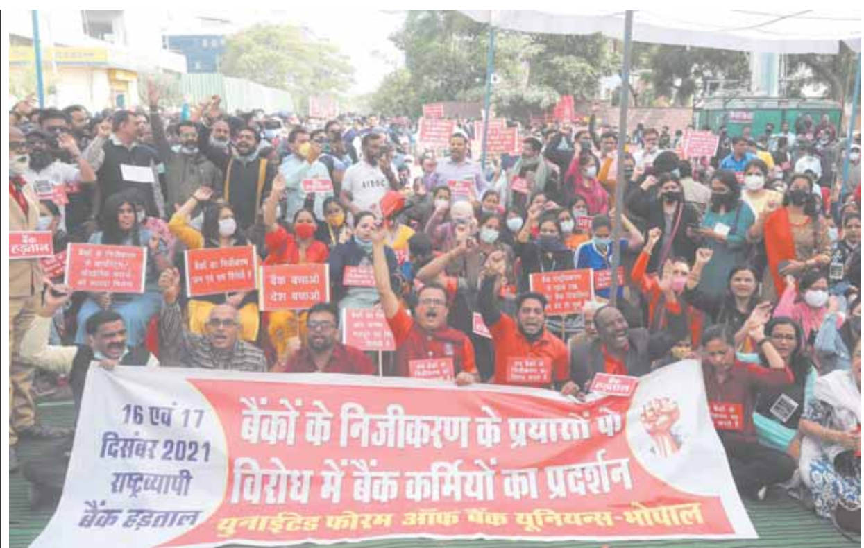
Bank employees stage a demonstration during a two-day nationwide strike called by the United Forum of Bank Unions to protest against privatization, in Bhopal on Thursday.

minister. The proposed tribunals, headed by a retired judge as commissioner, will have its jurisdiction in the entire state and in case of damage to public property, the collector will submit a report to the tribunal while building owners will share the onus in case the damage is done to any private property.