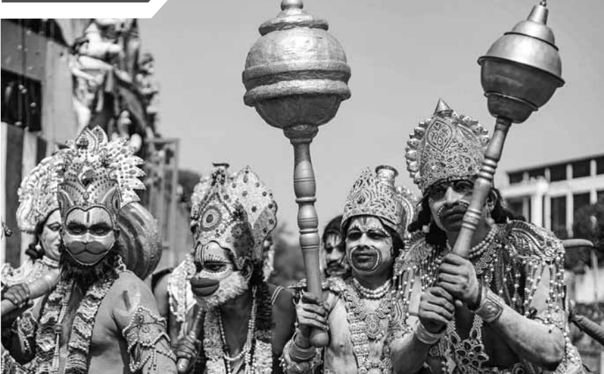
Artistes dressed as Lord Hanuman take part in a procession to mark Hanuman Jayanti, in Bengaluru