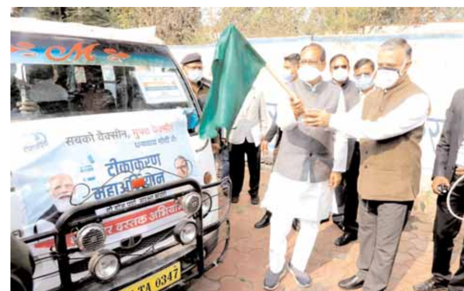
Chief Minister Shivraj Singh Chouhan flagged off Ghar-Ghar Dastak Vehicle under the vaccination Maha Abhiyan-10 in Bhopal on Thursday.