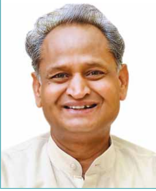
Ashok Gehlot Chief Minister, Rajasthan

“Extending heartiest greetings on the completion of three years of the state’s sensitive, transparent and accountable government. I wish for the happiness, prosperity, healthy life and all round development for the people of the state. Come, let us together take steps for the all-round development of Rajasthan with full devotion and commitment, and play our role with mind, promise and duty by being a partner.”