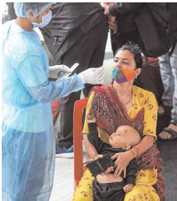
A health worker collects swab sample of an outstation passenger for Covid-19 test at Bandra Terminus railway station in Mumbai on Thursday

Michael Chan Chi-wai, who led the work, said the result needed to be interpreted with caution because the severe disease is determined not only