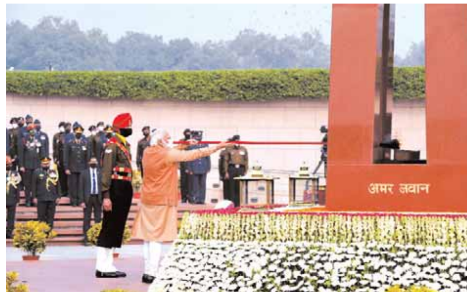
Prime Minister Narendra Modi during the homage and reception ceremony of Swarnim Vijay Mashaals on the occasion of 'Vijay Diwas' at National War Memorial in New Delhi on Thursday

However the occasion was marred by a controversy with Congress leader Rahul Gandhi and Priyanka Gandhi criticising the Government for ignor-