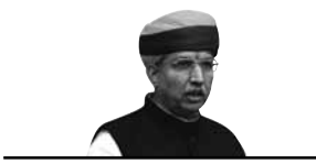
ARJUN RAM MEGHWAL

Starting his public life from being a municipal councillor in Ahmedabad to becoming India's Home Minister and Deputy Prime Minister, Patel had a very granular understanding of the various stakeholders of governance, administration, their relevance, roles and responsibilities. His steadfast approach to handling the nation's complexities made