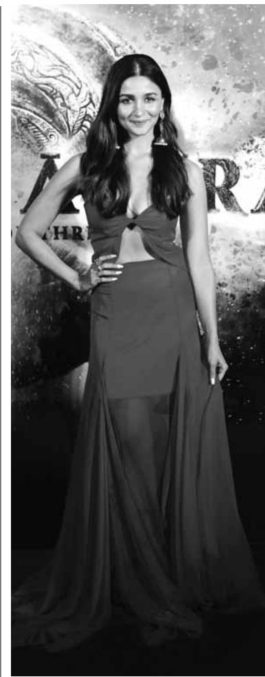
Bollywood actors Ranbir Kapoor, Alia Bhatt and director Ayan Mukherji during their forthcoming film Brahmastra's promotion at Thyagraj Stadium in New Delhi

One of the greatest and most loved contemporary actors, Khan and Saeed have been known for their superlative work in the popular television series Zindagi Gulzar Hai .