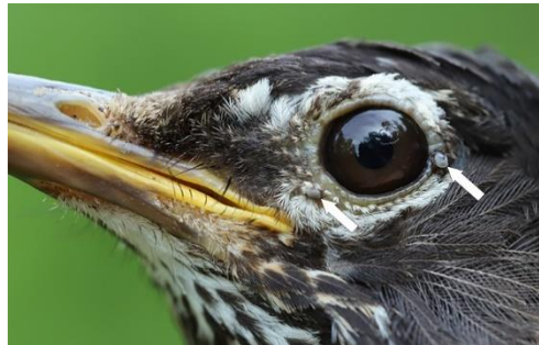
Figure 3. American Robin, second year female, parasitized by four I. scapularis nymphs (two not visible). On 22nd July 2019, this bird was in moult in preparation for the upcoming, southbound, fall migration.

During the nesting and fledgling period, songbirds forage contiguous to the nest, and maintain short-distance trips back and forth for food. Short runs ensure that the eggs in the nest stay warm and protected from predators. Additionally, during the fledgling period, ground-foraging songbirds make hasty flights near the nest, and promptly return to feed their young. As the ground-frequenting songbirds forage through the leaf litter or grass refuge searching for arthropods, they may become parasitized by host-seeking (questing) ticks. In the present study, bird banders, who were conducting demographic monitoring and collecting data related to songbird activity, had the opportunity to collect bird-feeding ticks. Notably, in late July, songbirds are in moult (shed and replace feathers), and only have localized flight activity. Based on the criteria for an established population [28], we were able to ascertain that there were solo populations of I. scapularis and H. leporispalustris ticks in the nesting and fledgling area at Montée Biggar, Québec. We were also able to determine that this nesting area is endemic for Lyme disease.