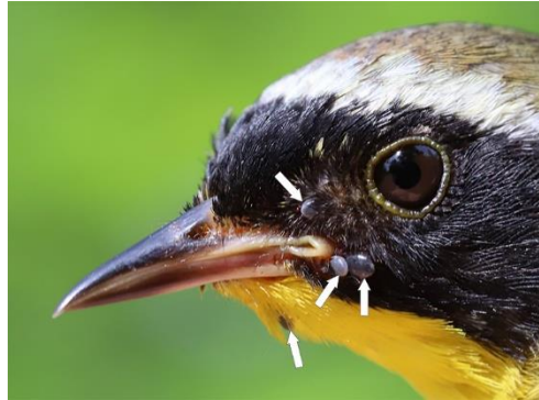
Figure 2. Common Yellowthroat, after-second year male, infested with 12 I. scapularis nymphs (eight not visible). This multi-tick bird parasitism brings to light the potential of this bird, and the attached nymphs, to establish a new population of blacklegged ticks.

In this study, we exposed I. scapularis and H. leporispalustris populations by monitoring a wooded area in southwestern Québec during the nesting and fledgling period. This deciduous woodland turned out to be a breeding colony of I. scapularis infected with Lyme disease spirochetes. The presence of Bbsl in these bird-feeding I. scapularis nymphs indicates that this nesting area is endemic for Lyme disease. Most importantly, these bird parasitisms during the nesting and fledgling periods provide a unique means of identifying established populations of ticks.