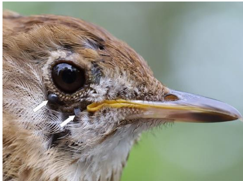
Figure 4. Veery, after-second year male, infested with three I. scapularis nymphs. One fully engorged nymph molted to a male in 31 d. On 22 nd July 2019, this bird was moulting to prepare for the southward flight to its wintering range in Brazil.