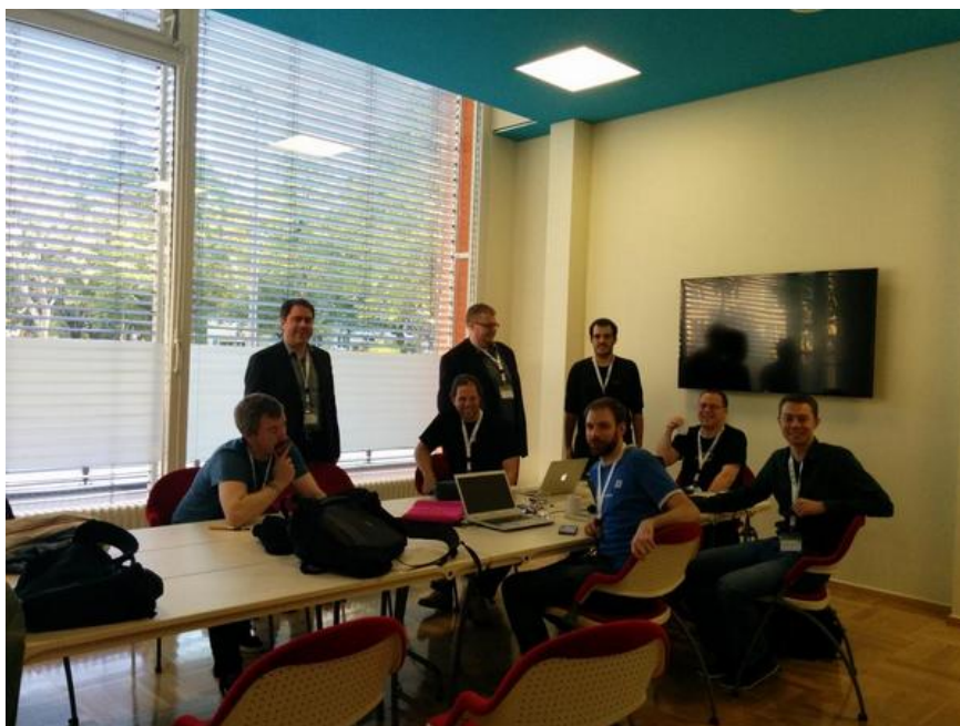
KDE hacking room at Qt Developer Days 2014 in Berlin.