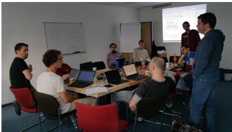
KDE PIM winter sprinter: user-centered design, porting to KDE Frameworks 5, and beyond.