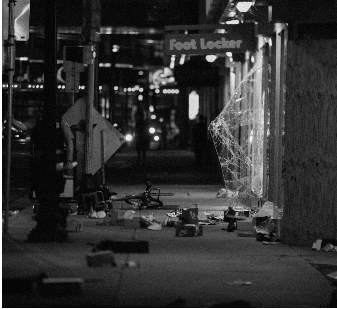
Minneapolis, August 26, 2020.

wages of whiteness have gotten really low. It's important to understand that whiteness and property are inextricable from each other: Without one there cannot be the other. We tend to think of property as tangible things or commodities, but it also includes rights, protections, and customs of possession passed down and ratified through law. Whiteness emerges as the race of people who are neither Indigenous nor enslavable—national identities are increasingly collapsed around the distinctions of slave/free and black/white.