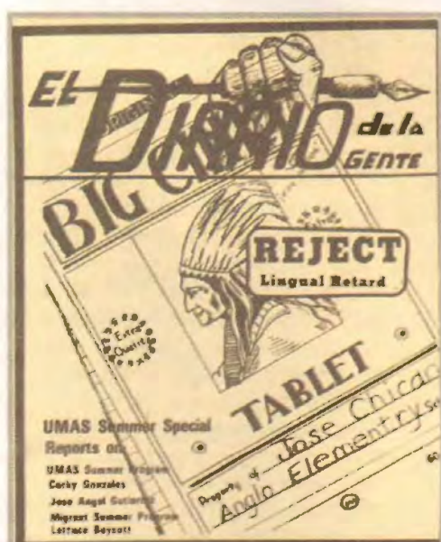
First edition, Summer '72

El Diario was An independent Chicana publication founded by CU Boulder students in the summer of 1972. It published information especially important to Chicana and other disenfranchised students. It served as an editorial, photo, and print product education tool while covering stories and presenting accurate information that no other news outlet published.