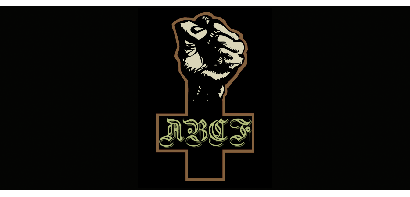
U.S. Political Prisoner and Prisoner of War Listing Edition 13.7, October 2020