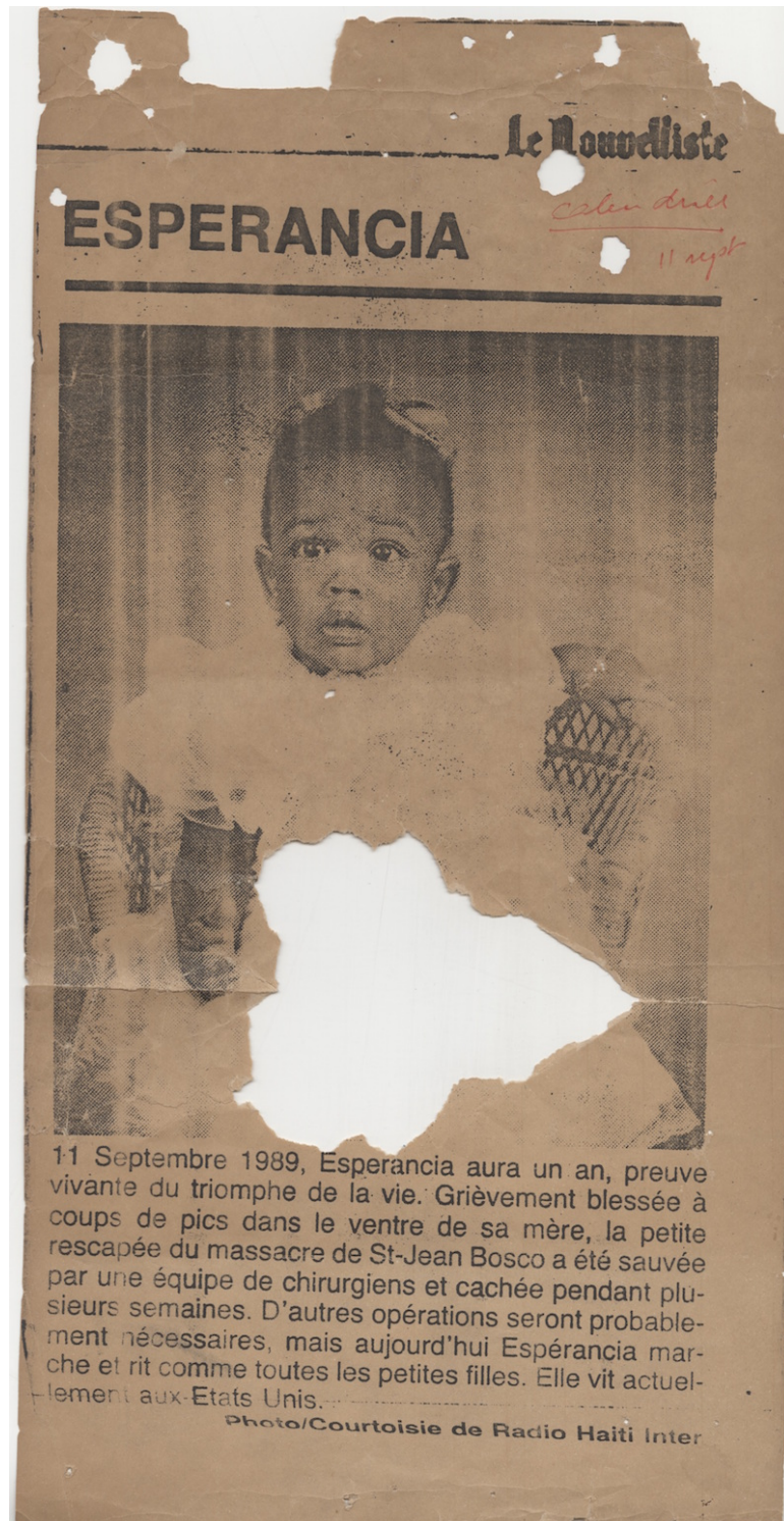
Figure 7 Esperancia

Genyen yon travay ki te fèt, ou yon travay ki pa janm fèt, ki fè ke moun pa sonje. Se sèlman trant an! Se trant an sèlman! Sa vle di ke genyen yon seri de bagay ke