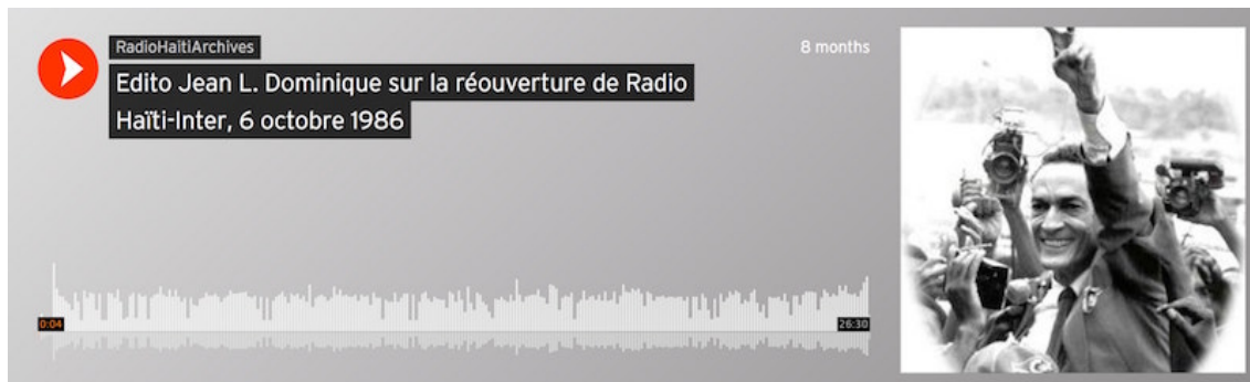
Figure 4 Jean L. Dominique's Editorial on the Reopening of Radio Haïti-Inter

to him as avoka peyizan yo , the peasants' lawyer. Under his leadership, Radio Haiti developed unparalleled democratic appeal and influence. Radio Haiti was democratic, in philosophy as well as practice, in no small part because radio itself is a relatively democratic medium in Haiti, something in which everyone can participate. The technology is relatively inexpensive, so an individual without a radio would certainly have a friend, relative, or neighbor who had one. Radio did not require traditional literacy—you did not have to read and write in order to participate as a listener or as a speaker. And Radio Haiti itself was in Haitian Creole in addition to French, demonstrating that the language spoken by all Haitian people could be used for serious topics and serious analysis.