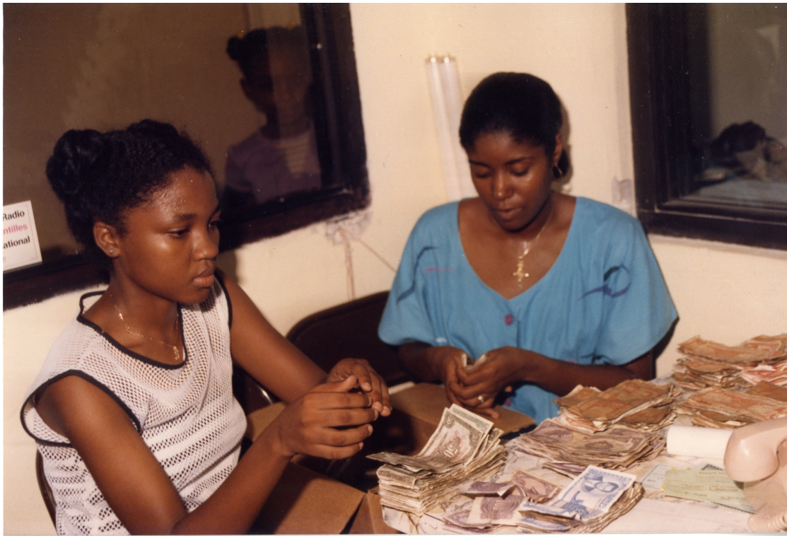
Figure 3 Radio Haiti Solidarity Campaign, 1986