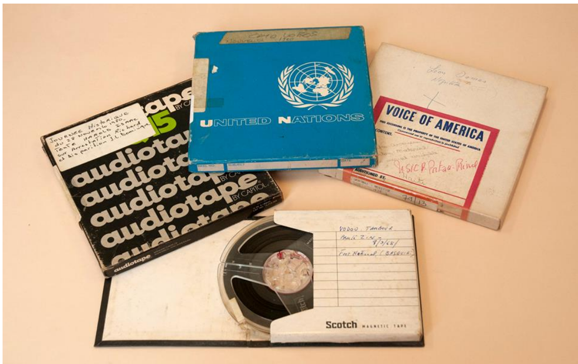
Figure 5 Radio Haiti Reels

Archiving Radio Haiti is a project of unprecedented complexity and scope. Audio archives, particularly those in less common languages, are notoriously time consuming and costly to process.