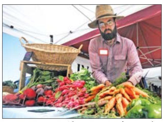
customers at 10:30 a.m. The www.everettfarmersmarket. location is at 2930 Wetmore com Avenue.

The Everett Farmer's Market is open every Sunday from 11 a.m. to 3 p.m. May 9 through October 31. Early shopping