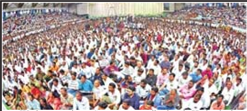
Workers meeting at Saroornager auditorium in Hyderabad

There was no immediate response from the government following the JAC announcement. After another 4 days, the JAC strike was called off. The JAC-1 and National Majdur Union have declared that the JAC strike is ready for cessation without any positive response from the government. The police, with the help of the police, prevented workers from entering the depot to join workers in their efforts to join the duties. Buses were operated with temporary drivers.