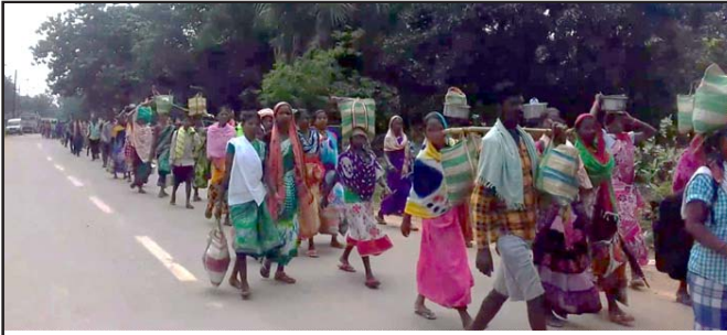
People dharna at Bacheli town in Dantewada District

governments are pursuing a privatization process for the mining of biladila iron ore. 1st Deposit to Tata Company, 2nd Deposit to Essar, 4th Deposit with Jindal Company Lease.