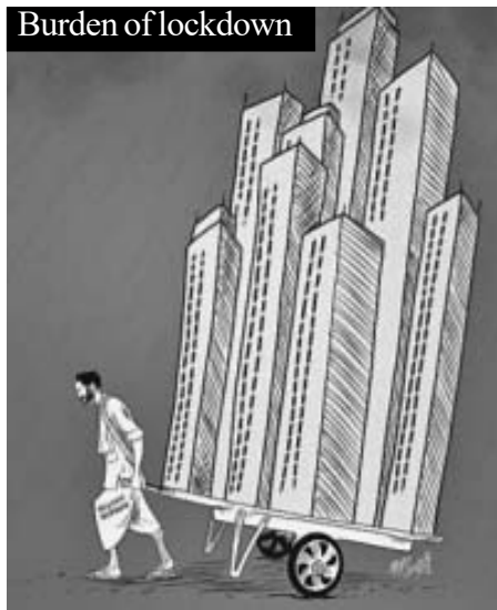
Burden of lockdown

The governments issued some health guidelines to people to contain virus: implementing social distance, frequently sanitation of hands, don’t spit on public places and stay at home; like this, as the only - way to stop the chain and spread the virus. All these guidelines are being issued by the union ministry of Home affairs and not the Ministry of Health and Family Welfare. These guidelines are being implementing by” lockdowns”,” police batons”, “fines”, “surveillance” and “night curfew”. This Virus is best tackled with the cooperation and trust of the citizens and build trust and restore faith in its institutions rather than by force. The only thing that will stop it in its destructive path is the ability to the state marshal its resources and use them efficiently and smoothly to identify vulnerable