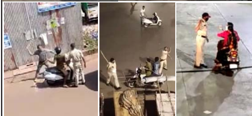
Police lati charging on people in lockdown