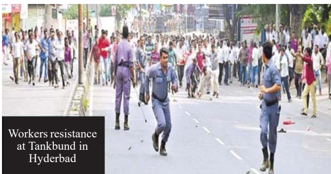
Workers resistance at Tankbund in Hyderabad

The round table meeting organized by the Somaji guda Press Club in Hyderabad was attended by all political parties in Telangana, labor unions, teachers' unions and the general democrats. The government, on the other hand, is trying to break the strike, forcing school and college buses from their employers, hiring unlicensed drivers and conductors,