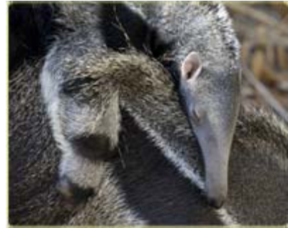
Anteater pup sleeping on his mother's back

Fans of the National Zoological Park are helping name the newest addition to the Zoo's anteater family, a male pup born to Maripi on December 7, 2010. The public will select the top three names from five offered by Zoo staff to symbolize the pup's confidence and strong personality. On April 6, 2011, each of the three names will be coupled with a different enrichment object and placed in the anteater yard. Mother Maripi will be released into the yard and whichever object/name she goes to first will become the pup's name. The giant anteater can be found in the wild in Central and South America, from Honduras to northern Argentina.