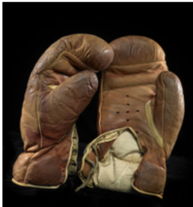
Boxing gloves worn by Gene Tunney in his "Long Count" match with Jack Dempsey

Boxing gloves worn by world heavyweight champion James Joseph "Gene" Tunney during the 1927 "Long Count" match with Jack Dempsey have been donated to the National Museum of American History by Tunney's family. "The Long Count" was a historic rematch between