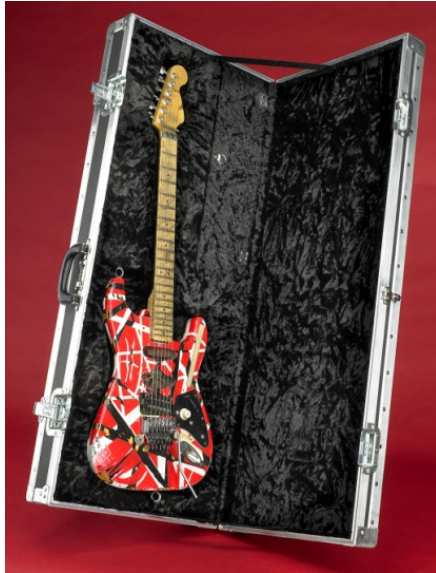
“Frank 2” guitar, replication of Eddie Van Halen’s original, customized “Frankenstein”

The National Museum of American History acquired the Eddie Van Halen “Frank 2” guitar played and made famous by Van Halen through a partnership donation with Fender Musical Instruments. It was made in 2006 as part of a joint venture between the artist and Fender to produce a limited edition number of guitars for the EVH Brand. Known as the “Frankenstein