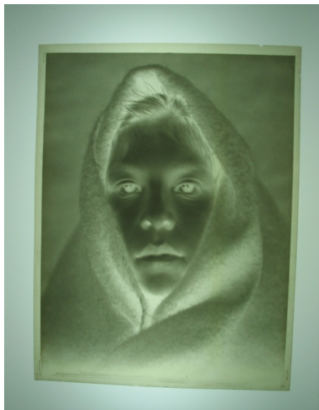
Makah girl, c. 1905. Original E.S. Curtis negative on a viewing light box.

The National Anthropological Archives of the National Museum of Natural History has received a remarkable donation of original negatives produced by Edward Sheriff Curtis, the