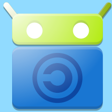
The logo of F-Droid

F-Droid is not the typical store where you buy something. Instead, it is a catalogue (or repository) of Free Software apps. You can easily browse, search and in-install apps onto your device. The F-Droid app also keeps track of updates for you.