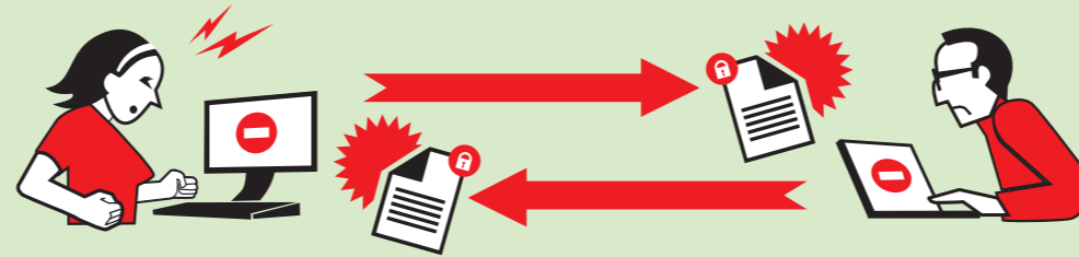
PROGRAMS WITH CLOSED FORMATS, DIFFERENT SOFTWARE

Alice uses the software program "Carcera (1) ." She records her report in a closed format (one that does not permit interoperability), then sends it to Bob, who has the same software program. He can read the document, modify it and send it back to Alice.