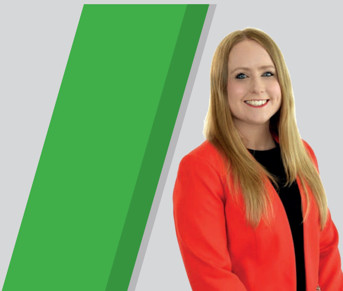
SINN FÉIN SPOKESPERSON ON PUBLIC EXPENDITURE AND REFORM Mairéad Farrell TD