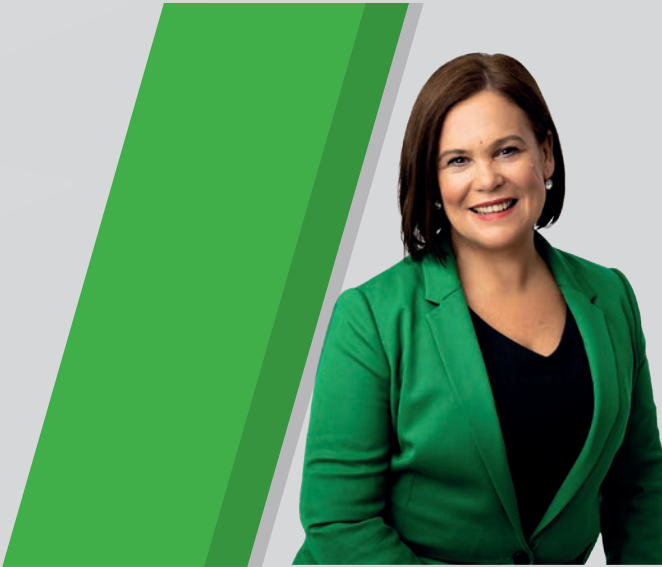
UACHTARÁN SHINN FÉIN Mary Lou McDonald TD