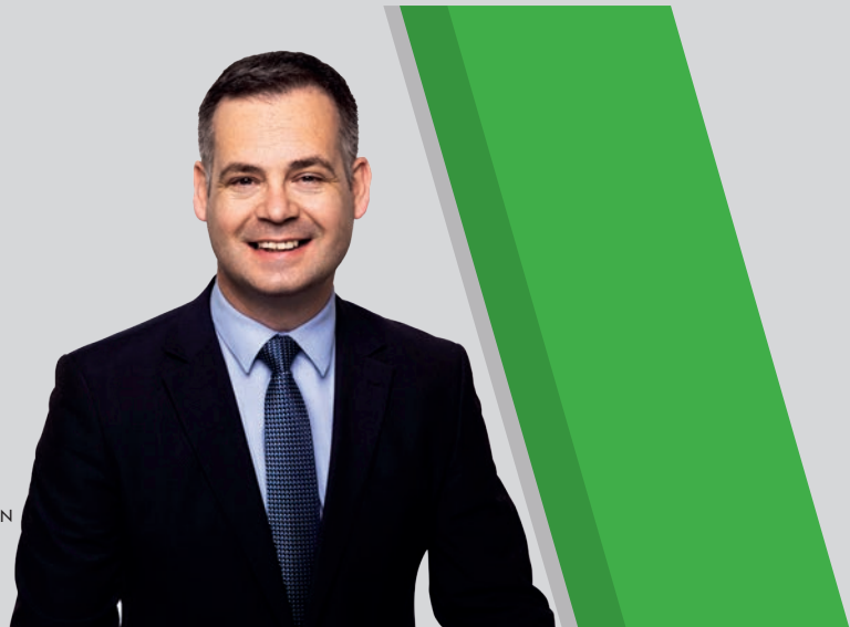
SINN FÉIN FINANCE SPOKESPERSON Pearse Doherty TD