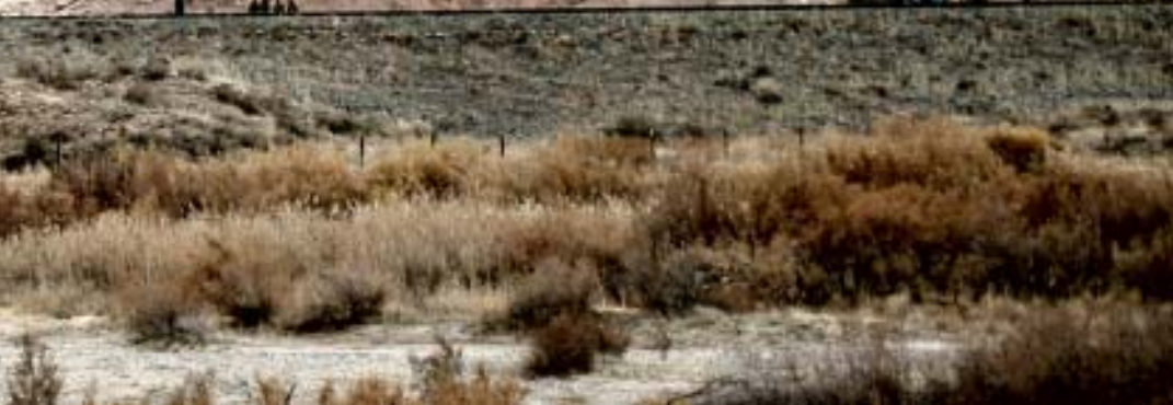
2006 MARCH - Armenian clerics on the Iranian border photographed the barren cemetery and its new feature - a shooting range.