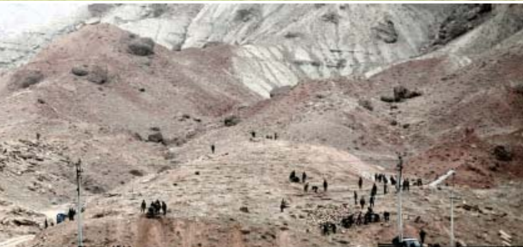
2005 DECEMBER - Approximately 200 Azerbaijani soldiers amassed at the Nakhichevan-Iran border to demolish the remaining grave markers at the Djulfa Armenian cemetery. They broke the remaining cemetery stones (dabanakars) with sledgehammers and axes. The broken cemetery stones were rolled down into the Arax river.