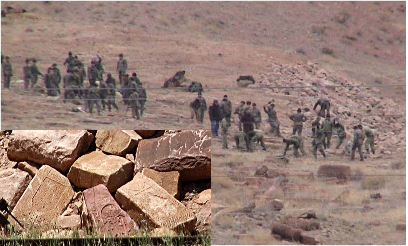
Beginning December 10, 2005, approximately 200 Azerbaijani soldiers amassed at the

Nakhichevan-Iran border to destroy the remaining grave markers (khachqars) at the Djulfa (Nakhichevan) Armenian cemetery. The broken cemetery stones were rolled down into the Arax river. To date, Azerbaijan bars any and all international missions from visiting the site.