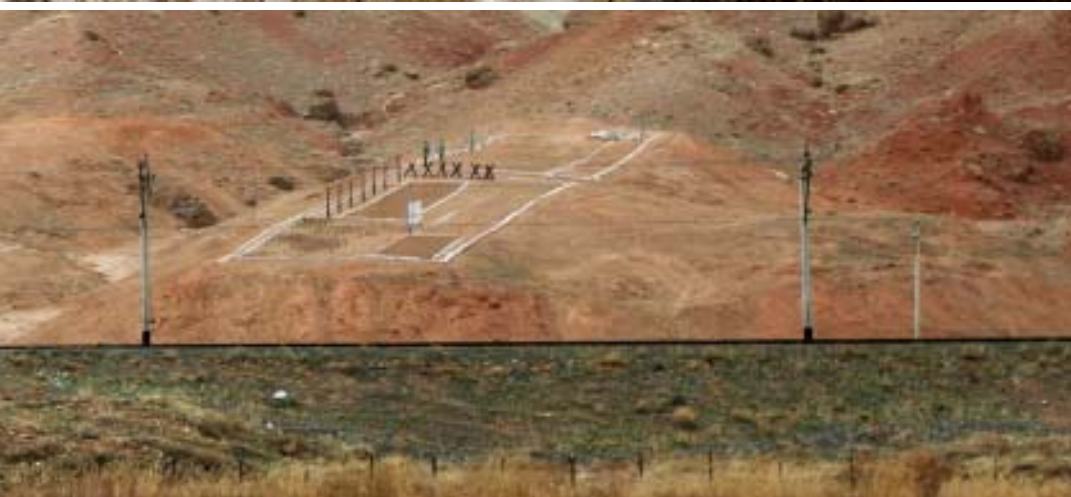
2007 FEBRUARY - To date, Azerbaijan refuses to allow any international mission to visit the site.