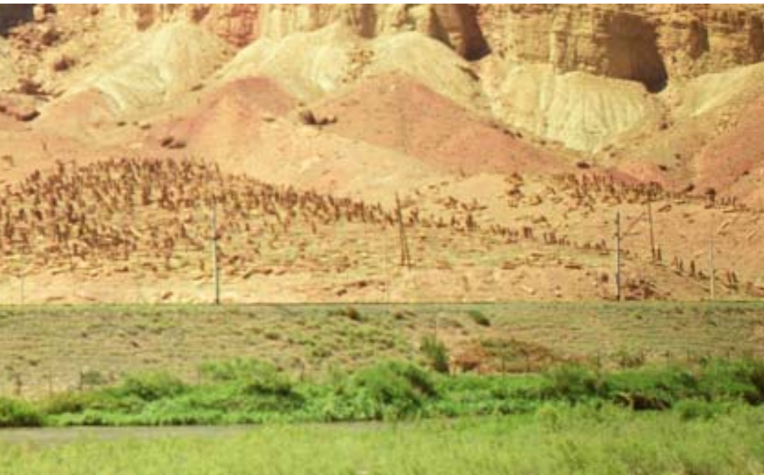
1997 - The Armenian cemetery at Djulfa in the region of Nakhichevan (on the right), photographed from the Iranian side of the border.