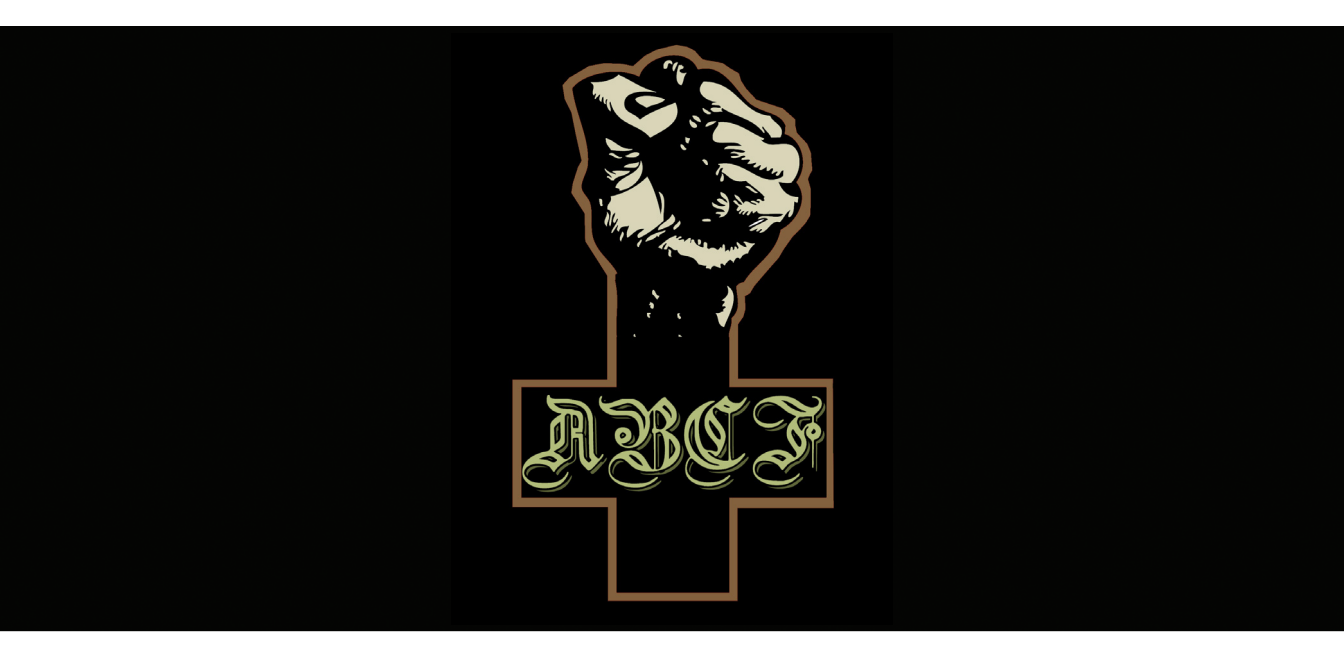
U.S. Political Prisoner and Prisoner of War Listing Edition 14.0.1, January 2021