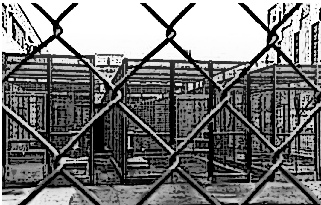
Exercise cages, San Quentin (Artist: Kendal Au)

The total number of people in long-term lock down in California on a given day exceeds 14,600