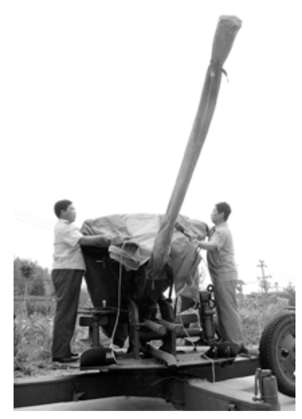
In China's active cloud-seeding efforts, anti-aircraft guns are used to shoot silver iodide crystals into the atmosphere. Beijing promises an intensive effort to clear the skies when the city hosts the Olympics in 2008.

In September 2001, the U.S. Climate Change Technology Program quietly held an invitational conference, "Response Options to Rapid or Severe Climate Change." Sponsored by a White House that was officially skeptical about greenhouse warming, the meeting gave new status to the control fantasies of the climate engineers. According to one participant, "If