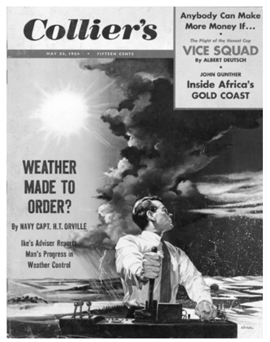
Experiments with cloud seeding during the Cold War inspired fantastic predictions about America's ability to control the weather, as in this 1954 article, and use it as a weapon against its communist adversaries.

"the science of things that aren't so." Yet there is hardly any scientific foundation for most claims about weather modification. Cloud seeding apparently can augment "orographic" precipitation (which falls on the windward side of mountains) by up to 10 percent. It is also possible to clear cold fogs and suppress frost with heaters in very small areas. That is the extent of what has been proved. Nevertheless, millions are still spent on cloud seeding today, largely by local water and power companies.