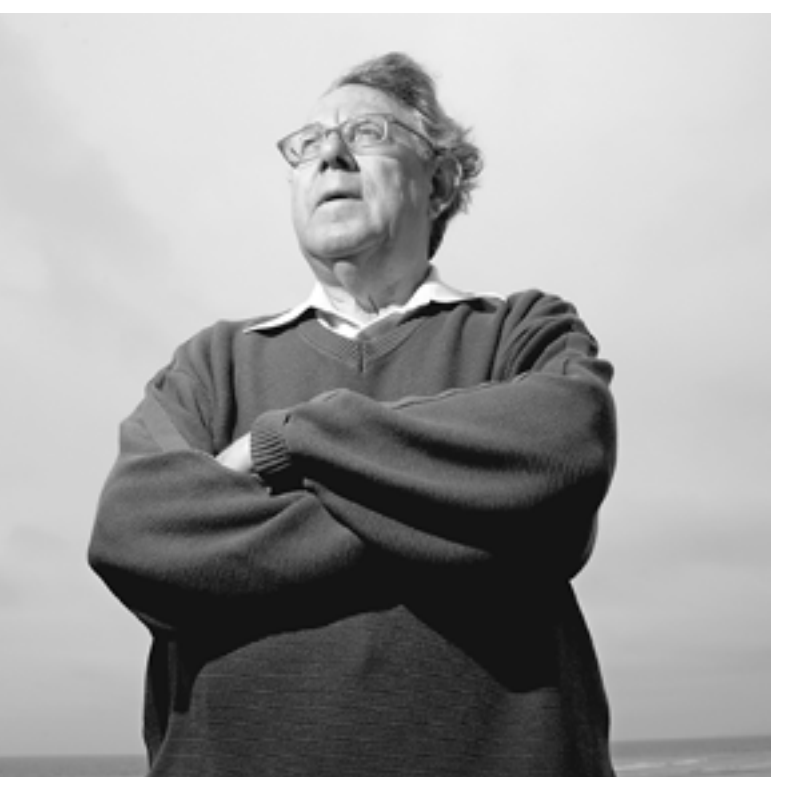
Nobel laureate Paul J. Crutzen favors a planetary "shade."

As the sole historian at the NASA conference, I may have been alone in my appreciation of the irony that we were meeting on the site of an old U.S. Navy airfield literally in the shadow of the huge hangar that once housed the ill-starred Navy dirigible U.S.S. Macon . The 785-foot-long Macon , a technological wonder of its time, capable of cruising at 87