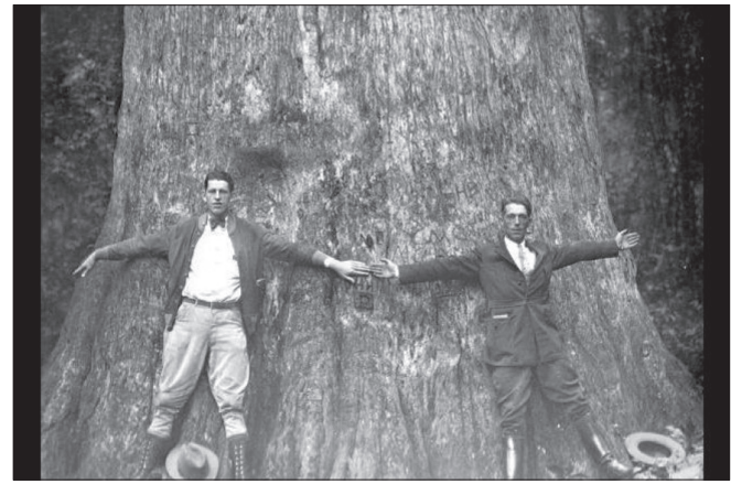
An old photo of The Senator, recently deceased 3,500 year old cypress tree in Florida. See Feb 28, inside, for details.