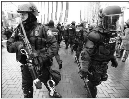
"Peacekeepers" come out to suppress F29 protests in Portland, OR; Chevron leaves its mark in the Amazon of Ecuador; Yeah, that's right... Burn it to the ground!