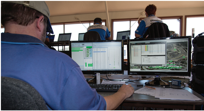
Monitoring cars and Ubiquiti products from command center