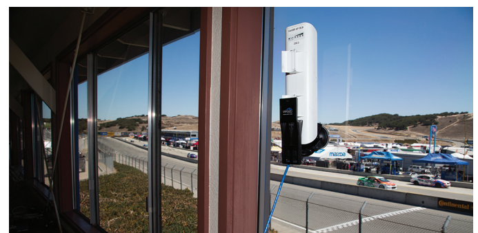
NanoStationM in command center

Some racetracks have sections where there is no line of sight to the command center, so Point-to-Point (PtP) bridges must be used to deliver the data to an area with line of sight.