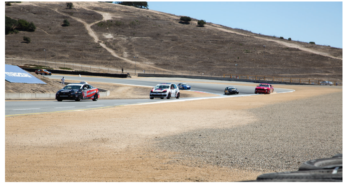
Sports cars running test session at racetrack