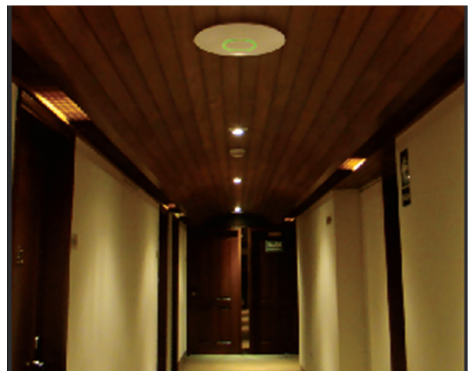
UniFi Access Point installed in hallway for guest rooms

Ernesto Castillo, Head of Corporate Communications, Estelar Hotels