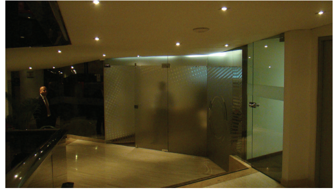
UniFi Access Point installed next to meeting rooms