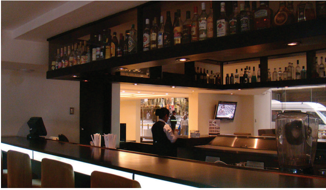
UniFi Access Point installed in hotel lounge