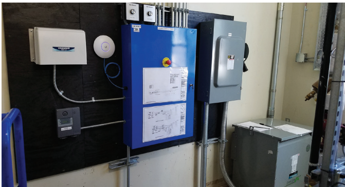
UniFi AC Lite AP mounted on a wall panel

The APs are monitored and managed by the UniFi Controller software, which conducts device discovery, provisioning, and configuration of UniFi devices via a web browser or the UniFi mobile app. Aegis uses a cloud server for remote access of the UniFi Controller software and also keeps a backup on a UniFi Cloud Key.