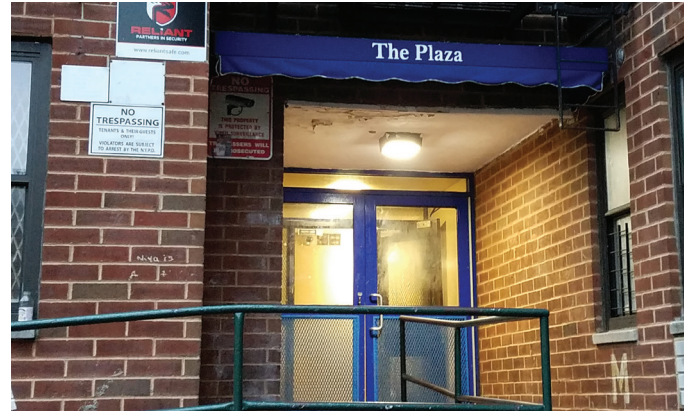
Installation site: The Plaza