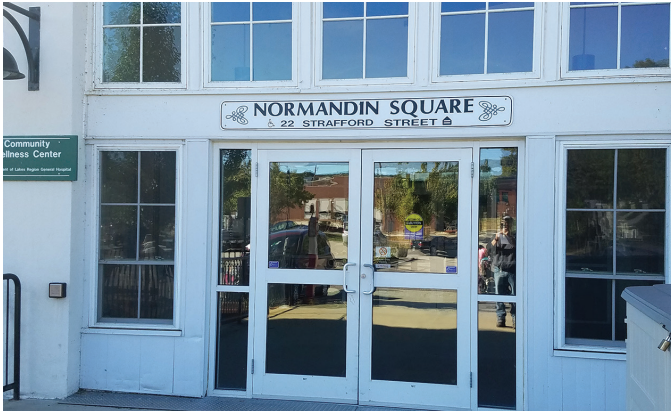
Installation site: Normandin Square

Aegis found the Ubiquiti products easy to install and configure. Aegis began deploying the EdgeRouter X devices and UniFi AC Lite APs in New York City and now installs them in various locations across the New England area as well as Washington, DC. The UniFi Cloud Key was installed at the Aegis headquarters in Massachusetts.