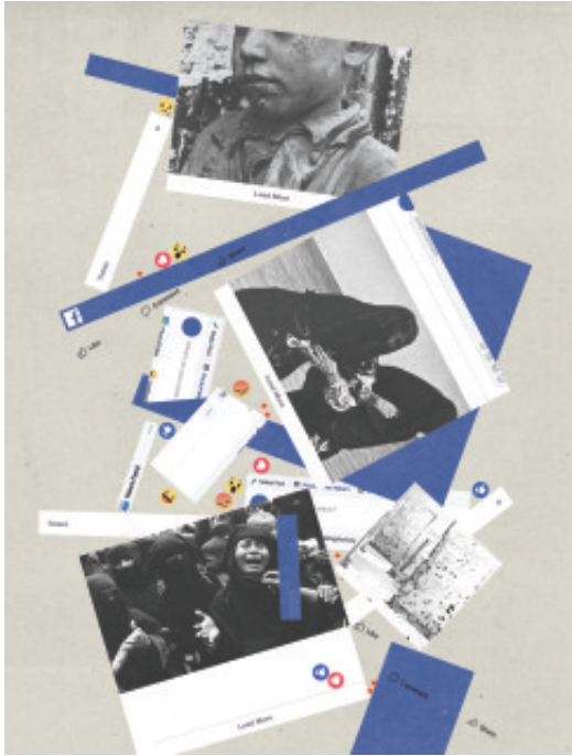
Illustration for Techonomy

This week a New York Times investigation revealed that Facebook had secret deals with numerous companies for access to user data, including in some cases the contents of millions of users' private messages. The companies included Amazon, Sony, Microsoft, Yahoo, Spotify, and Netflix, as well as two firms considered security threats to the U.S.: Chinese smartphone manufacturer Huawei and Russian search engine Yandex.