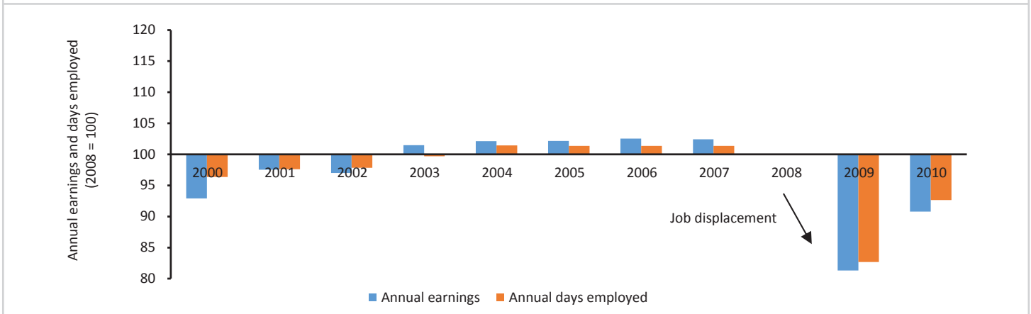
Figure 2. Earnings and Employment before and after Job Displacements in Germany, 2000–10