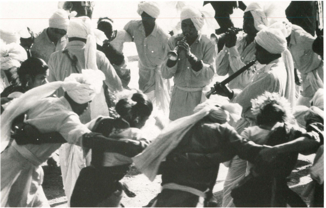
Folk dancers join in a circle dance to celebrate a festival in Gujarat.