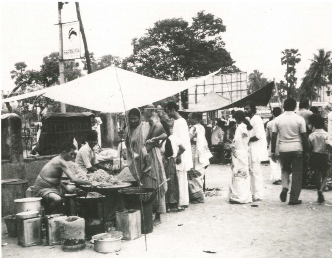
Icons and images for sale in a mela stall.

Melās have always been educational events, and it is through such exposure to these folk artists as well as folk theater groups that children learn of the living traditions of the wider community. Historically, the country fair in India has provided the forum within which various religious leaders, holy men and intellectuals would present their opinions. It was at melās that Western missionaries debated Hindu brabmans and Muslim maulvīs before assembled crowds. Currently, the state governments have recognized that melās are important events through which knowledge can be disseminated, so it is not uncommon to see pavilions set up at melās featuring exhibitions of modern agricultural technology, alternative energy sources and family planning.