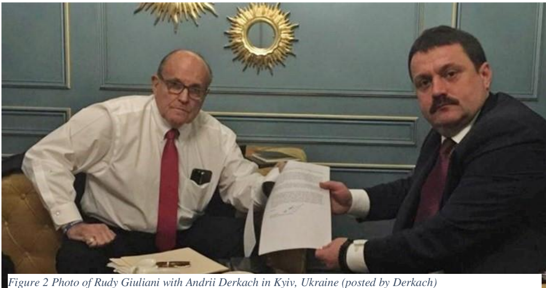
Figure 2 Photo of Rudy Giuliani with Andrii Derkach in Kyiv, Ukraine (posted by Derkach)