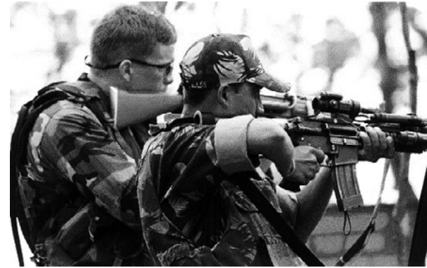
Mizoram, India, 2004: U.S. troops in a joint training exercise with Indian soldiers at the Counter Insurgency and Jungle Warfare School (CIJW). The school, initially established in the 1970s to help quell Naxalite (Maoist) and national liberation movements in India, was more recently also used to train the Nepalese government forces in their bloody operations against communist insurgents and the Sri Lankan military for its anti-Tamil war. The U.S. farmed out some of the tasks of supporting Colombo's anti-Tamil war to its Indian capitalist ally.

In situations where Washington backs an openly barbaric regime, it sometimes outsources part of the task of providing direct support to the regime to its rabid junior partners. Thus the U.S. propped up apartheid South Africa up until the 1990s through its Israel and Taiwan allies. After the 1991 Dili massacre of East Timorese people by the Indonesian military,