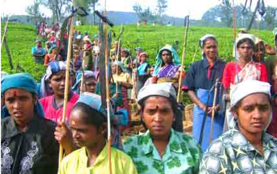
Hatton Bogawantalawa, Sri Lanka, November 2006: Striking tea estate workers march through the estate demanding a pay rise. Mainly women and descendant from those Indian Tamils who were brought by the British colonialists as indentured labour, upcountry estate workers are both the most downtrodden workers in Sri Lanka and the most strategically placed. The working class is the class that can lead the Lankan masses of all ethnicities to champion Tamil national rights and win their own liberation from capitalist exploitation.

each whipping up, and appealing to, rival ethnic chauvinist feelings. In the case of the Tamil elite politicians, they could at least point to a legitimate fear that the Tamil minority would be oppressed in a majority-Sinhalese independent Ceylon. Under colonial rule, all the non-European peoples on the island - whether Sinhalese, Ceylon Tamil, Muslim Moor or up-country Tamil (the latter are descendants of those brought by the British as semi-slave labour in the nineteenth century and have a culture and heritage somewhat distinct from Ceylon Tamils) - were arrogantly downtrodden by the British. The Tamil people rightly feared that after independence they would still be downtrodden - this time under Sinhala rulers.