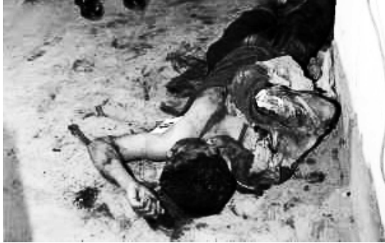
October 2000: Victims of a horrific massacre of 24 Tamil prisoners on 25 October 2000. Atrocities against Tamil People in Sri Lanka did not just start in the last year of the Civil War as portrayed by the Western media.