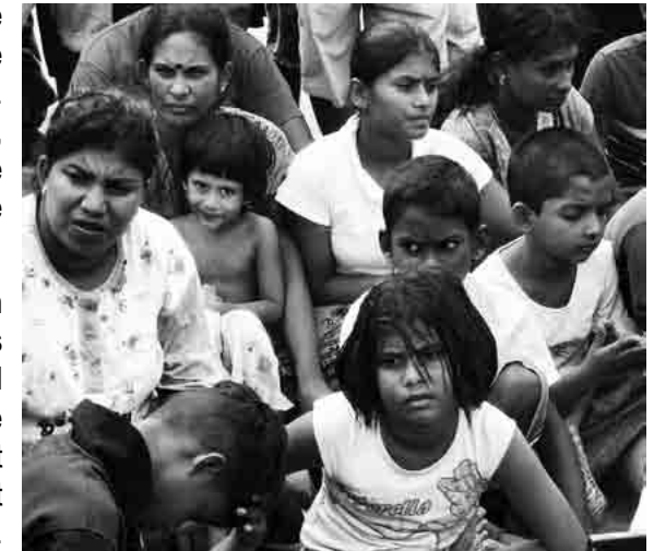
Denied asylum: For up to six months over 250 Tamil refugees were stuck in a port at Merak, Indonesia in overcrowded conditions without access to proper medical care. They were heading to Australia but Rudd pressured the Indonesian Navy to intercept their boat.

The outcome of Stephen Smith's Colombo trip and the Gillard/Rudd government's cruel incarceration of Tamil refugees is yet more confirmation that the Western capitalist rulers are not and will never be allies of the Tamil national liberation struggle. Yet, in desperation, the large Tamil Diaspora in the West has for the last several decades pursued a strategy of appealing to these capitalist governments to come to the aid of the Tamil people. This strategy has continued since the defeat of the LTTE last May. However, the Western governments strongly backed the Sri Lankan state's brutal war on the Tamil people. On 5 November 2008 as Lankan artillery and air attacks rained death on the Tamil people, then Commander of the U.S. Pacific Joint