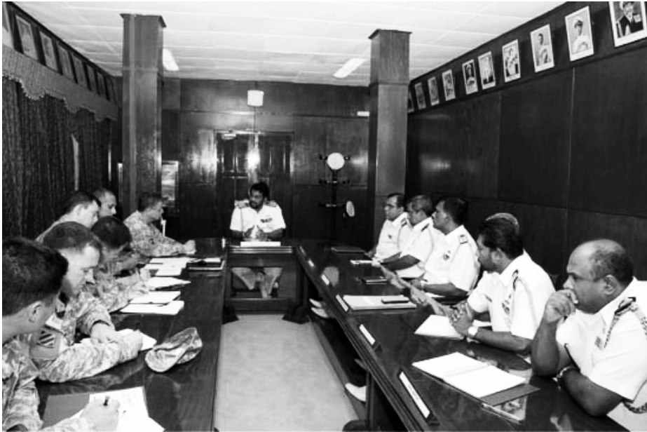
Sri Lanka Naval Headquarters, Colombo, 28 April 2009: A delegation of the United States Pacific Command calls on the Commander of the Sri Lanka Navy Vice Admiral Wasantha Karannagoda. The official website of Sri Lankan Navy describes the meeting as follows: “The delegation led by Lieutenant Colonel Michael Pettigrew was warmly welcomed by the Navy Commander. They held cordial discussions on issues of mutual interests [like stopping LTTE boats] with the Navy Commander and several high ranking Naval officials of the Sri Lanka Navy.”

crimes against Tamil civilians during the conflict, including strafing (attacking, usually with automatic weapons, ground targets from low-flying aircraft) of villagers from Israeli supplied Kfir jets. One of the most notorious crimes was the 9 July 1995 massacre of over 120 Tamil civilians in a strike by the Sri Lankan air force on The Church of Saint Peter and Saint Paul in Navaly in the Jaffna peninsula. The attack followed the Sri Lankan military distributing leaflets telling Tamil people to gather at places of worship to avoid getting caught up in a government offensive. Hundreds of Tamils then took refuge at the church but it was heinously targeted even though it was well away from any fighting.