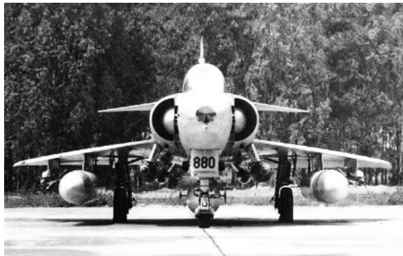
Israeli Kfir jets supplied to the Sri Lankan military played a big role in the war and were notorious for bombing Tamil civilians. Since the jets use U.S. General Electric-made engines, their sale to a third country requires U.S. government approval. U.S. support to the Sri Lankan military was often channelled through Israel and India.