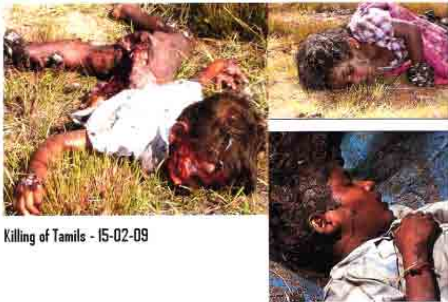
Killing of Tamils - 15-02-09

The UN estimated that 6,500 civilians were killed and another 14,000 injured between mid-January and mid-April 2009 as the LTTE and the Tamil population that supported them were forced by the Sri lankan war machine into a narrow strip of land in the north of the island. There are no official casualty figures after this period but estimates of the death toll for the final four months of the war range from 15,000 to 20,000.