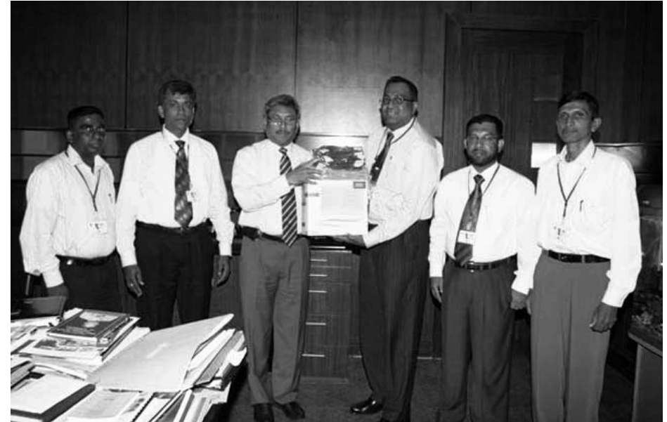
Sri Lanka Ministry of Defence official website

Colombo, 14 July 2009: Local executives of Australian-owned and controlled Ansell Lanka Ltd. hand over 650,000 rupees to Sri Lanka's Secretary of Defence Mr. Gotabaya Rajapaksa for the Api Wenuwen Api fund. The fund is to build housing for the Sri Lankan military forces in "appreciation" of their victory in the war against Tamil rebels. In the same ceremony, Ansell Ltd also donated a consignment for 2 million rupees worth of surgical gloves to the Sri Lankan Army. Ansell's rubber glove factory is the biggest foreign-owned manufacturing enterprise in Lanka and is notorious for its sweatshop exploitation of local workers. Ansell owners support the state forces that brutally enforce this exploitation.