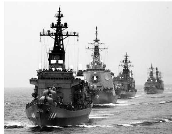
September 2007, Bay of Bengal: The Australian Navy joins the navies of the U.S., India, Japan and Singapore in “Malabar,” one of the biggest ever peacetime, military exercises in the world. The thinly veiled aims of the exercise were to intimidate China and to practice naval operations against Tamil Tiger cargo vessels. The Sri Lankan government openly welcomed the exercise saying it would bolster military cooperation against Tamil Tiger arms smugglers.

At the other end of the spectrum of capitalist-ruled, ex-colonial countries are ruling classes that maintain a strong anti-colonial posture. Historically amongst these rulers are those of nations that have had militant struggles for independence against direct colonialism – like Angola, Mozambique and Algeria (where the rulers postured as “anti-imperialist” in the 1960s and 70s.) In these countries an anti-imperialist pretence is essential if a regime is to have any credibility. Yet typically what made such an anti-imperialist posture possible was the backing that they received from powerful socialistic states: the USSR when it existed and now the increasingly influential Peoples Republic of China (PRC.) This backing not only protected these “non-aligned” states from military attack by vengeful imperialism but enabled them to receive access to capital and technology without having to hand over control of a huge chunk of their economy - as is typical in dealings with the capitalist powers. For example, in the time of the USSR, hundreds of thousands of people from friendly African, Asian and South American countries became highly trained specialists by studying on scholarships at Soviet universities. Meanwhile, from 1970-1975, the PRC conducted one of the biggest genuine aid projects in Africa when it built the famous 1860km long TAZARA railway from landlocked Zambia to the Tanzanian port