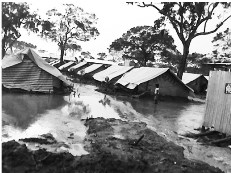
Manik Farm, Northern Sri Lanka, August 2009: Rain floods the giant camp where 300,000 Tamils were imprisoned for several months in unsanitary conditions.

powers talk “human rights.” For when these states are attacked by the U.S., British and Australian rulers over “human rights” this is inevitably a cover for promoting capitalist counterrevolutionary forces there. The governments of the poorer capitalist countries also resent meddling by the richer capitalist powers – meddling which is often aimed at increasing imperialist exploitation within their borders. For although the leaders of these countries are tied to the imperialists, they do wish that the latter would not bully them so much.