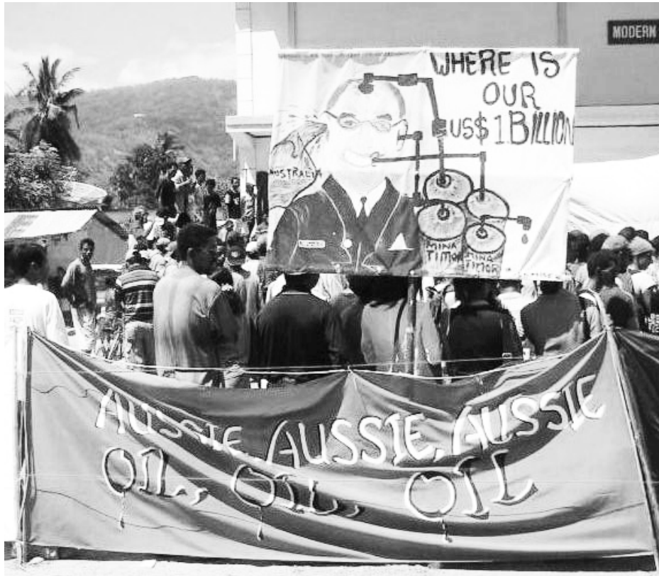
Dili, 2004: East Timorese people protest outside the Australian Embassy against the Australian government's theft of East Timor's oil resources. Australian intervention to "liberate" East Timor was aimed to secure its "right" to plunder the impoverished country's natural resources.

capitalist forces within China. This contest between the PRC left and the PRC right will shape not only China but indeed the whole world. The world's oppressed, not least the Tamil people, need the genuinely communist forces to triumph within the PRC. Part of the march towards that triumph will come through popularising the need for a foreign policy that is based on an alliance with the exploited and oppressed of the world. We therefore make the following appeal. Sister and brother Chinese masses: You have made much headway towards your liberation since you grabbed state power through your great Revolution 60 years ago. But here in the capitalist world – from Mexico to Sri Lanka to India to Australia - we are still suffering. We need your help – help us to achieve our liberation too! Drop your foreign policy of "non-interference"! We respectfully warn you too that unless you help us to rid ourselves of our oppressors, these same oppressors will gang up and eventually succeed in rolling back your revolution. And then