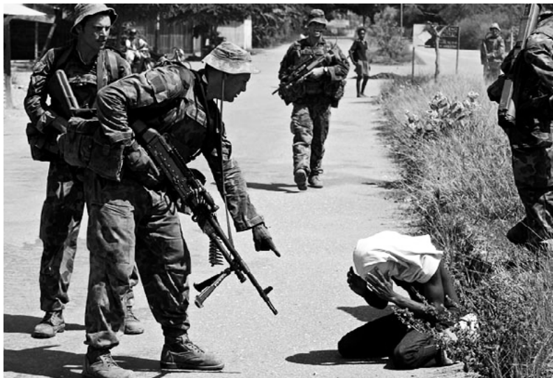
Australian military bringing “human rights” to East Timor. Under the guise of saving East Timorese people, Australian imperialists grabbed East Timor as its own neocolony and subjugated the Timorese masses.

protect the people. Having made the pro-independence masses helpless, the imperialists allowed the right-wing riots to run their course before a massive Australian-led military force cynically invaded East Timor under the pretext of being its “saviours.”