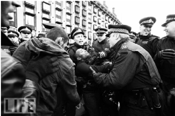
How Western capitalist states will "support" the Tamil people! 7 April 2009: British police brutally attack Tamil protesters in London.

For its part Britain, from 2006 to 2008 alone, sold Lanka $24.5 million worth of military equipment. This included armoured vehicles, machine gun components, grenades, ammunition, components for combat aircraft and semi-automatic pistols ( TamilNet , 2 June 2009.) And that is just what was officially provided! Western ally Slovakia, meanwhile, supplied 10,000 rockets to Colombo in the same period.