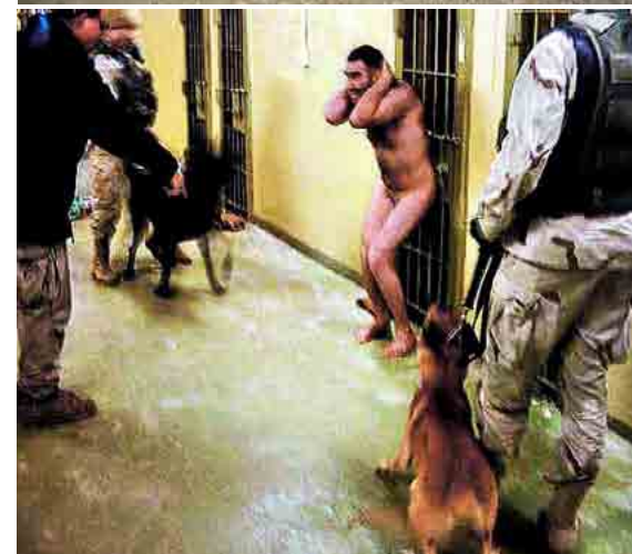
U.S. soldiers torture an Iraqi detainee in the notorious Abu Ghraib prison.