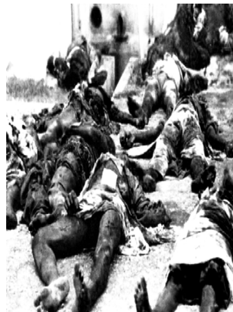
Tamil people massacred by the Sri Lankan military.