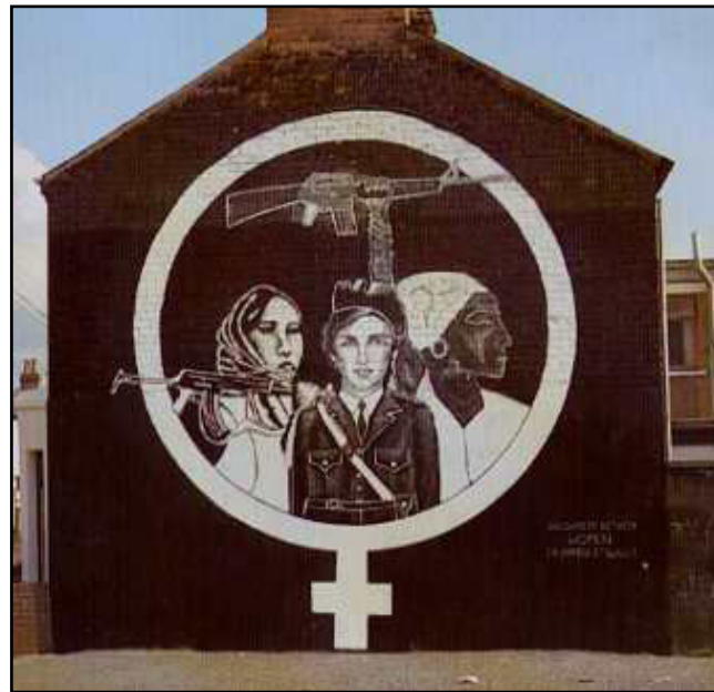
A mural in occupied Der-

The following document is part two in a two-part series: the first of which was “Super-exploitation of Women and Developing a Revolutionary Mass Line.” 1 This is the second version of this particular document, which has been revised for Volume #7 of Uprising .