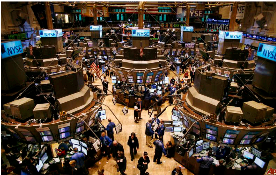
That monstrosity of finance capital known as the New York Stock Exchange, an extreme expression of the social anarchy of capitalist production.