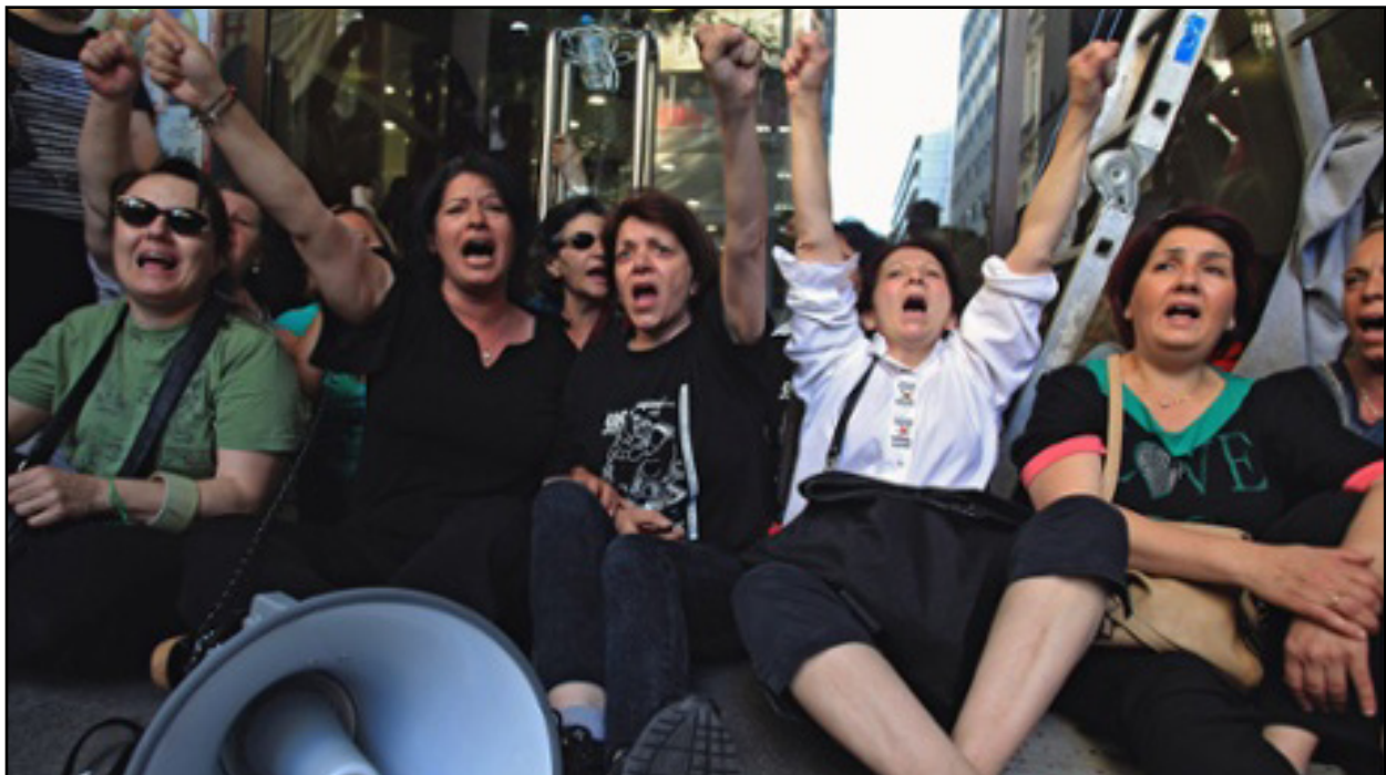
Fired cleaners of the Greek Finance ministry occupying the ministry's entrance and shouting slogans for the implementation of an Athens court ruling that ordered their re-hiring in Athens, Greece, 22 May 2014. The court recently ruled that the jobs of 393 cleaners, who had lodged an appeal to keep their positions, were 'obviously necessary' and ordered their reinstatement, terming the procedure implemented for the women unconstitutional and therefore null.

15 Mies, 182. Marx recognized the patriarchal family as a form for the management and inheritance of private property, in particular in the Communist Manifesto. Italian feminists such as Dalla Costa critiqued the typical Marxist division of productive and reproductive labour by arguing that women are producing commodities for exchange when they reproduce labour power itself. Whether or not we adopt this position, the fact remains that the nature of capitalist social relations within as they pertain to the production of immediate use values in the family and the community is an integral area of social investigation and revolutionary feminist theorizing.