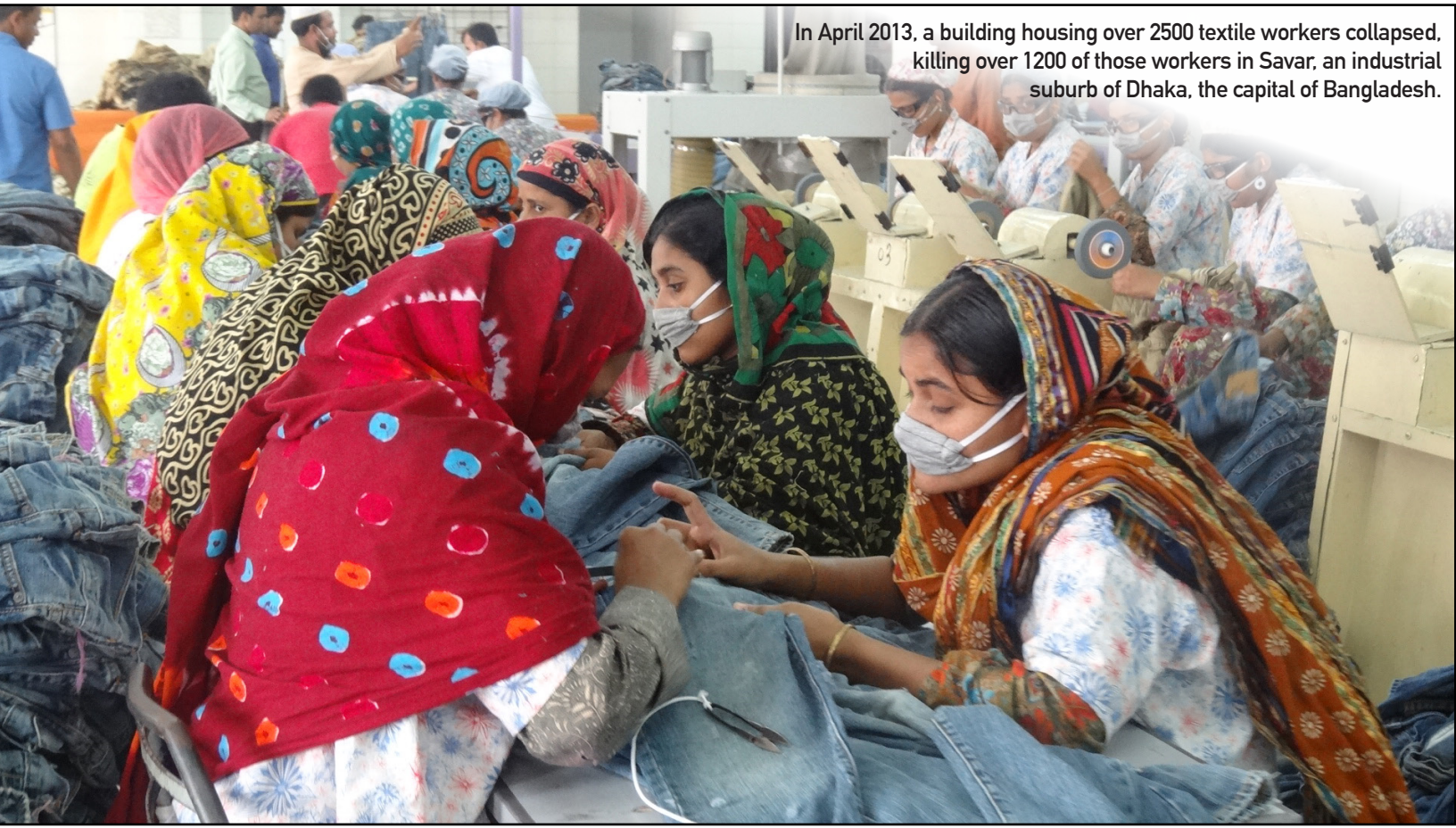
In April 2013, a building housing over 2500 textile workers collapsed, killing over 1200 of those workers in Savar, an industrial suburb of Dhaka, the capital of Bangladesh.