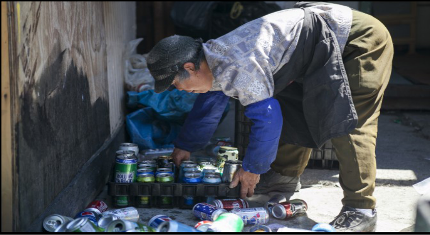
An appendage to the recycling industry.

has come to the fore in recent decades with the drastic increase in the mobility of labor across the globe. The massive movements of people in search of employment wherever, under the social anarchy of production, capital is in need of labor constitute one pivotal process of proletarianization today and one crucial form of the socialization of labor. It makes the proletariat, not just theoretically but also practically in its conditions of life, an international class .