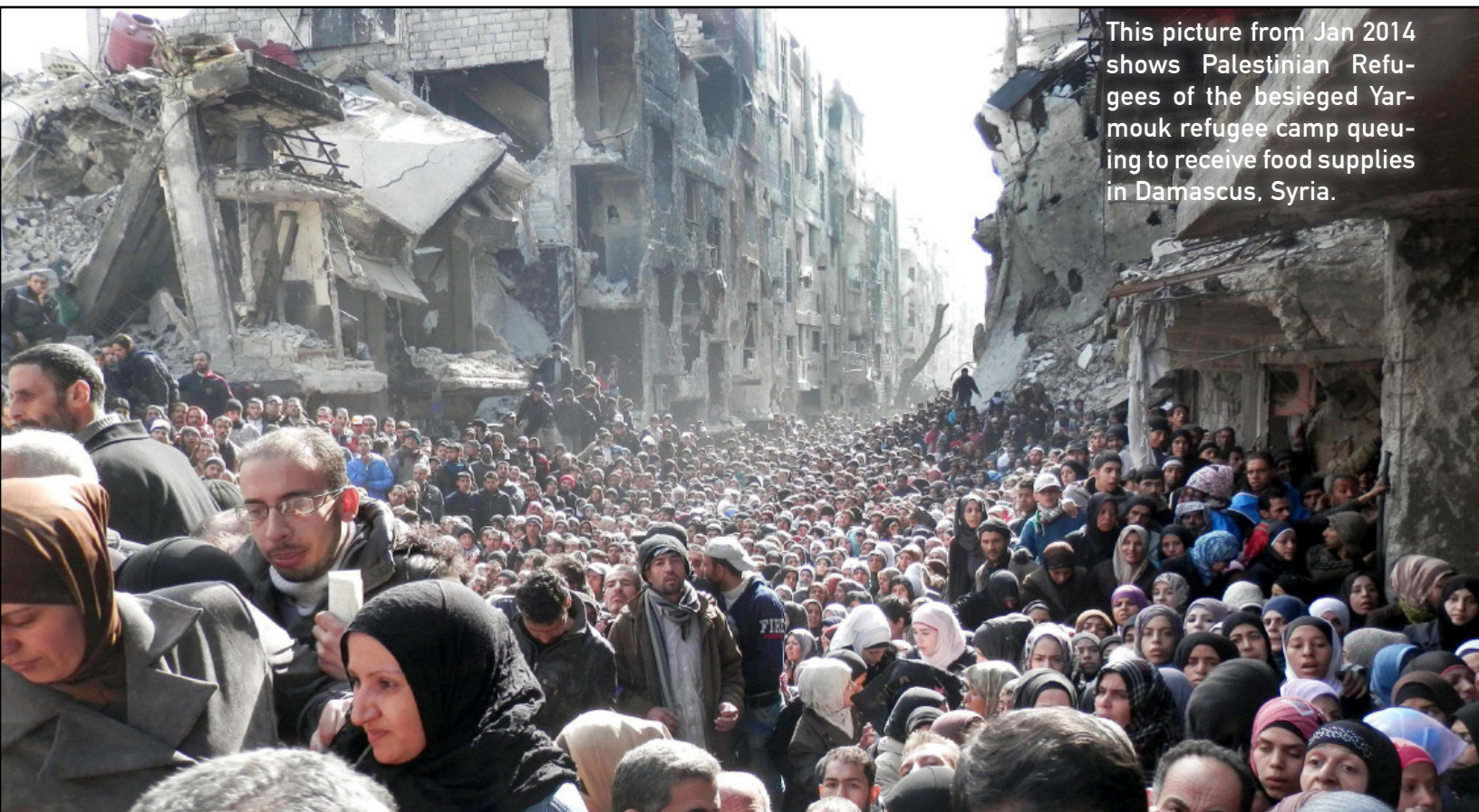
This picture from Jan 2014 shows Palestinian Refugees of the besieged Yarmouk refugee camp queuing to receive food supplies in Damascus, Syria.

As always, we welcome critical feedback on our theoretical works, either by way of email at revint-can@gmail.com or in the comments section of our website, at ri-ir.org .