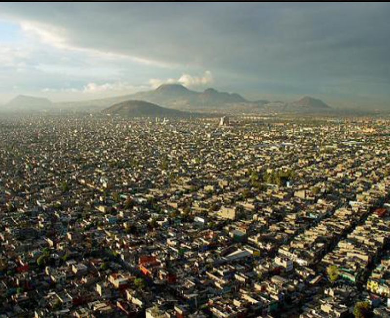
The factory isn't the only place where you can find high concentrations of proletarians. From top to bottom: New York's Queensbridge housing projects, a supermax prison, and a Mexico City slum.

with its fundamental social reservoir. 29