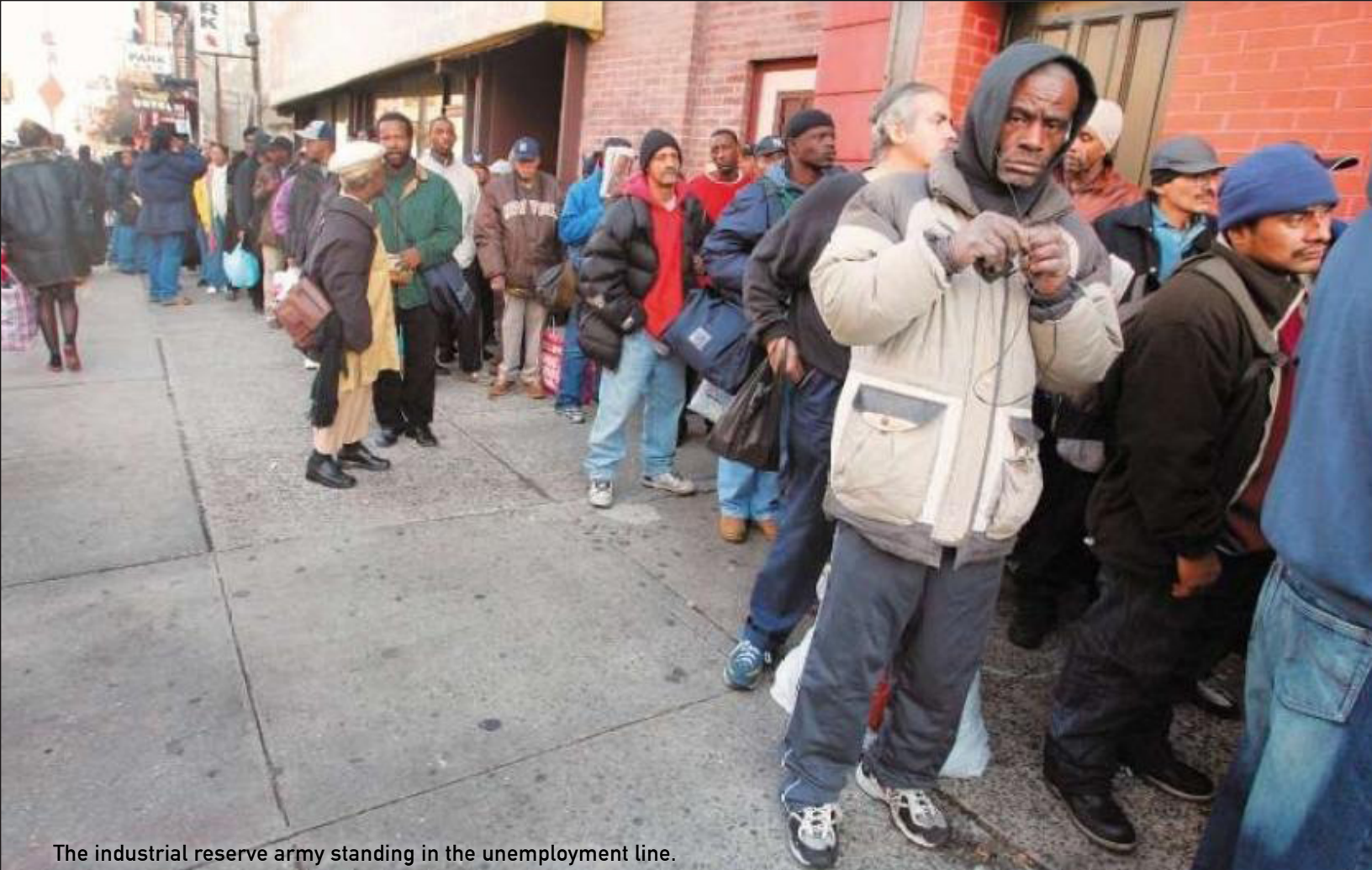
The industrial reserve army standing in the unemployment line.

capitalism not only exploits people but also squanders human potential by leaving, as a consequence of technological advances , so many people without the means to productively contribute to society, and thereby, under commodity exchange, without means of subsistence, is another stunning indication that it has outlived any progressive purpose.