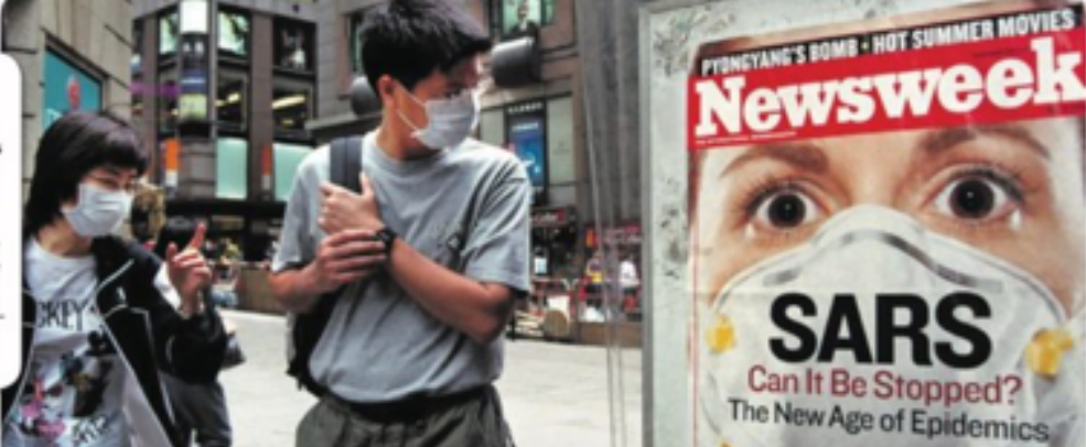
SARS versetzte die Welt 2003 in Schoekstarre. Alles blickte gespannt nach China. Am Ende waren die Zahlen versehwindend gering, Ohne Medienkampagne wäre SARS niemandem aufgefallen.

Im Sommer 2003 ging die Zahl der «Neuinfizierten» weltweit beständig zurück, das behauptete man zumindest. Offiziell endete die «SARS-Epidemie» mit 8006 Erkrankten und 774 Verstorbenen. Verschwindend geringe Zahlen. Bei aller Tragik für die Betroffenen und ihre Familien war das Gefahrenpotential, das SARS darstellte, geradezu lächerlich. Ohne die weltweite Durchführung von Tests wäre SARS niemandem aufgefallen.